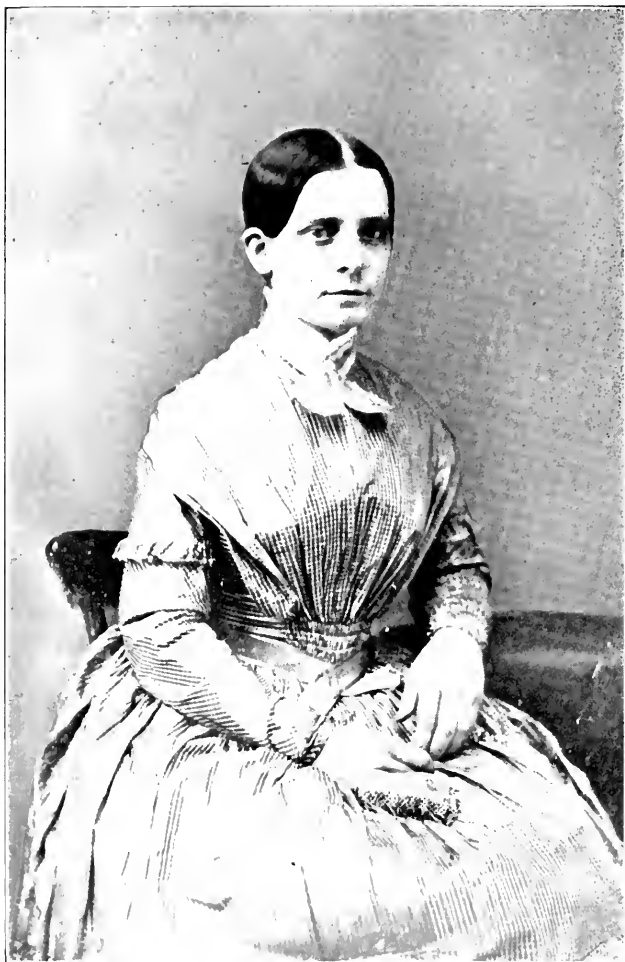
AS A YOUNG GIRL.