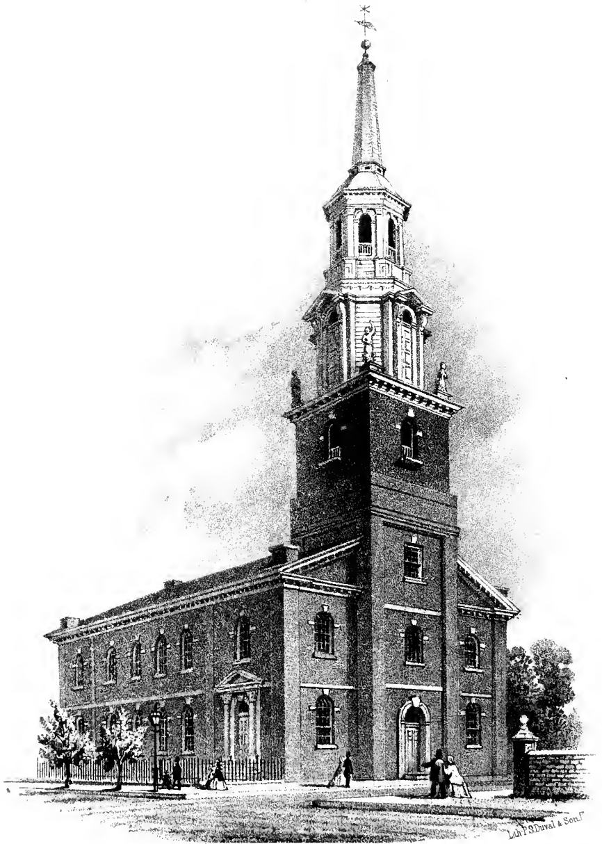
Evangelical Lutheran Church of the Holy Trinity.- Lancaster Pa.