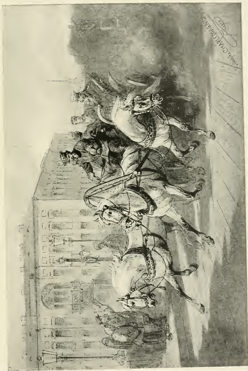
EMBASSY HOUSE, ST. PETERSBURG.

From a water-colour drawing by Charlemagne, 1864.