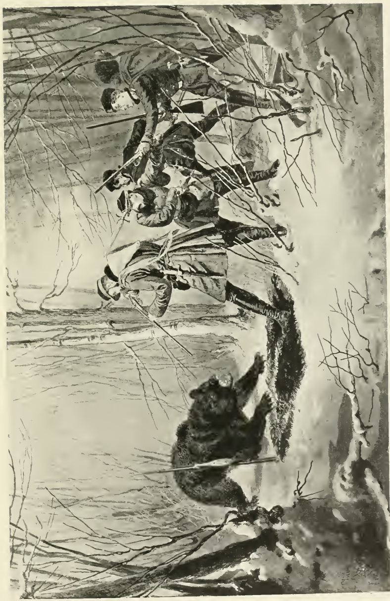
THE EMPEROR ALEXANDER II. AT CLOSE QUARTERS WITH A BEAR (February, 1864). From a sketch by Zichy.