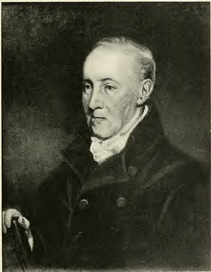
WILLIAM MITFORD (HISTORIAN OF GREECE)

From an oil painting by John Jackson, R.A.