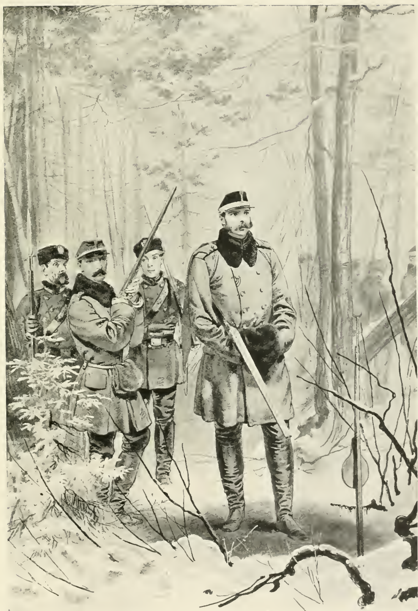
THE EMPEROR ALEXANDER II., 1864.