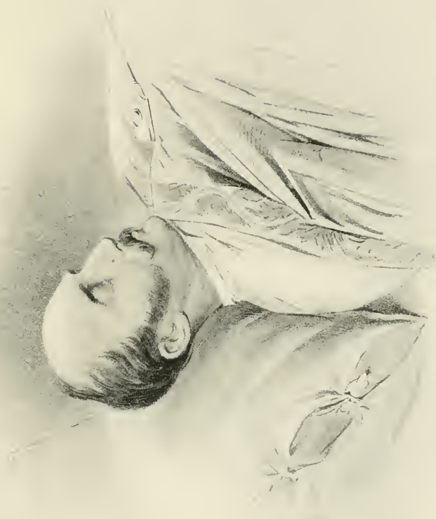
THE DEAD EMPEROR NICHOLAS I