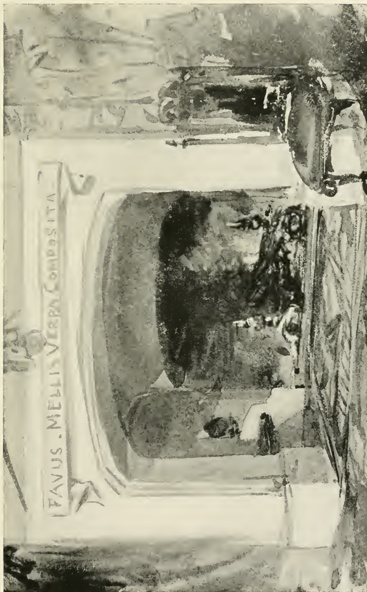
FIRE-PLACE IN EVANS' HOUSE.