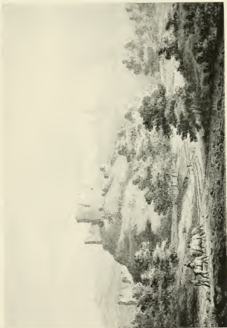
THE RUINS OF MITFORD CASTLE, NEAR MORPETH, NORTHUMBERLAND.