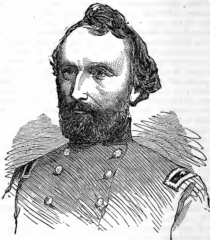
MAJOR-GENERAL JOHN A. McCLERNAND.