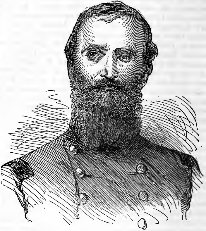
MAJOR-GENERAL ULYSSES S. GRANT.