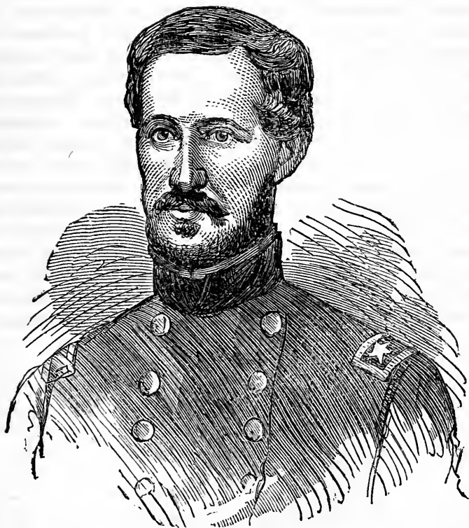
MAJOR-GENERAL WILLIAM STARKE ROSECRANS.