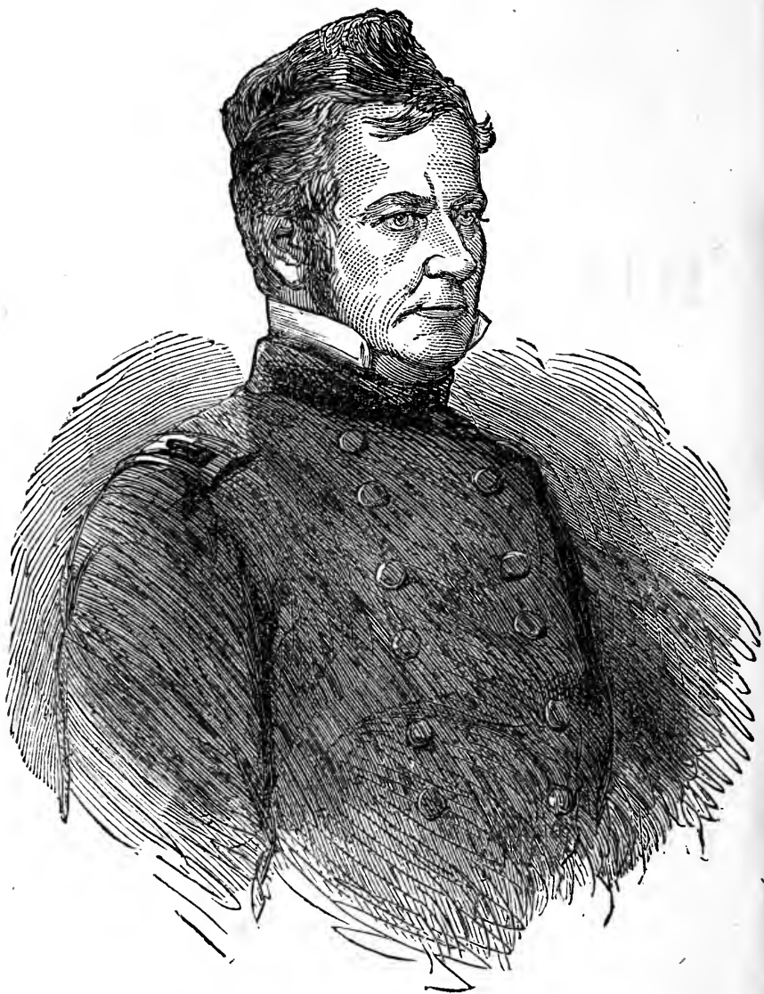
MAJOR-GENERAL JOSEPH HOOKER.