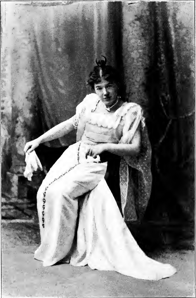
Ella Wheeler Wilcox