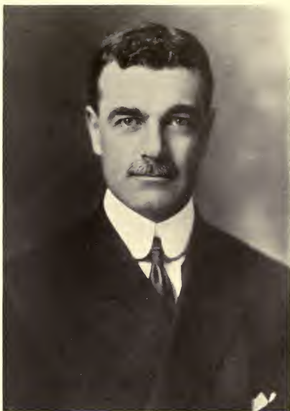
RICHARD M. BISSELL