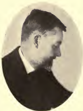
CHARLES R. CRANE Citizen of the World