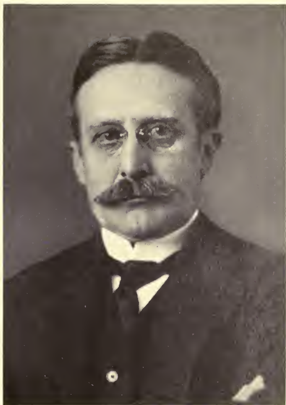
HARRY G. SELFRIDGE