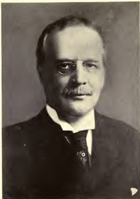
LESLIE CARTER Died September, 1908 Aged 57 years