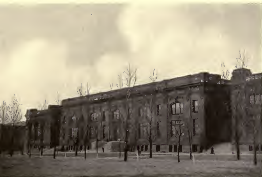
RADIO SCHOOL, U. S. N. TRAINING STATION GREAT LAKES