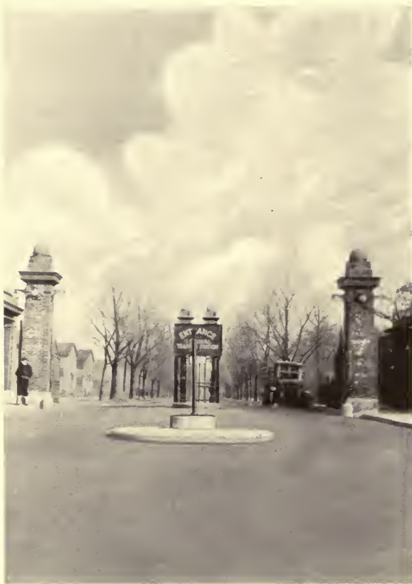
MAIN ENTRANCE GATE, U. S. NAVAL TRAINING STATION GREAT LAKES