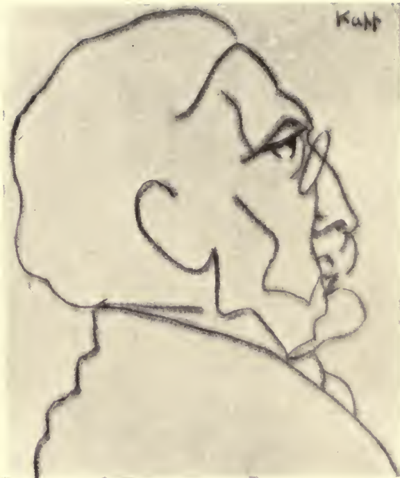
AS THE CARTOONIST OF THE MANCHESTER GUARDIAN PORTRAYS AN AMERICAN MERCHANT TRANSPORTED TO THE BRITISH METROPOLIS