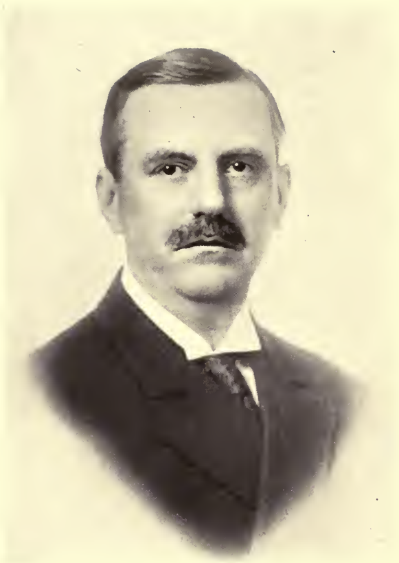
GRAEME STEWART Born 1853. Died 1905