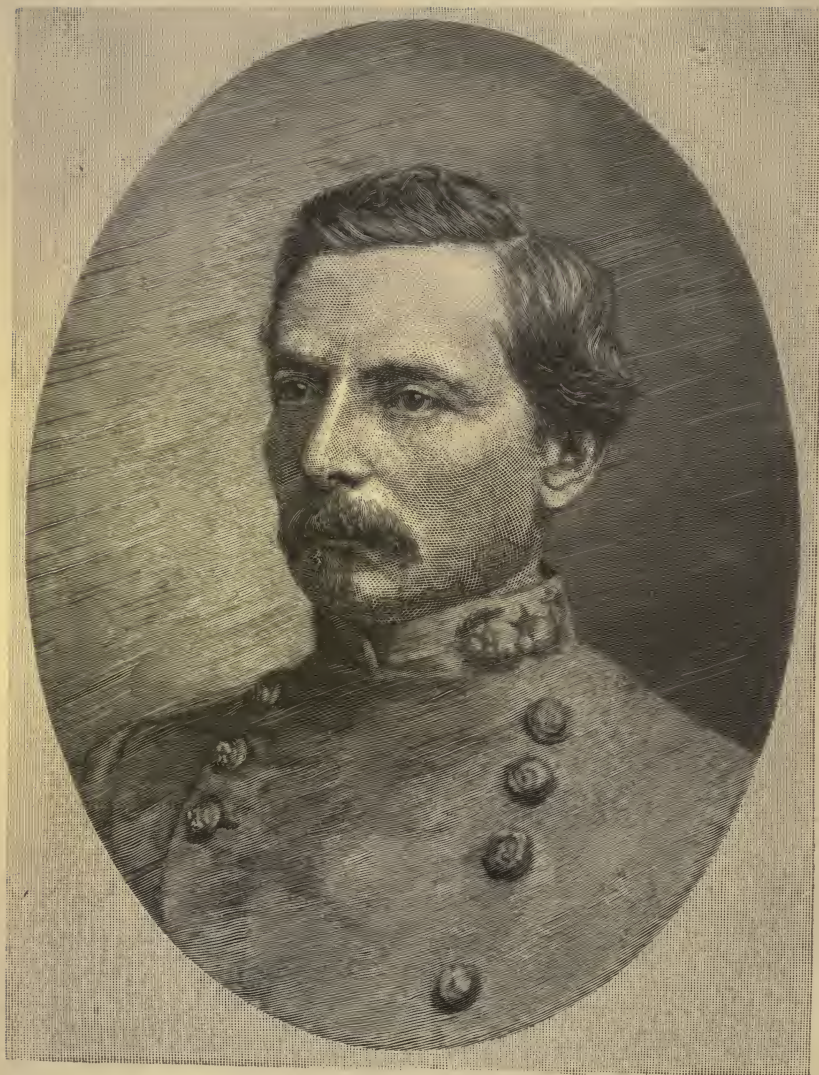
From a photograph taken in 1865.