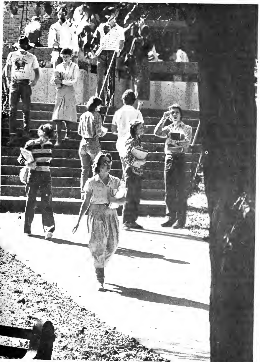
MILLSAPS-WILSON LIBRARY Jackson, Mississippi