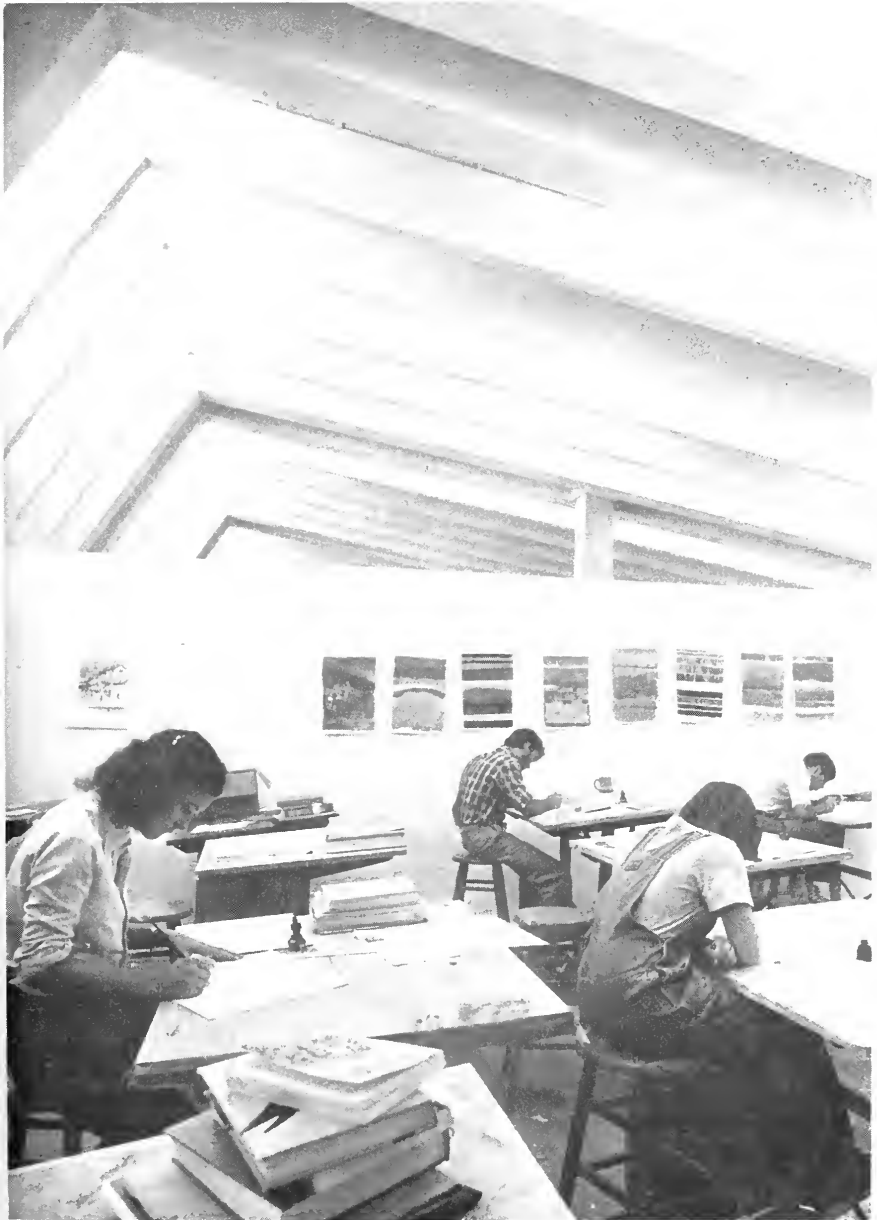
MILLSAPS · WILSON LIBRARY JACKSON, MS. 39210