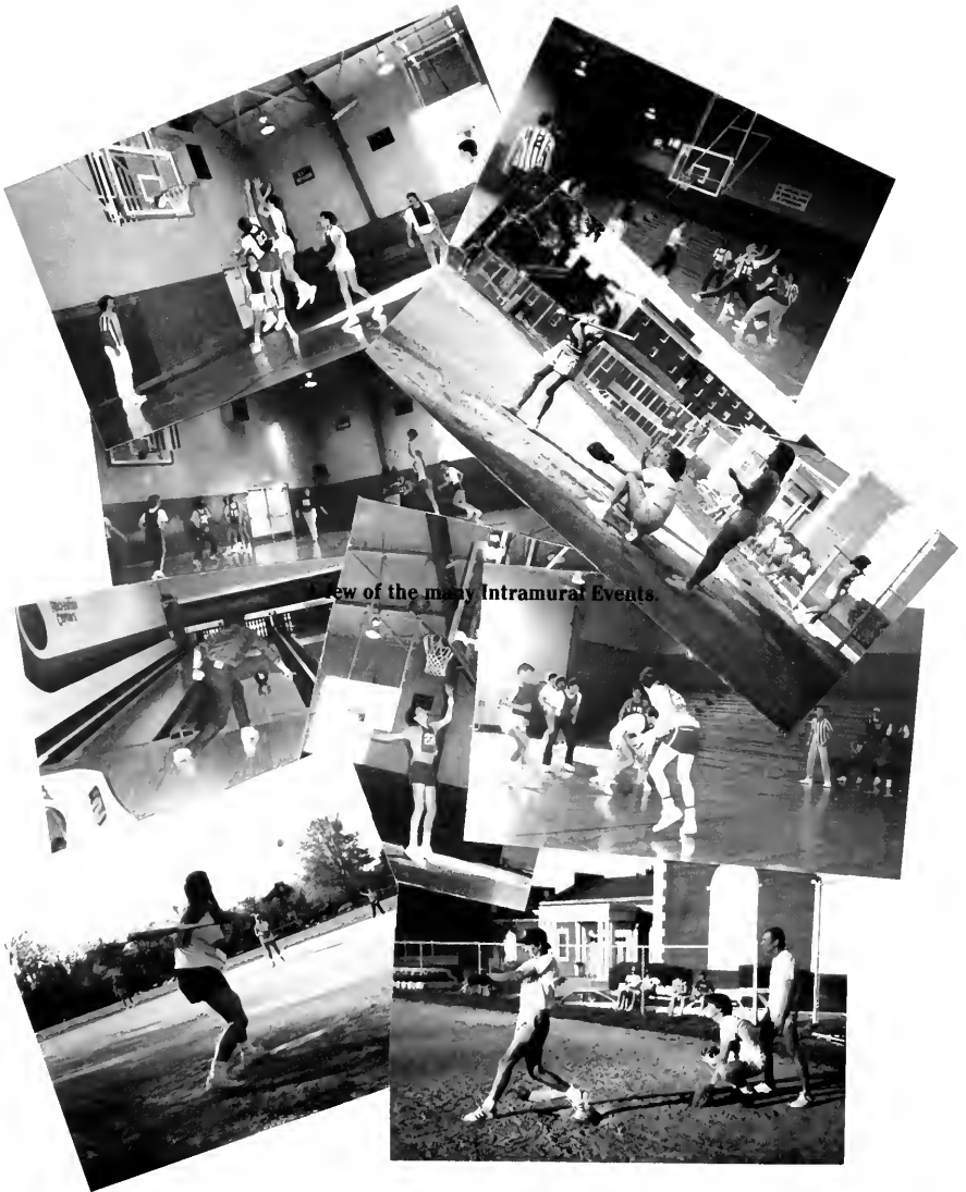
A few of the many Intramural Events.