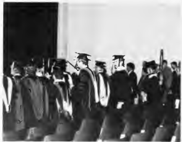
The faculty proceeding during January convocation