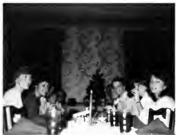
Students enjoying the annual Christmas dinner.