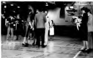
1985 Homecoming sets a historical moment by selecting a King and Queen.