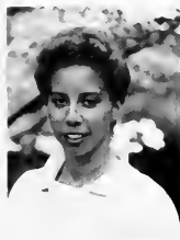
Dawn Yvette Ashby Art