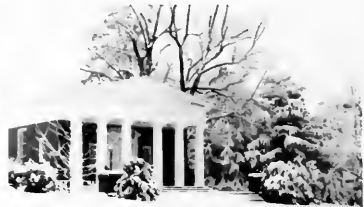
Hanes Finch Chapel