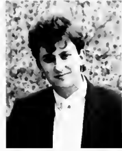
Daniel Alexander Hall Recreation