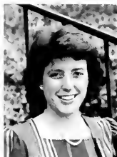
Mary Kathryn Rainey Recreation