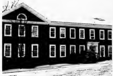
Arts and Science