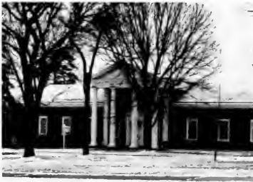
James A. Jones Library