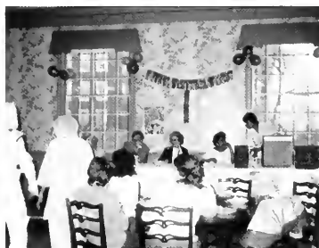
GC celebrates Mardi Gras "Cajun" style.