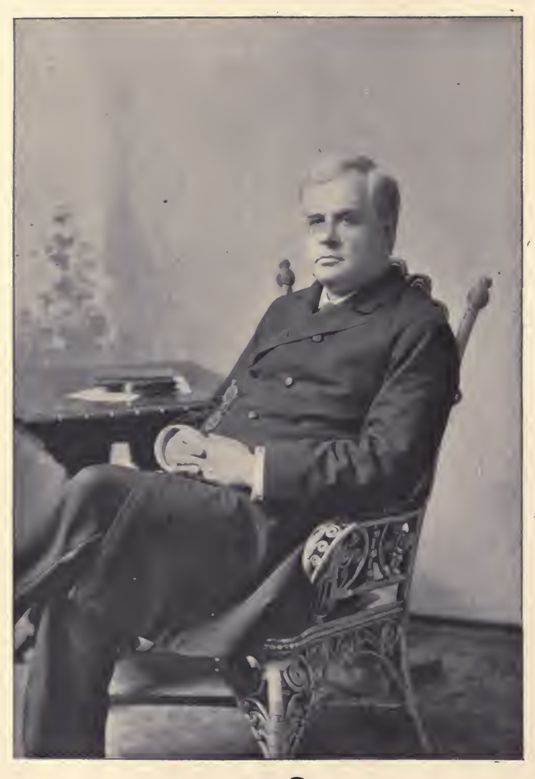
1. 9. gorða