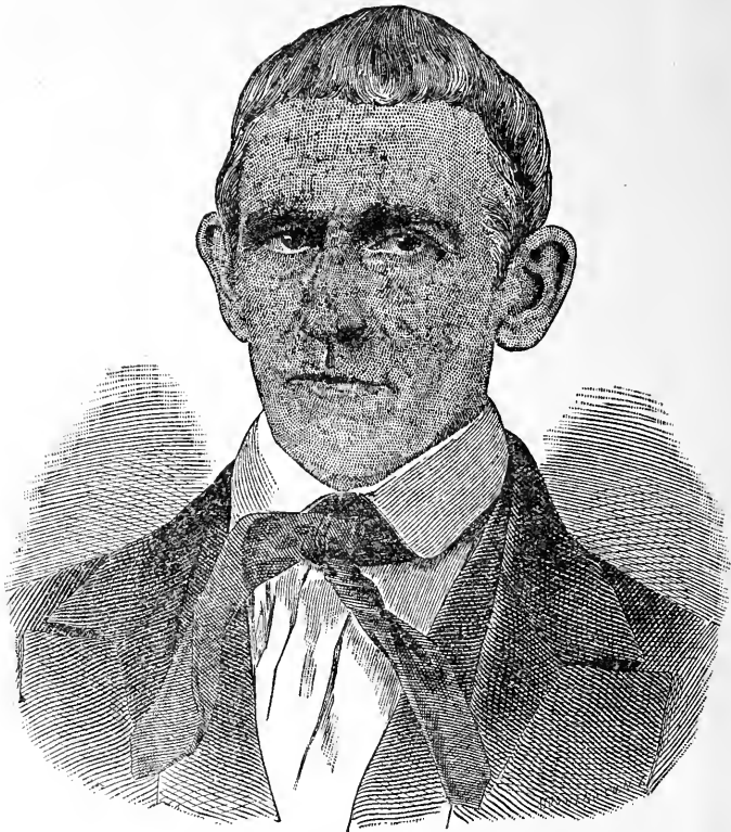
ELD. FRANCIS CALLOWAY, FIRST MODERATOR OF THE EAST LIBERTY ASSOCIATION. BORN FEB. 17, 1792; DIED APRIL 4, 1864.