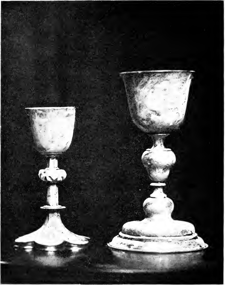
Two old chalices at the church of SS. Peter and Paul, Salter's Hall, Newport, Shropshire, formerly at Longford Hall.