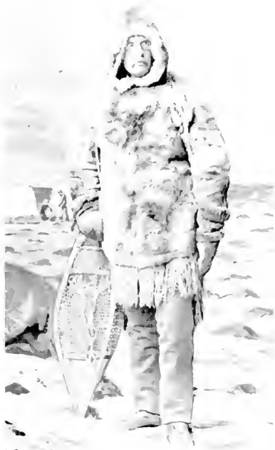
FIG. 3.—J. Burr Tyrrell (1858–1957), a pioneer explorer of the Barren Grounds, in an Eskimo suit worn on a tramp from Churchill to Lake Winnipeg, 1893 (see pages 9–10). (From J. W. Tyrrell, 1908: pl. opp. p. 202.)