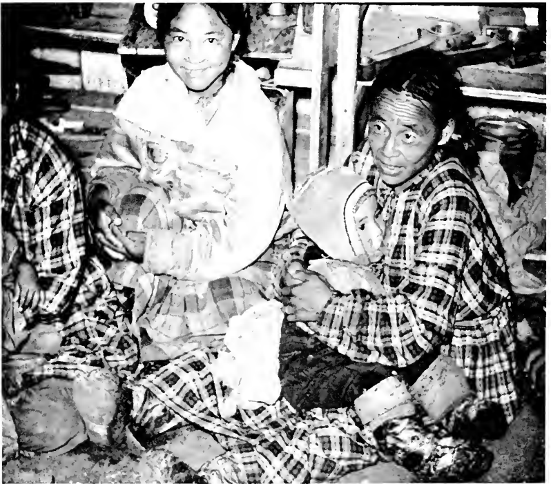
FIG. 2.—Eskimo women and a four-year-old nursing child. Ennadai Lake, 1954.