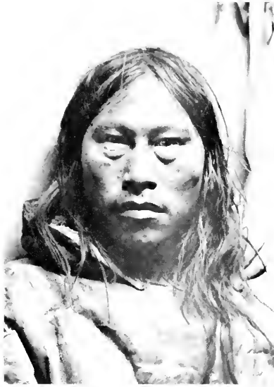
FIG. 1.—Angwokook. October 6.