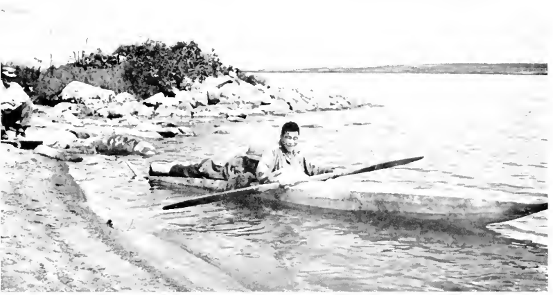
FIG. 1.—Two Eskimo youths and a kayak. One with a double-bladed paddle; the other a deck passenger. Ennadai Lake, July, 1954.