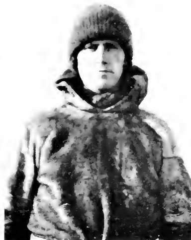
FIG. 4.—Kaj Birket-Smith (1893–. . .) on the Filth Thule Expedition, 1922; author of The Caribou Eskimo (1929); chief keeper of the Ethnographic Department of the National Museum (Copenhagen).