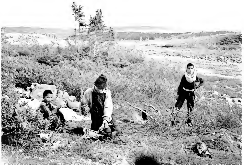
FIG. 2.—The young caribou-hunters in camp on Little River. August 31.