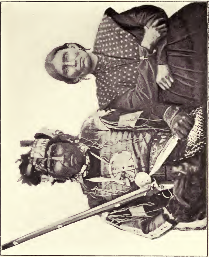
SHINGWAUK AND WIFE.