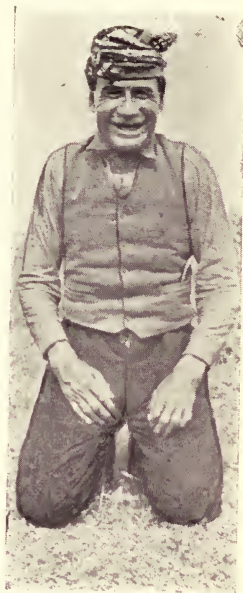
OUR INDIAN COOK.