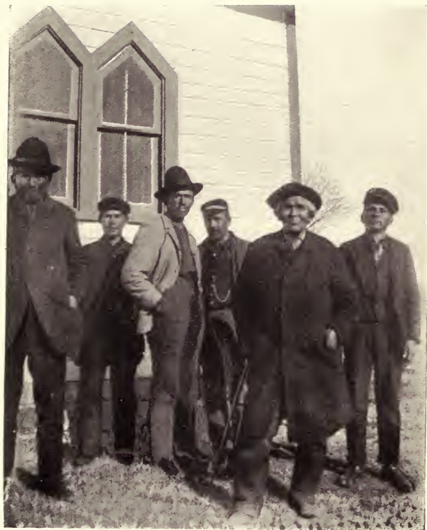
GROUP OF CHRISTIAN INDIANS, GARDEN RIVER.