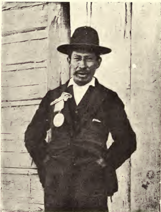
CHIEF AT SPANISH RIVER.