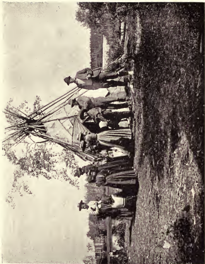
GROUP OF INDIANS AND WIGWAM.