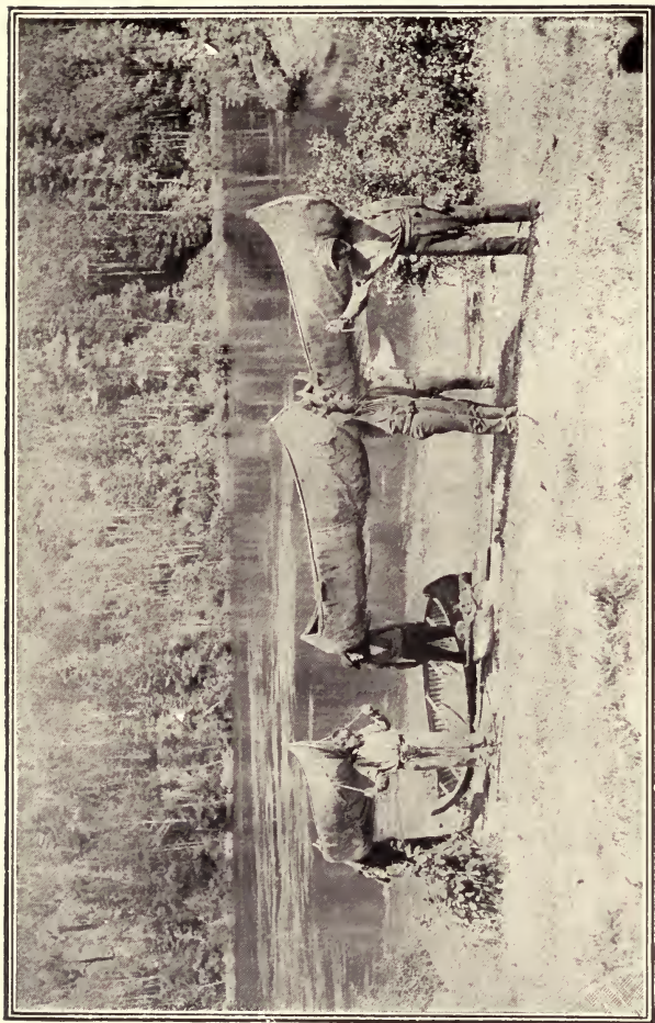
ON THE WAY TO THE WHITE CHUTE.