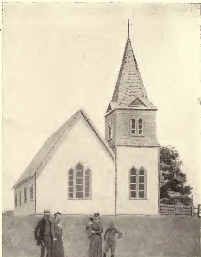
INDIAN CHURCH, GARDEN RIVER.