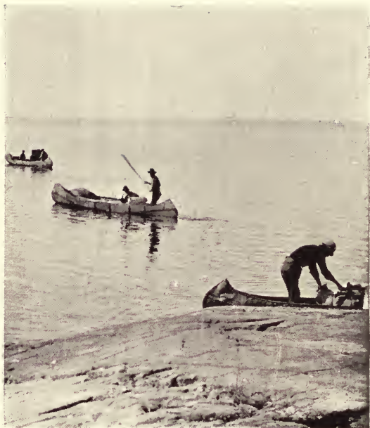
CANOES WITH BAGGAGE STARTING OFF, LAKE NEPIGON.