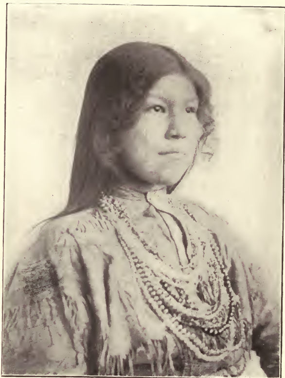
AN INDIAN GIRL.