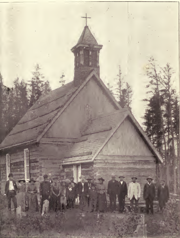
NEPIGON CHURCH, LAKE NEPIGON.