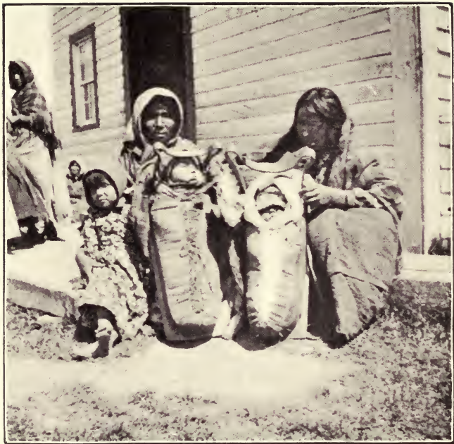
INDIAN MOTHERS AND BABES.