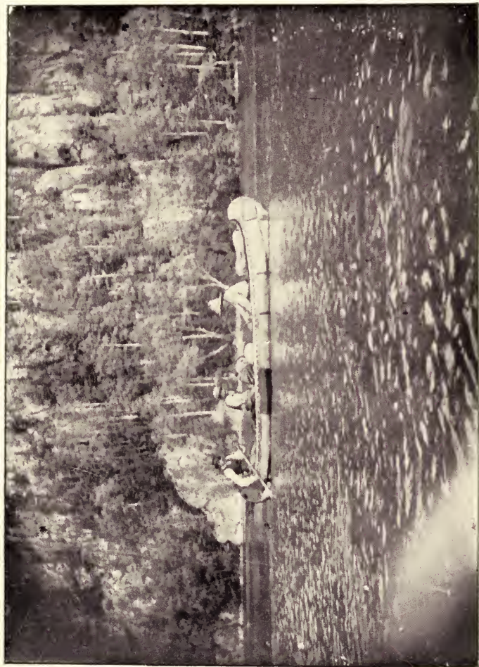
NEGIGOSHTEQUAN, LAKE NEPIGON.