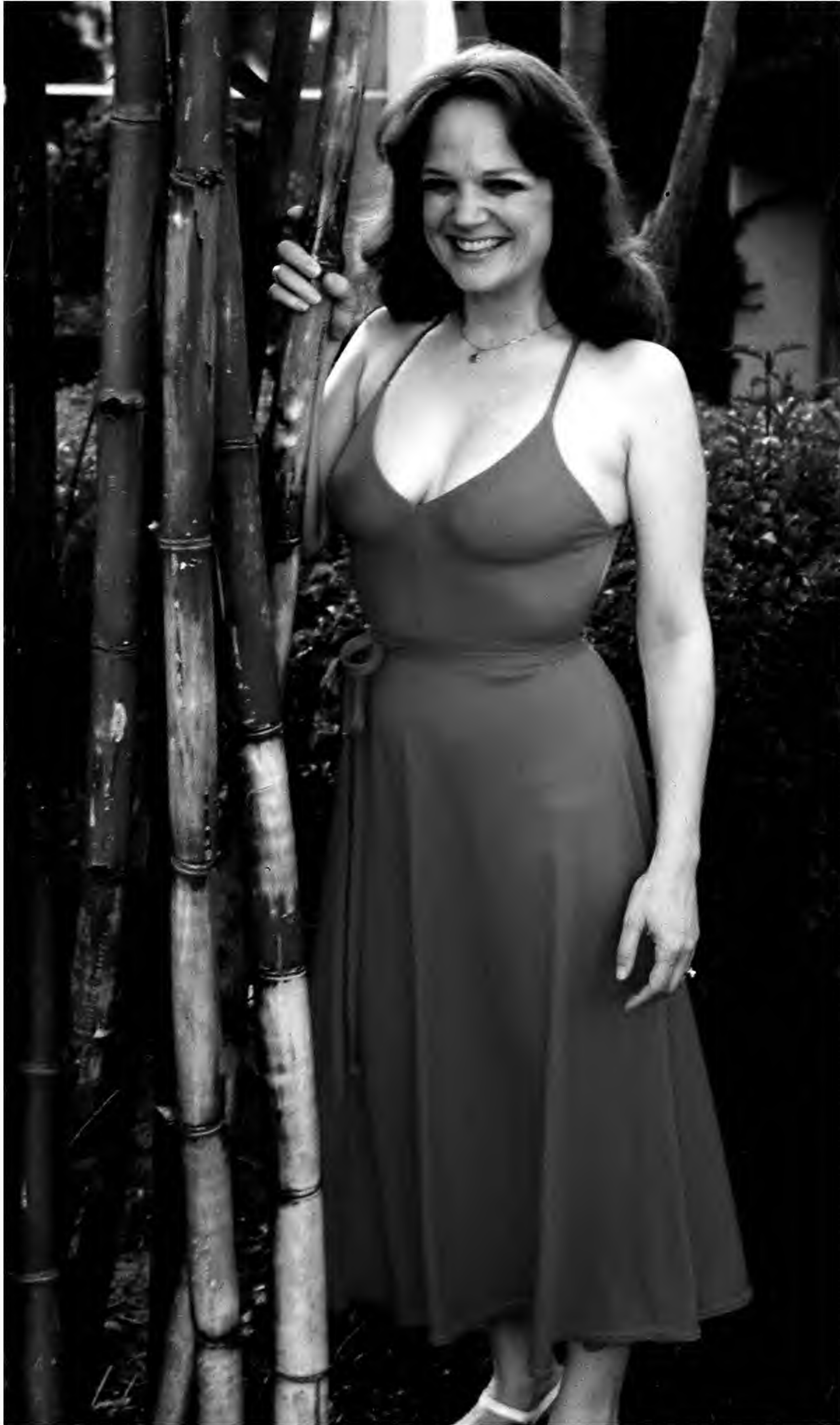
Figure 3. The eponym, in Monterrey Mexico, 1983.