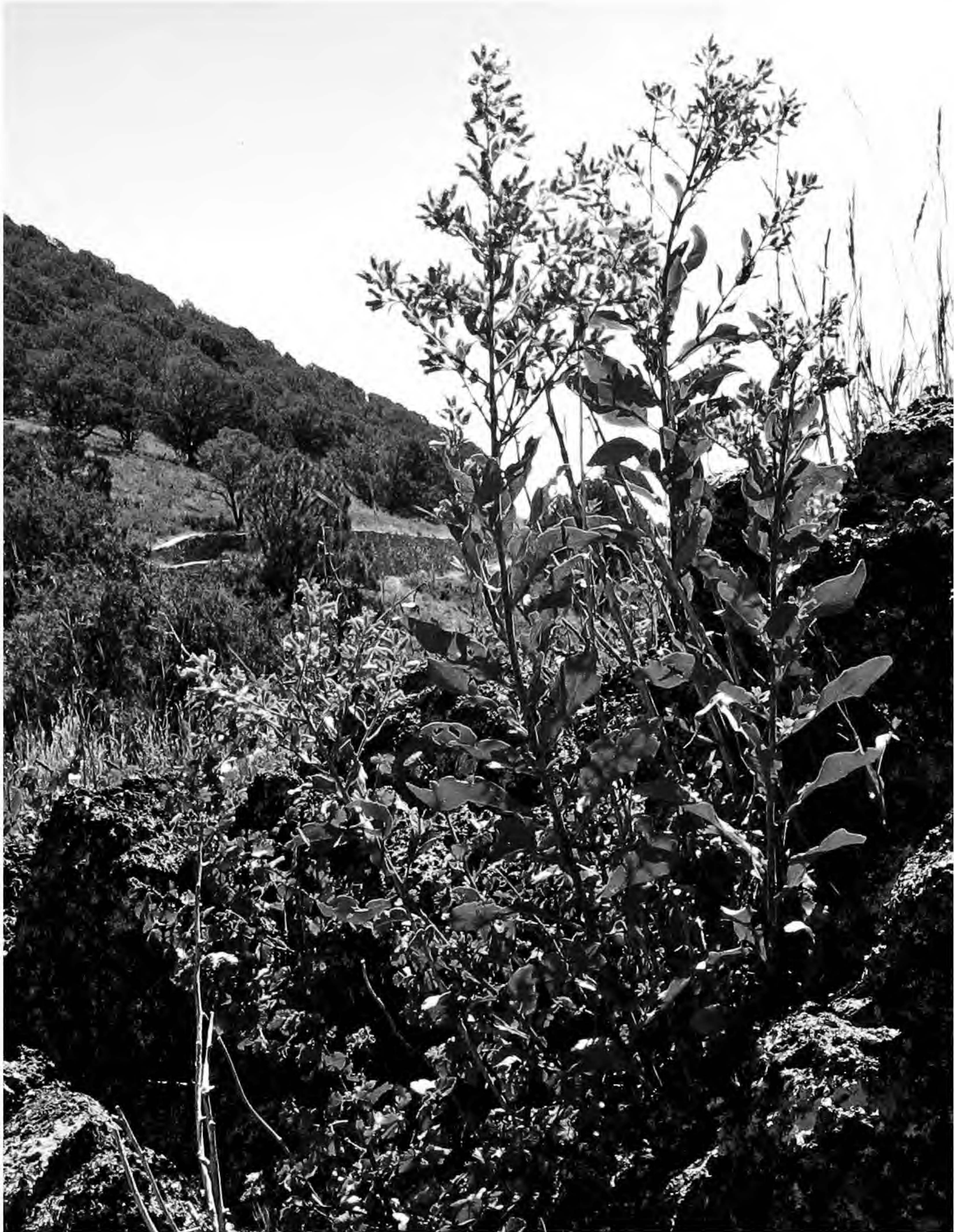
Figure 13. Solidago capulinensis capitulescence structure, Capulin Volcano National Monument. Photo by Lowrey, 11 September 2010.