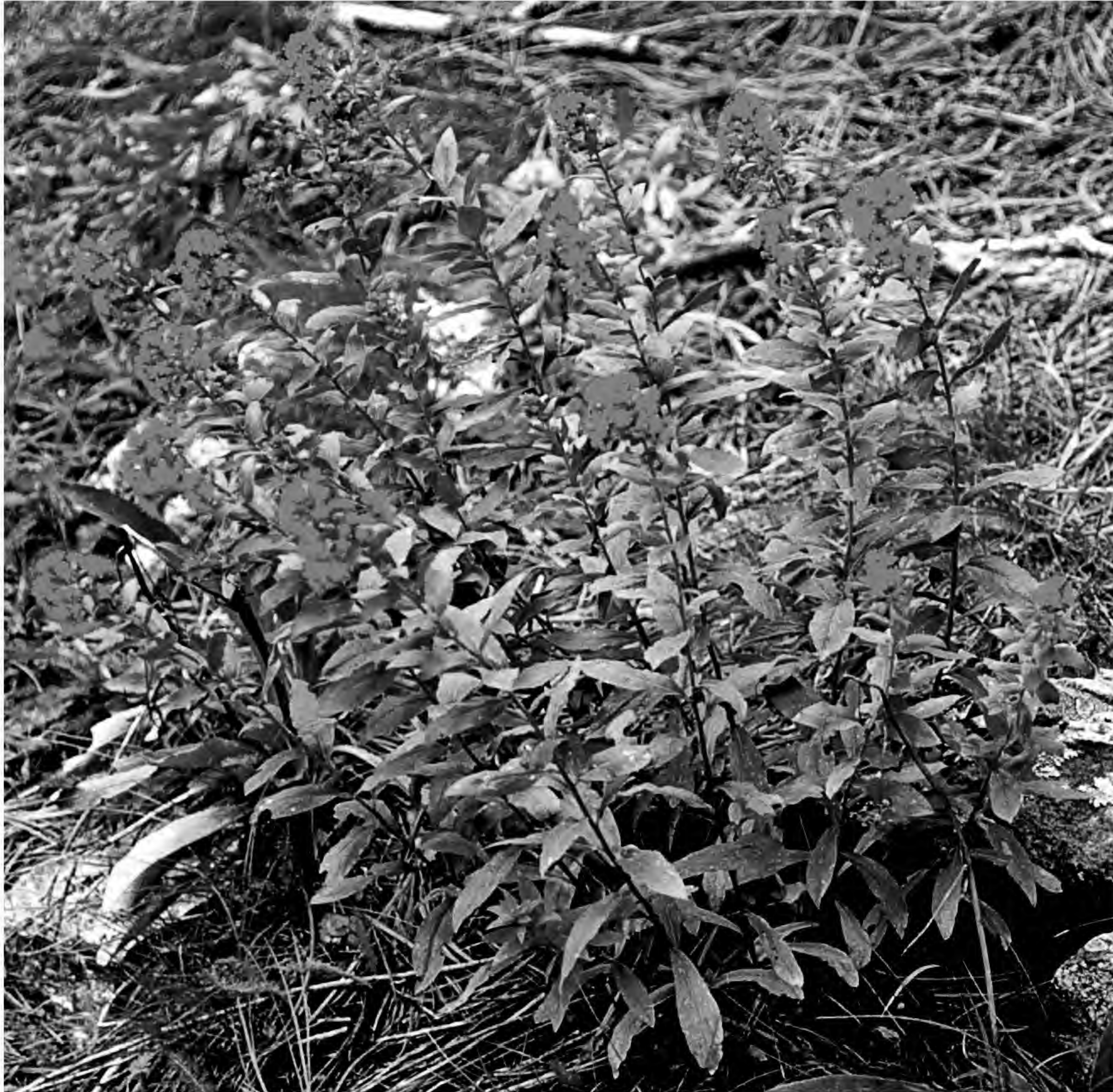
Figure 5. Solidago wrightii (Semple & Heard 7930) in Arizona.