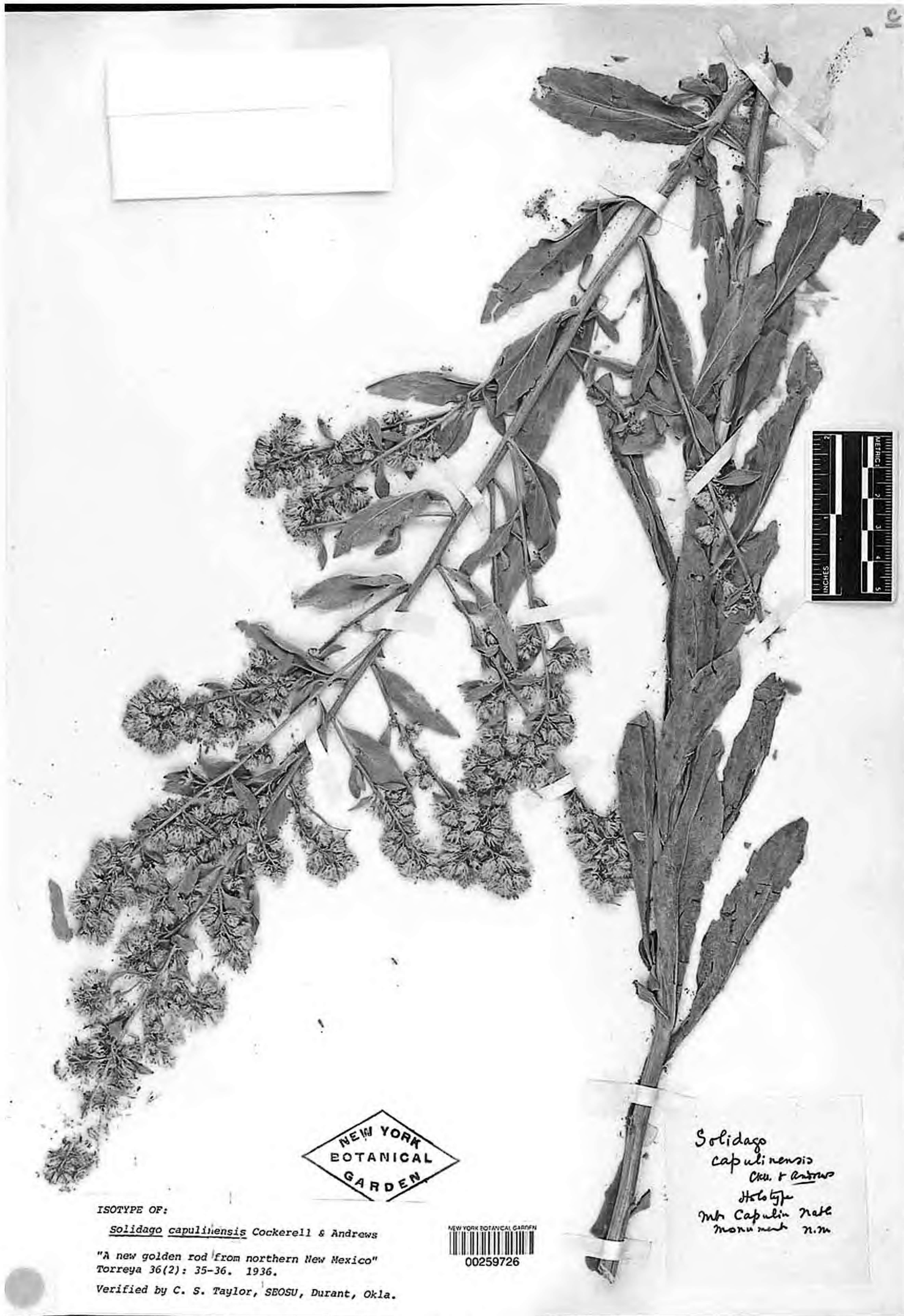
Figure 2. Holotype of Solidago capulinensis (NY).