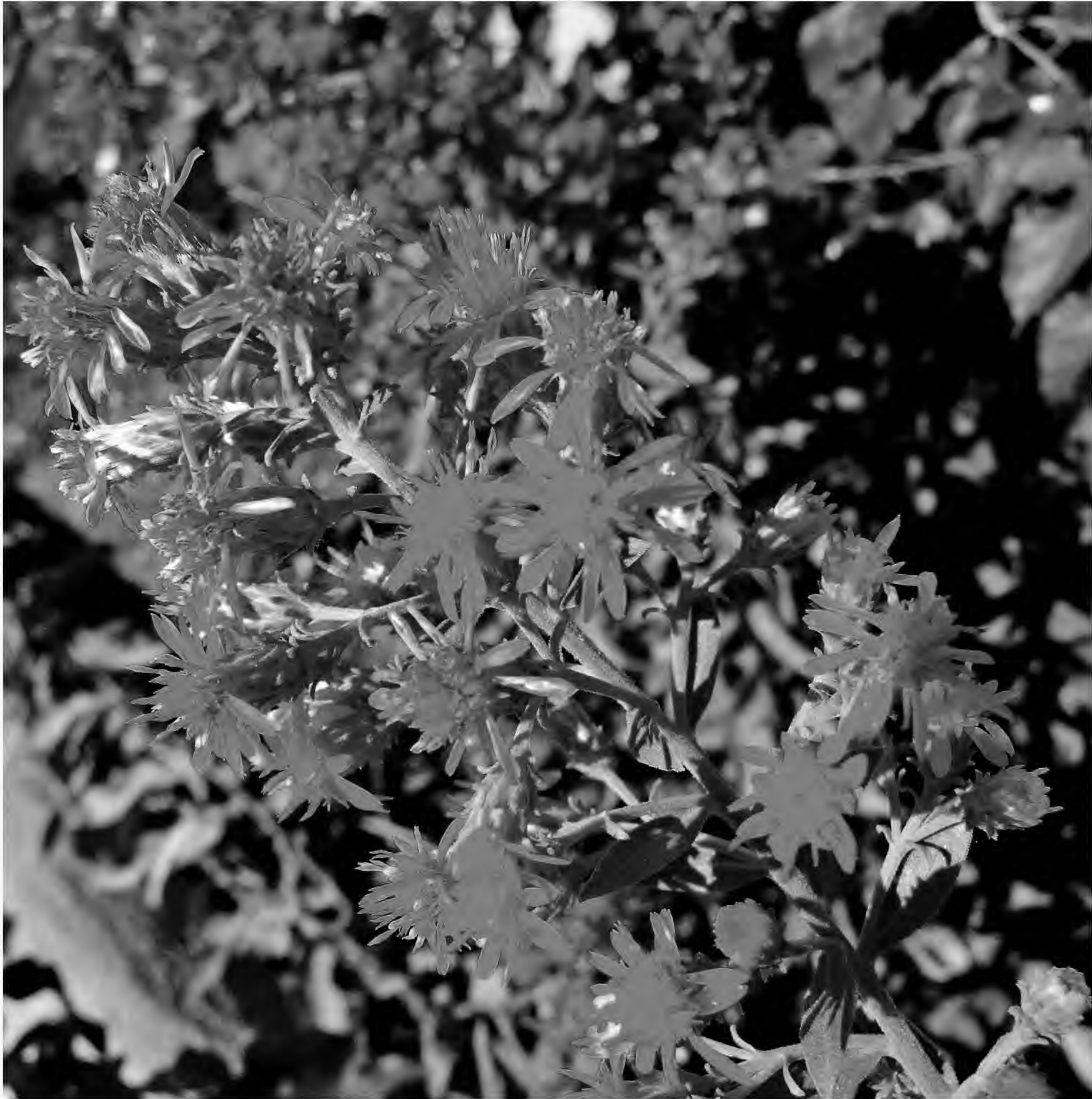
Figure 9. Close-up of cultivated plant of Solidago capulinensis at the Pueblo Nature Center, same as in Figs. 5 and 6. Photo by Bill Adams, 3 September 2010.