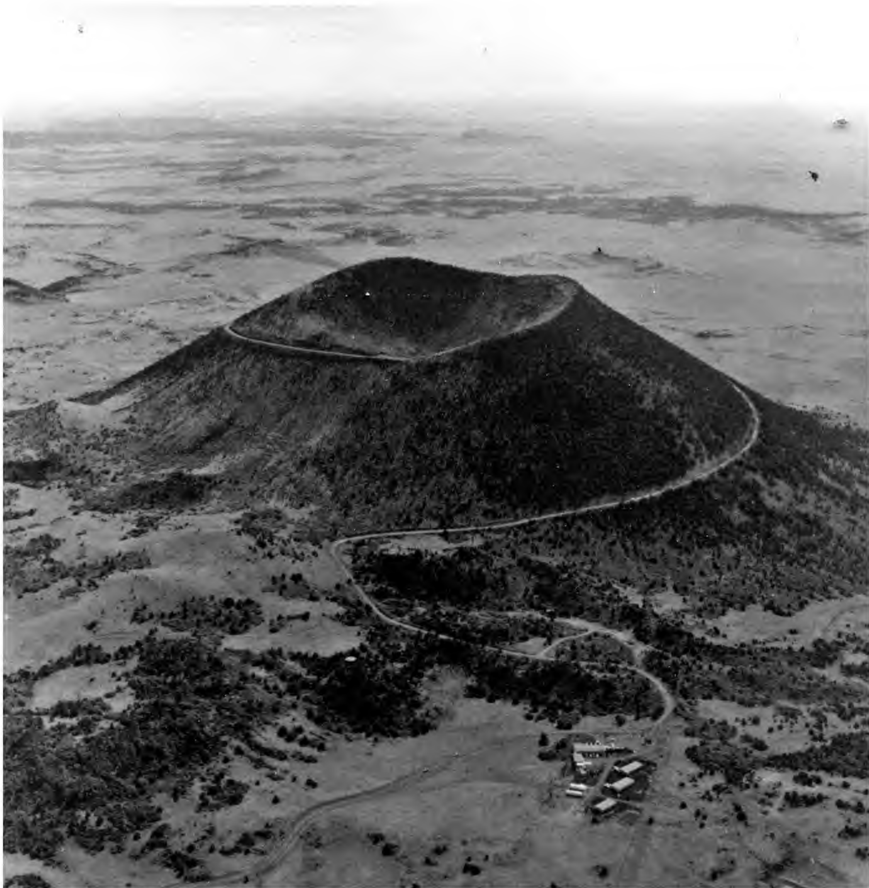
Figure 16. Capulin Volcano National Monument, New Mexico. Capulin Mountain, a huge cinder cone that erupted between 4,000 and 10,000 years ago, rises more than 1,000 feet above its base.