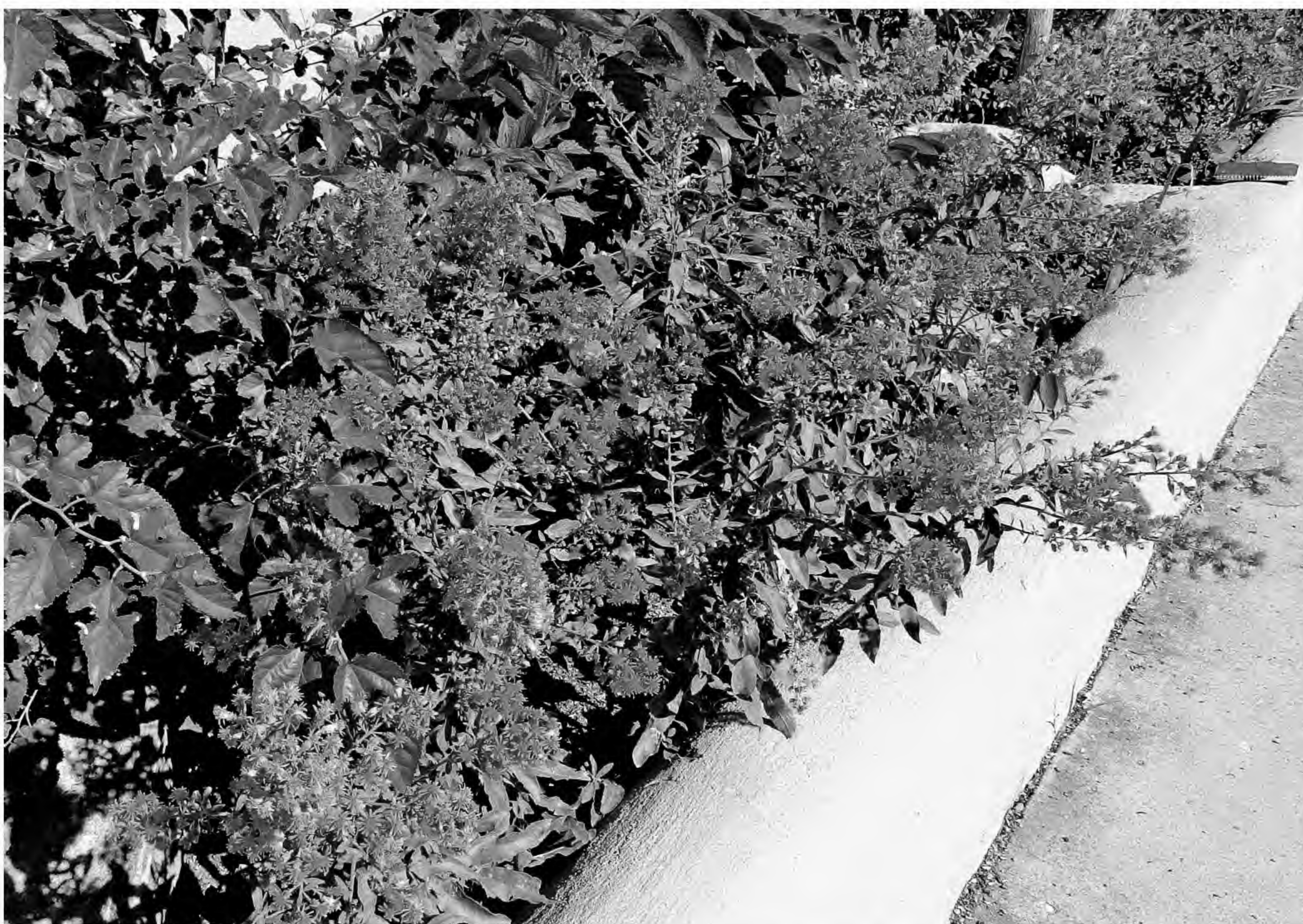
Figure 7. Cultivated plant of Solidago capulinensis at the Pueblo Nature Center, same as in Fig. 5. Photo by Bill Adams, 3 September 2010.