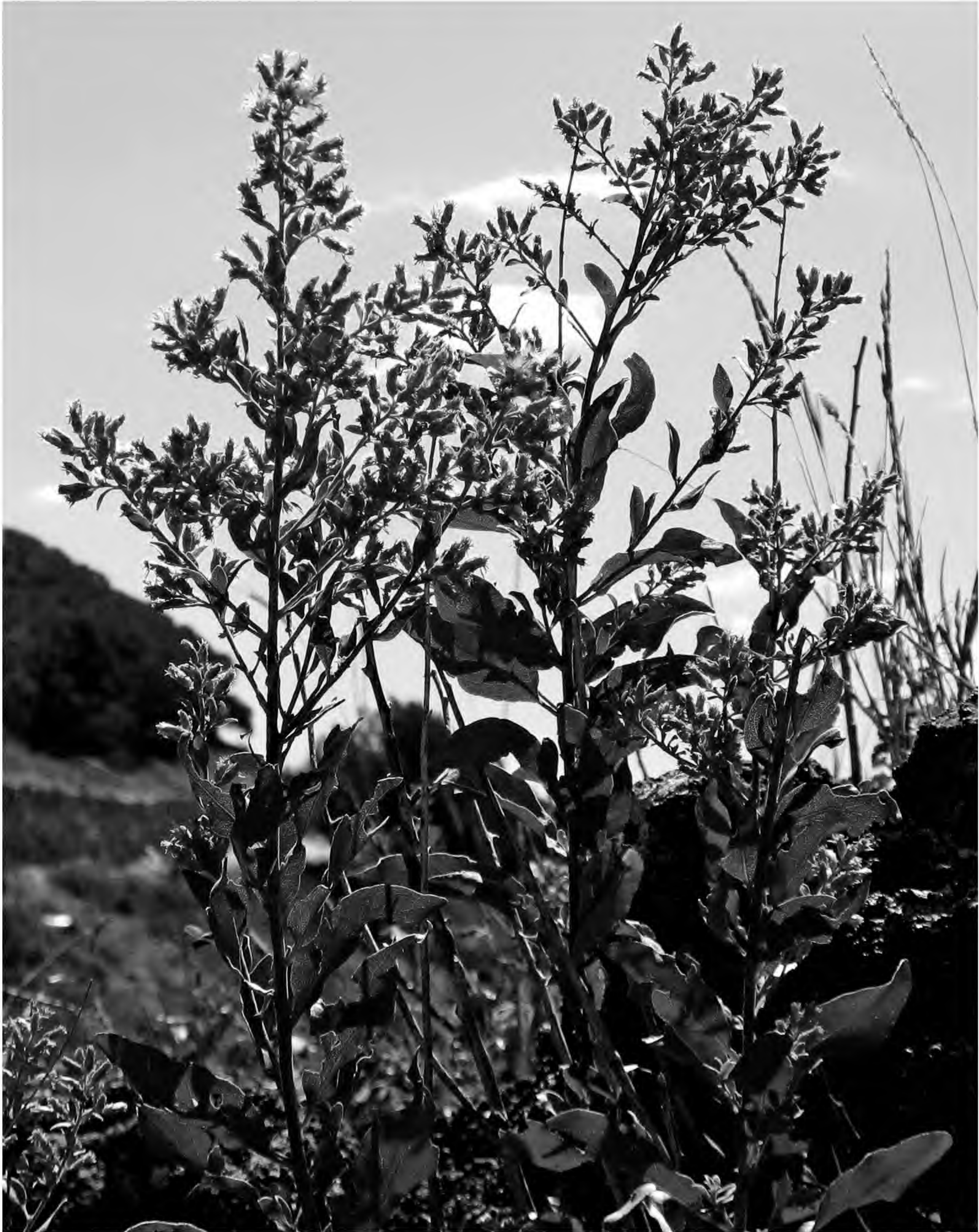
Figure 14. Solidago capulinensis capitulescence structure, Capulin Volcano National Monument. 11 September 2010.