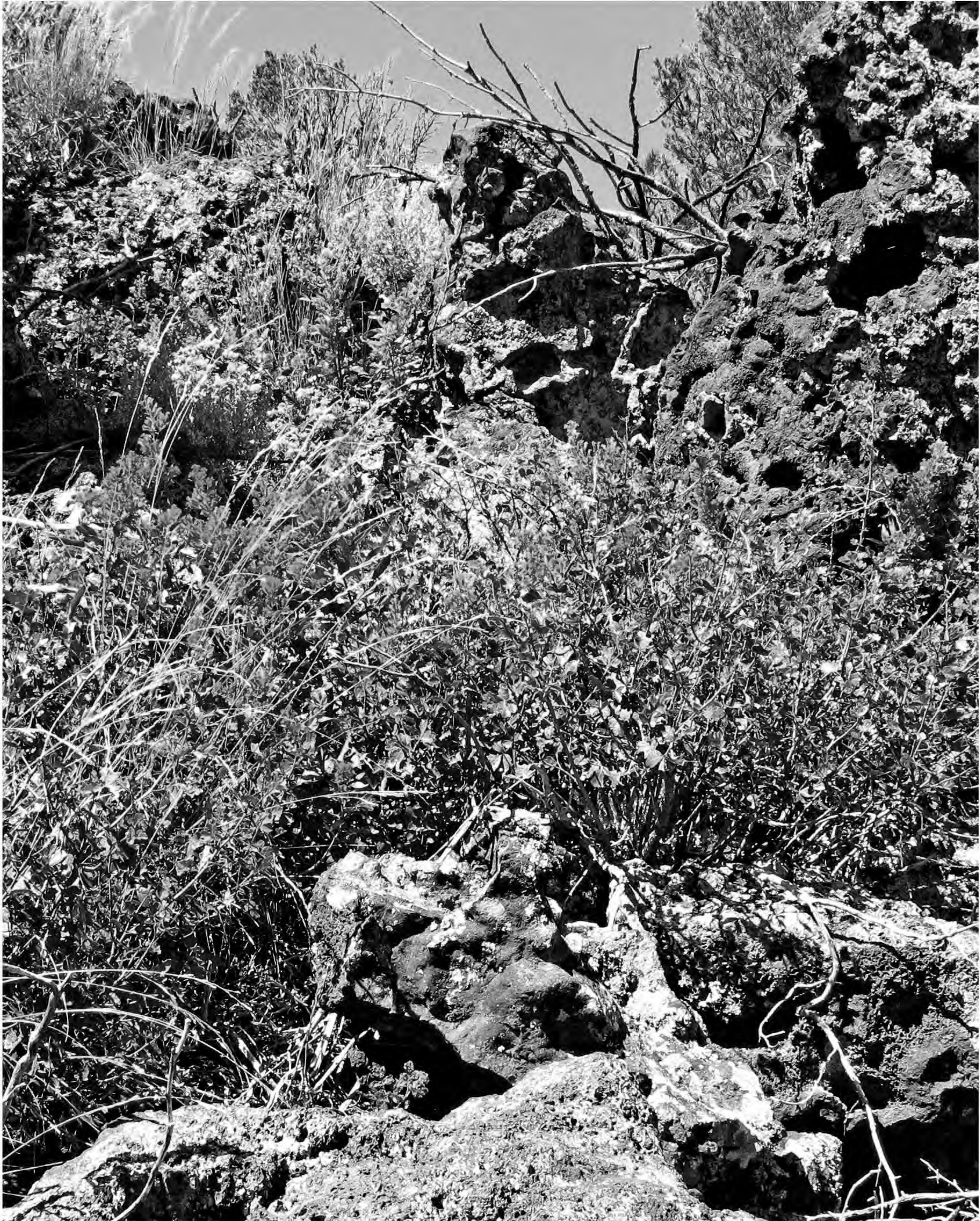
Figure 11. Habitat of Solidago capulinensis among basalt boulders, Capulin Volcano National Monument. 11 September 2010.