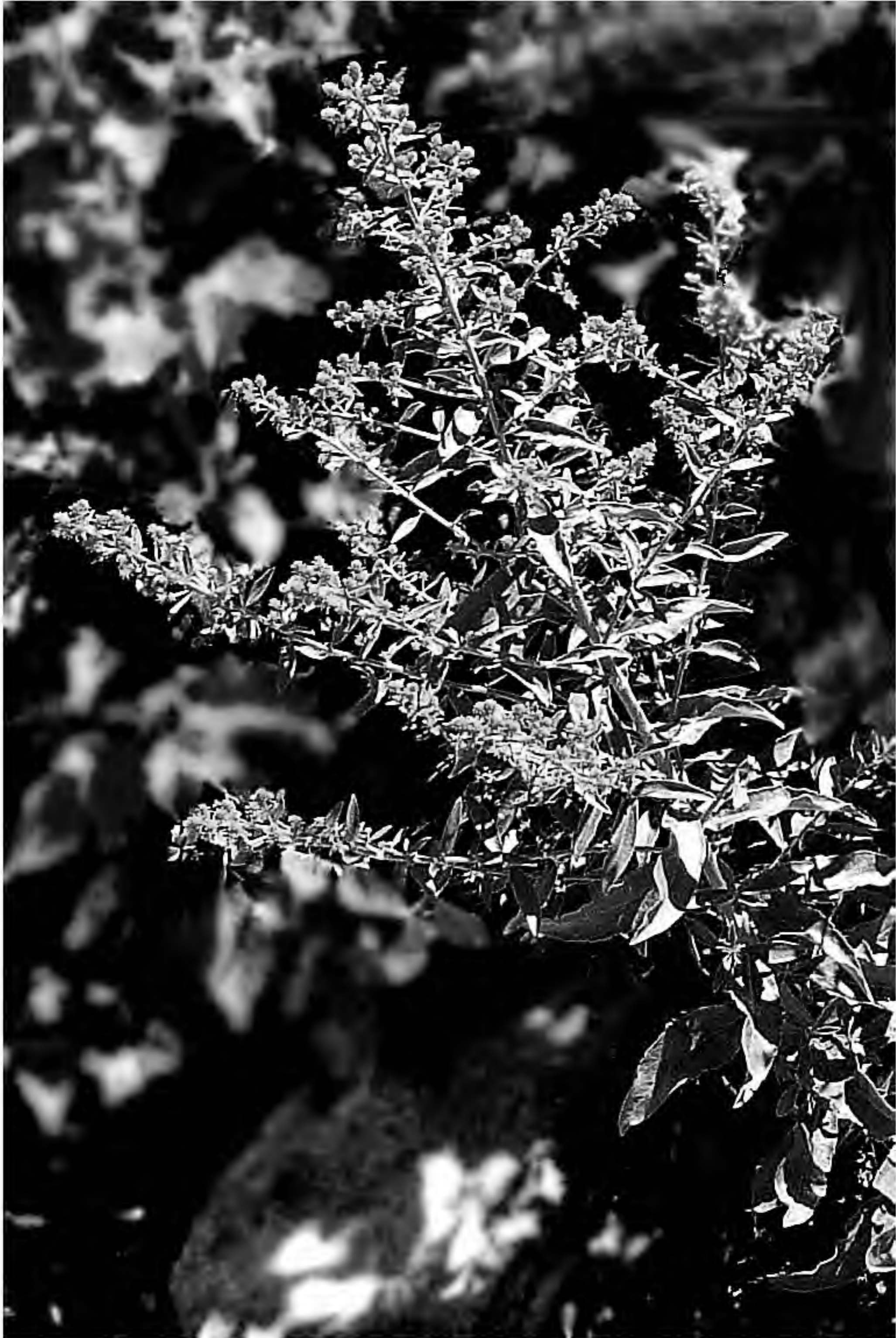
Figure 8. Branch of cultivated Solidago capulinensis at the Pueblo Nature Center. In bud but not yet in flower. Photo by Nesom, 3 August 2010.