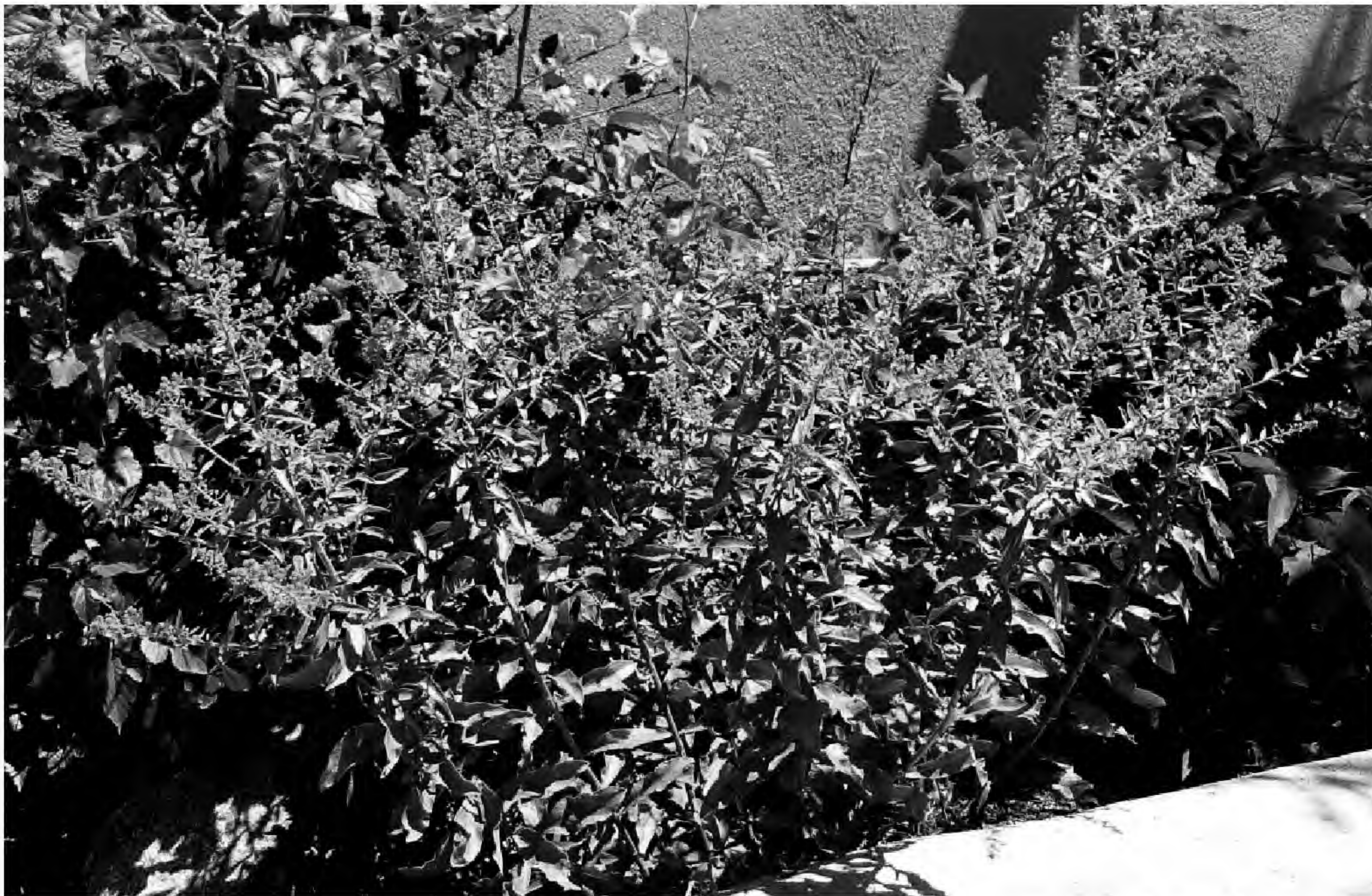
Figure 6. Cultivated plant of Solidago capulinensis at the Pueblo Nature Center. In bud but not yet in flower. Photo by Nesom, 3 August 2010.