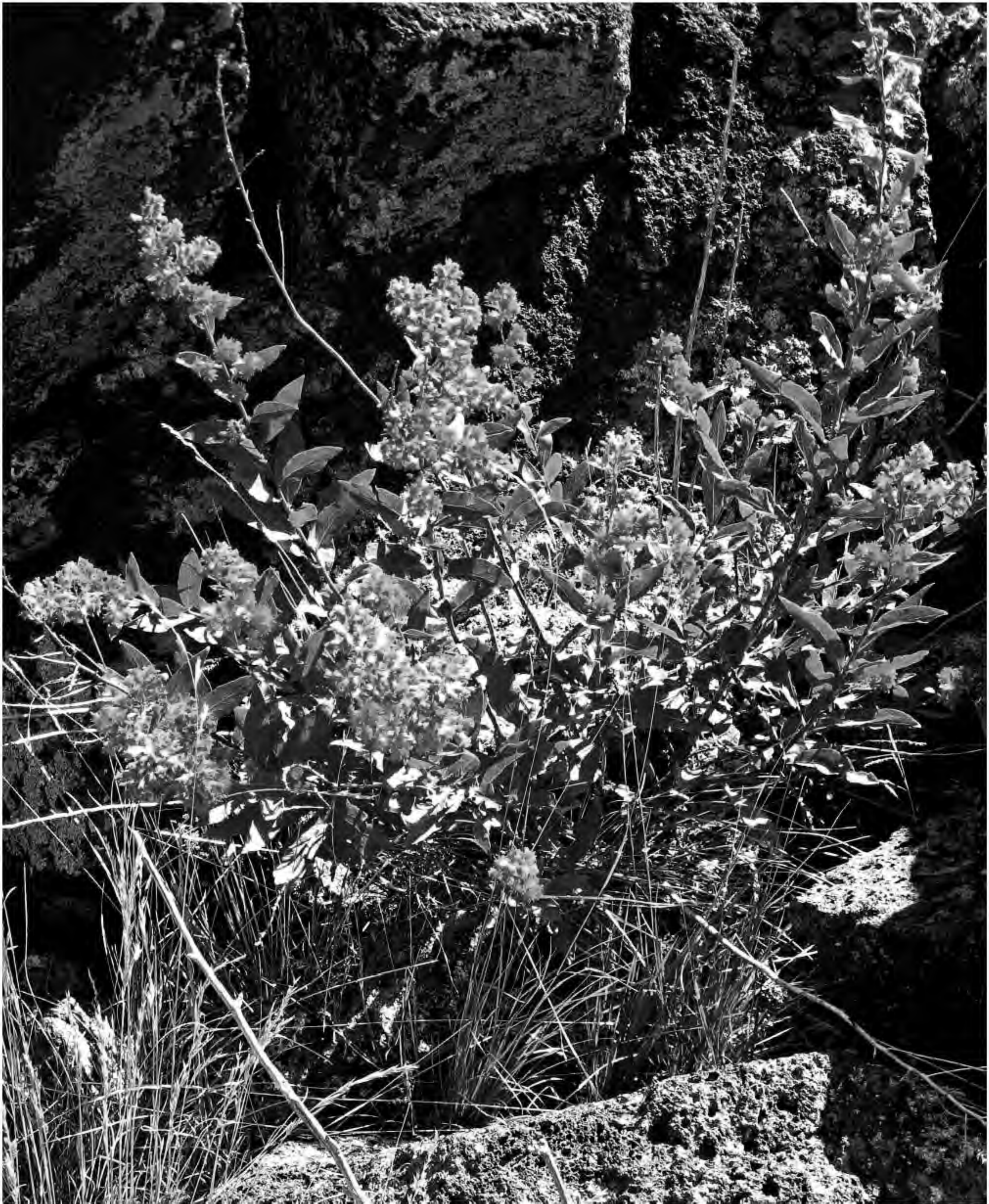
Figure 10. Solidago capulinensis in natural habitat among basalt boulders, Capulin Volcano National Monument, Photo by Lowrey, 11 September 2010.