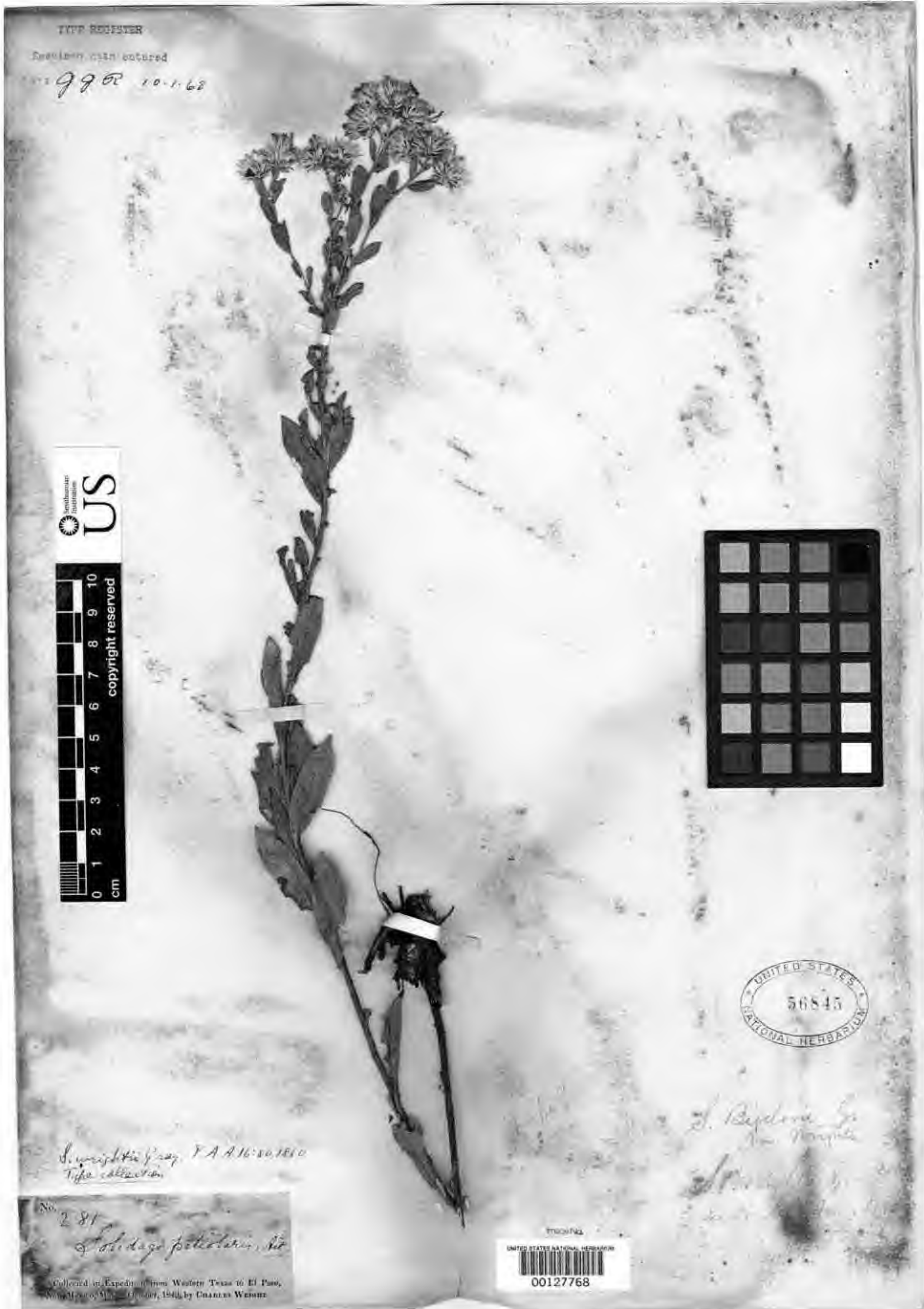
Figure 3. Isotype of Solidago wrightii (US).