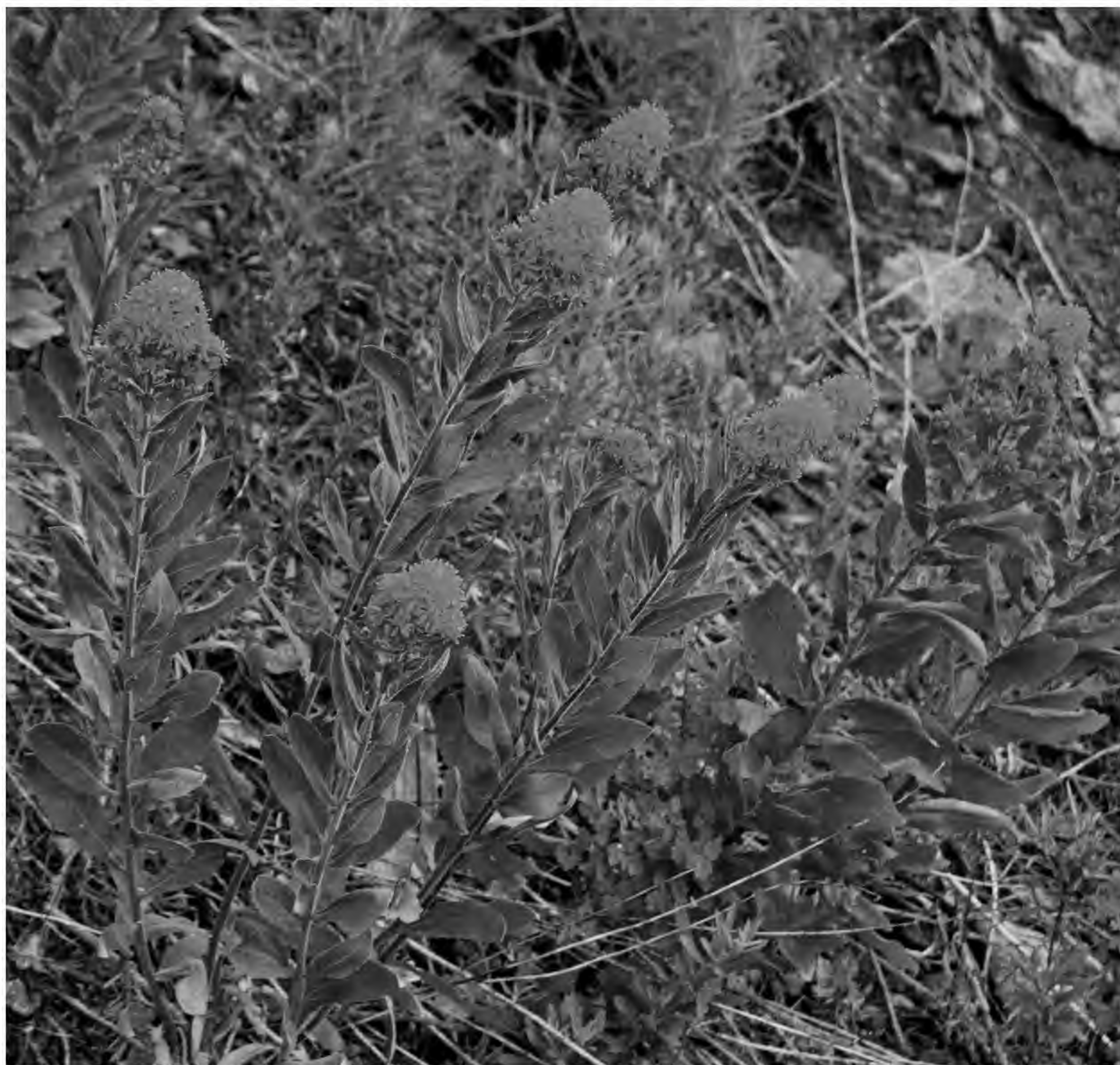
Figure 4. Solidago wrightii , at Axel Bend on Sierra Blanca, Lincoln Co., New Mexico. Photo by Jerry Oldenettel, 19 August 2007.