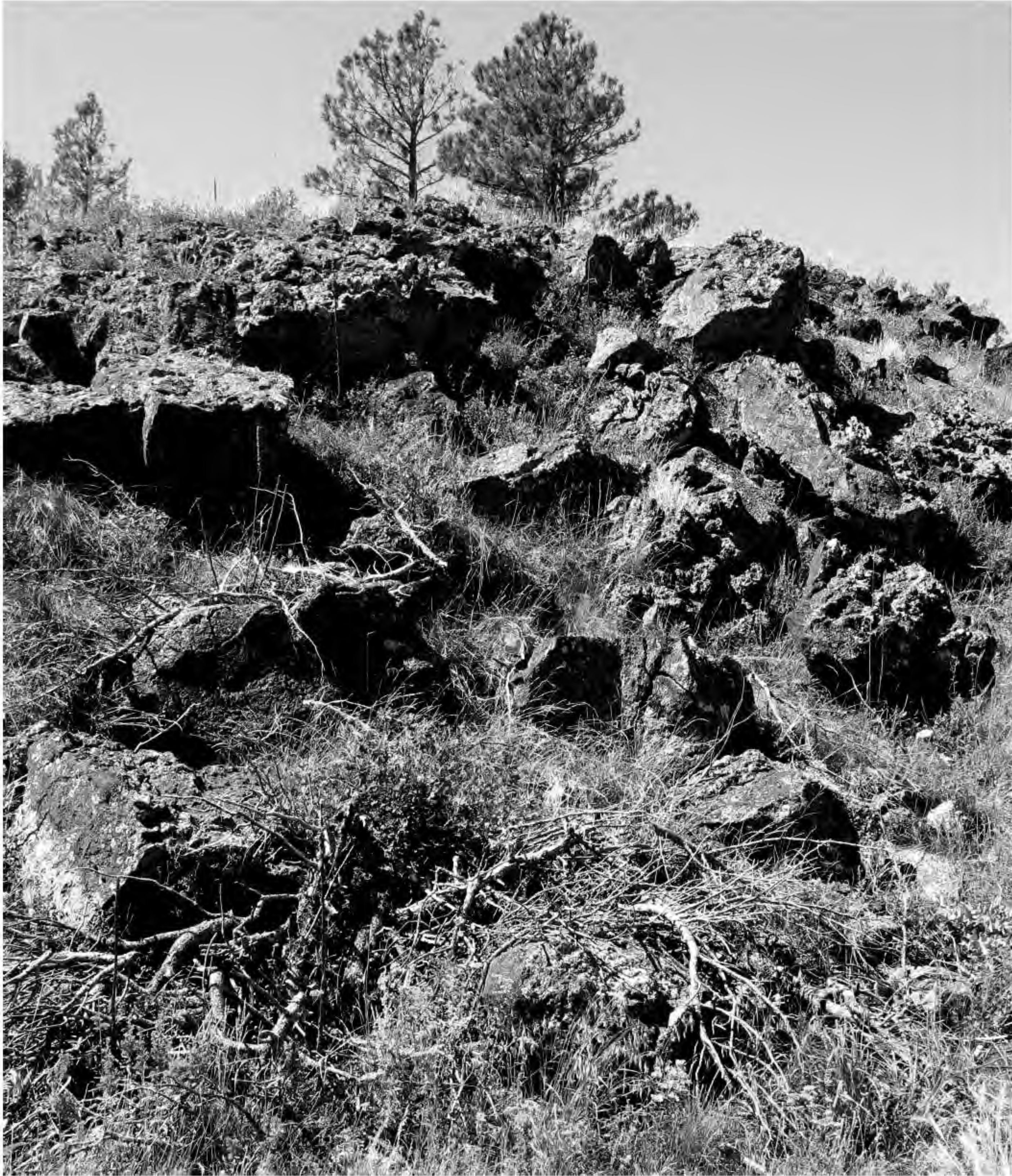
Figure 12. Habitat of Solidago capulinensis , hillside of basalt boulders at base of mountain, Capulin Volcano National Monument. Photo by Lowrey, 11 September 2010.