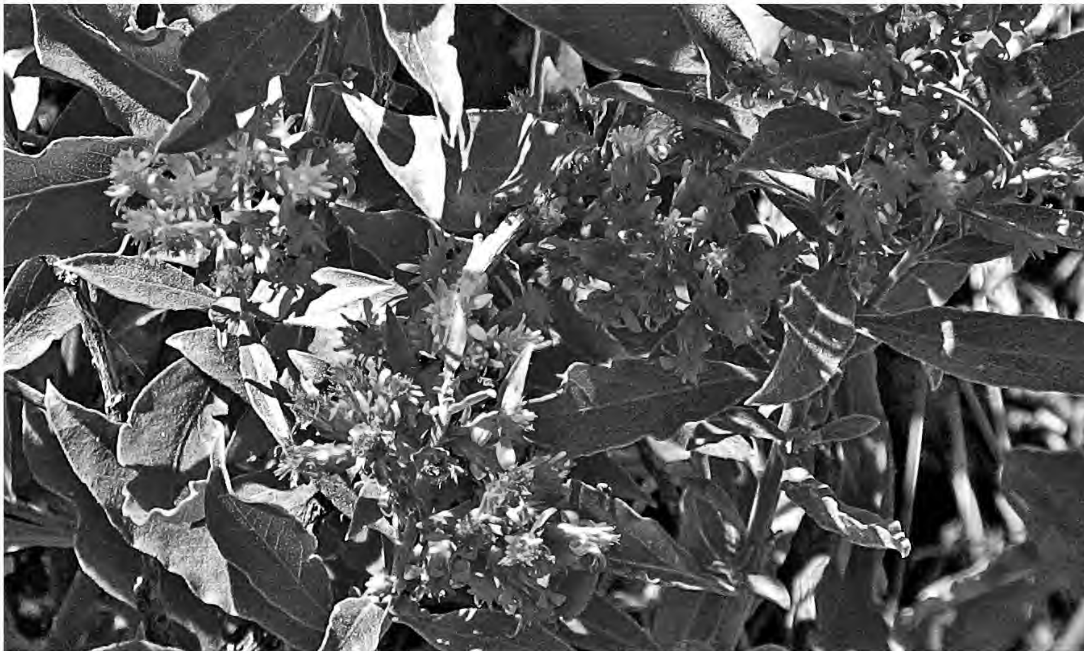
Figure 15 a, b. Solidago capulinensis at Capulin Volcano National Monument. 11 September 2010.