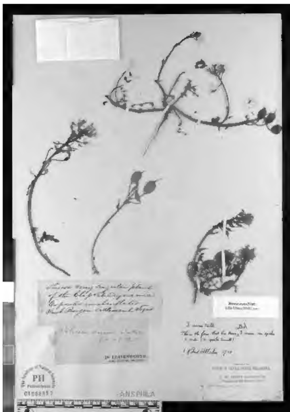
Figure 1. Selenia aurea (M.C. Leavenworth s.n.). Information provided with the permission of The Academy of Natural Sciences.