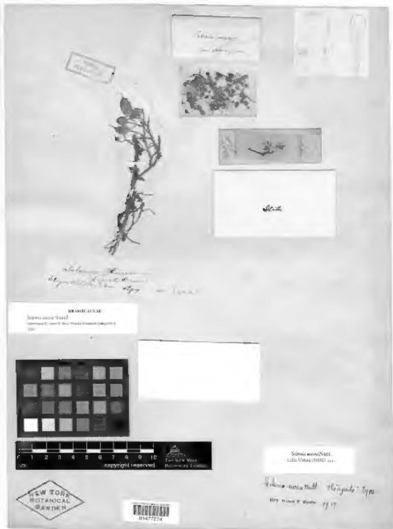
Figure. 2. Selenia aurea (M. C. Leavenworth s.n.