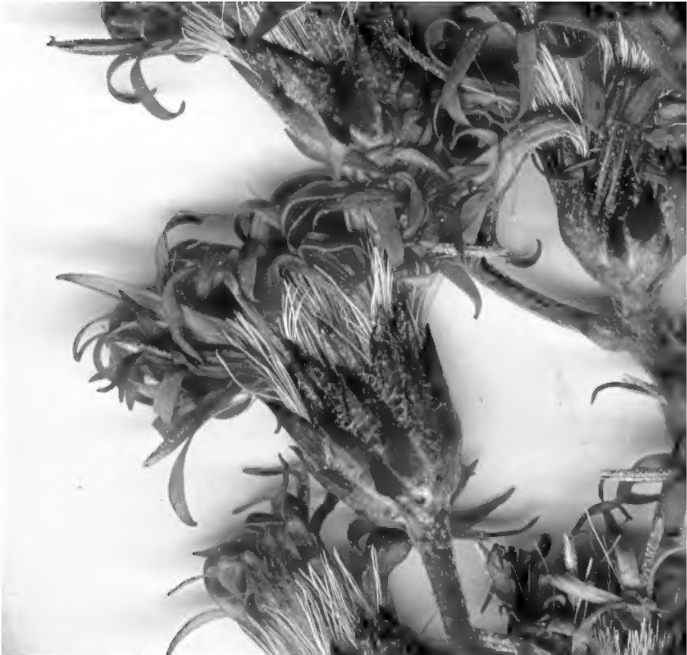
Figure 1. Vernonia fasciculata . Flowering head at 3600dpi. Note the lance-ovate outer phyllaries and oblong to linear-oblong inner phyllaries with arachno-ciliolate margins. Note also the phyllaries in four series.