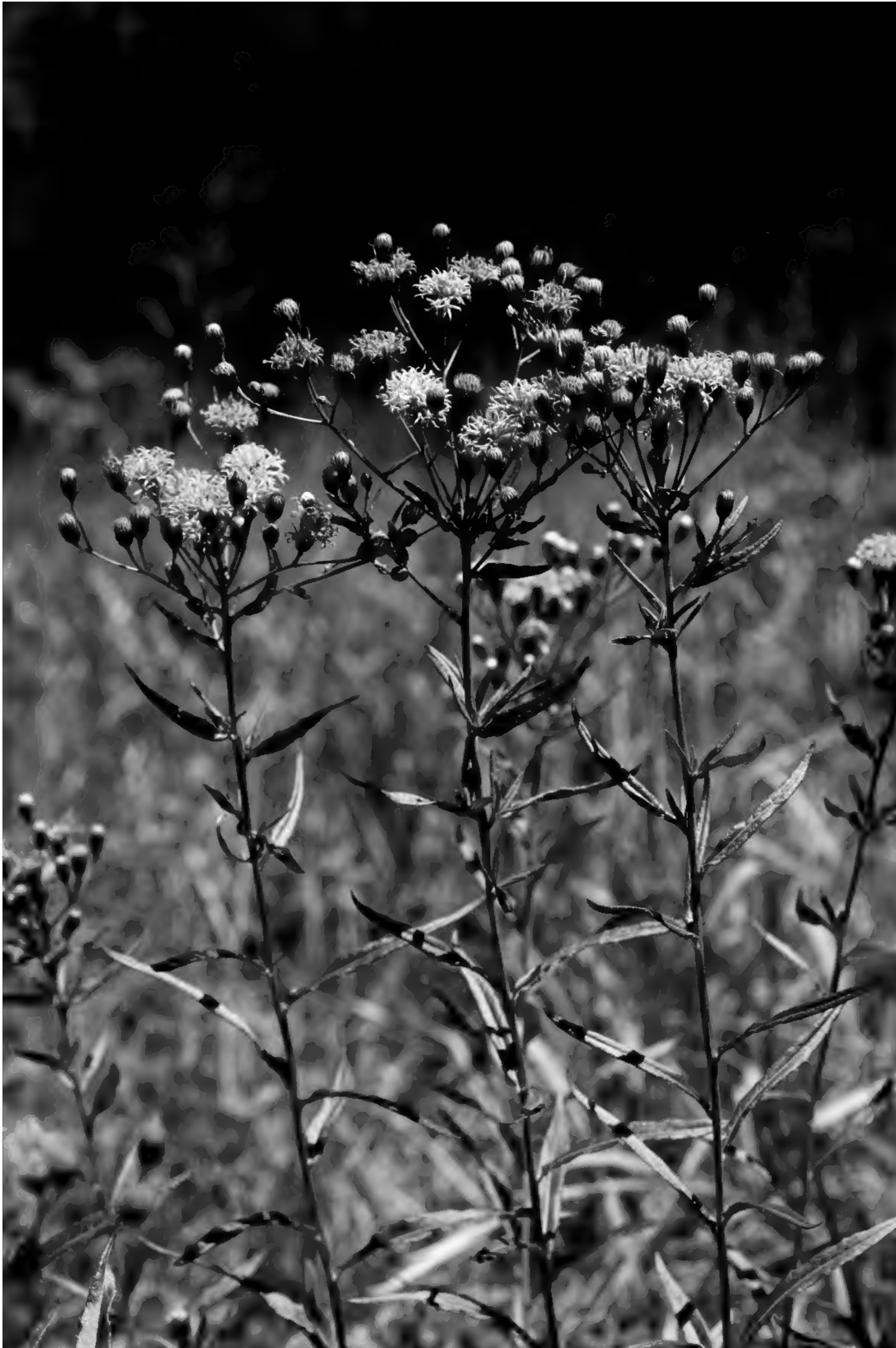
Figure 3. Vernonia fasciculata in a remnant “pocket” prairie five miles south the Red River in Red River County, Texas, 9 September 2012. Note the corymboid inflorescence as well as the fasciculate flowering heads in the axils of the upper leaves, for which the species is named.