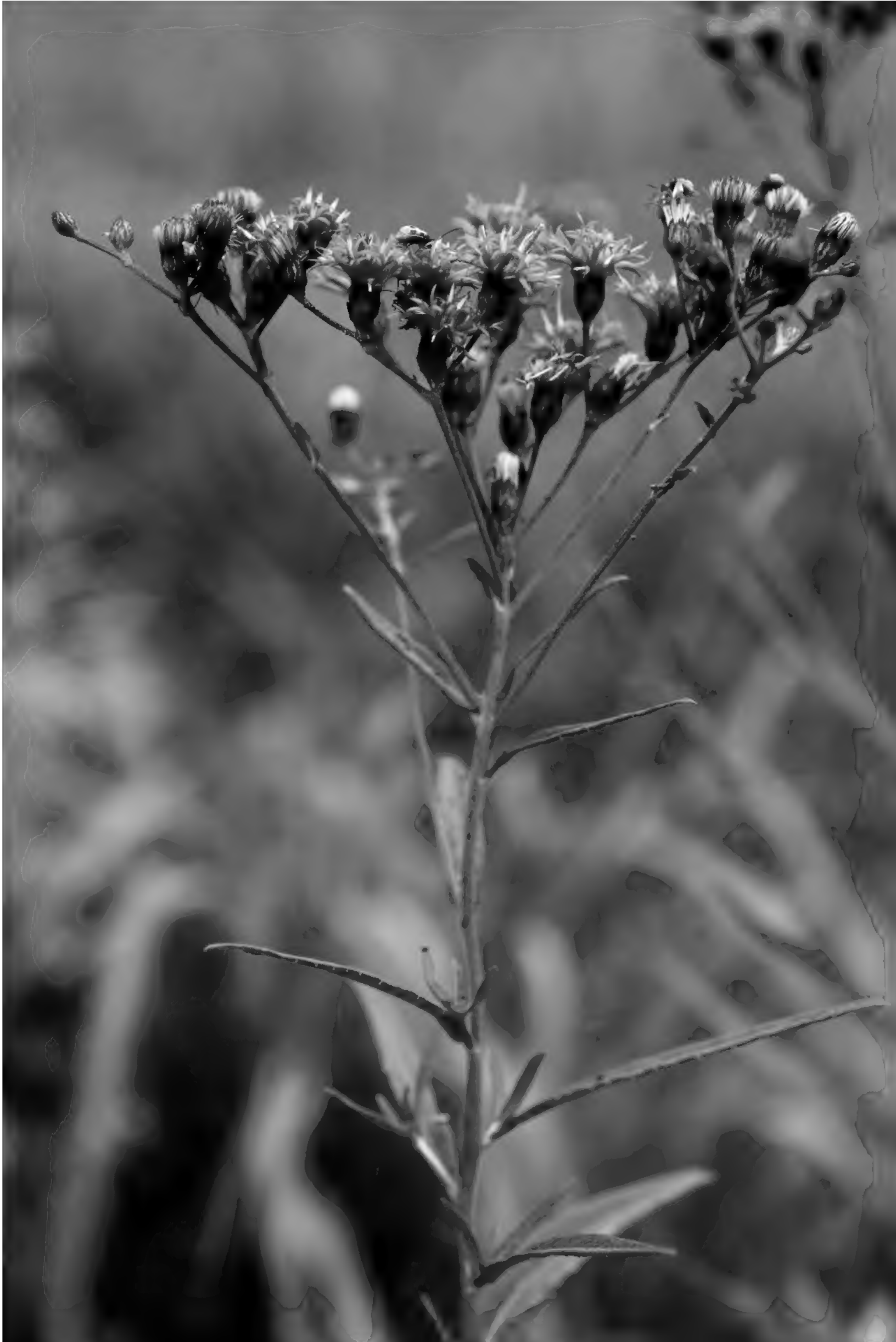
Figure 4. Vernonia fasciculata . Inflorescence. 15 September 2012.