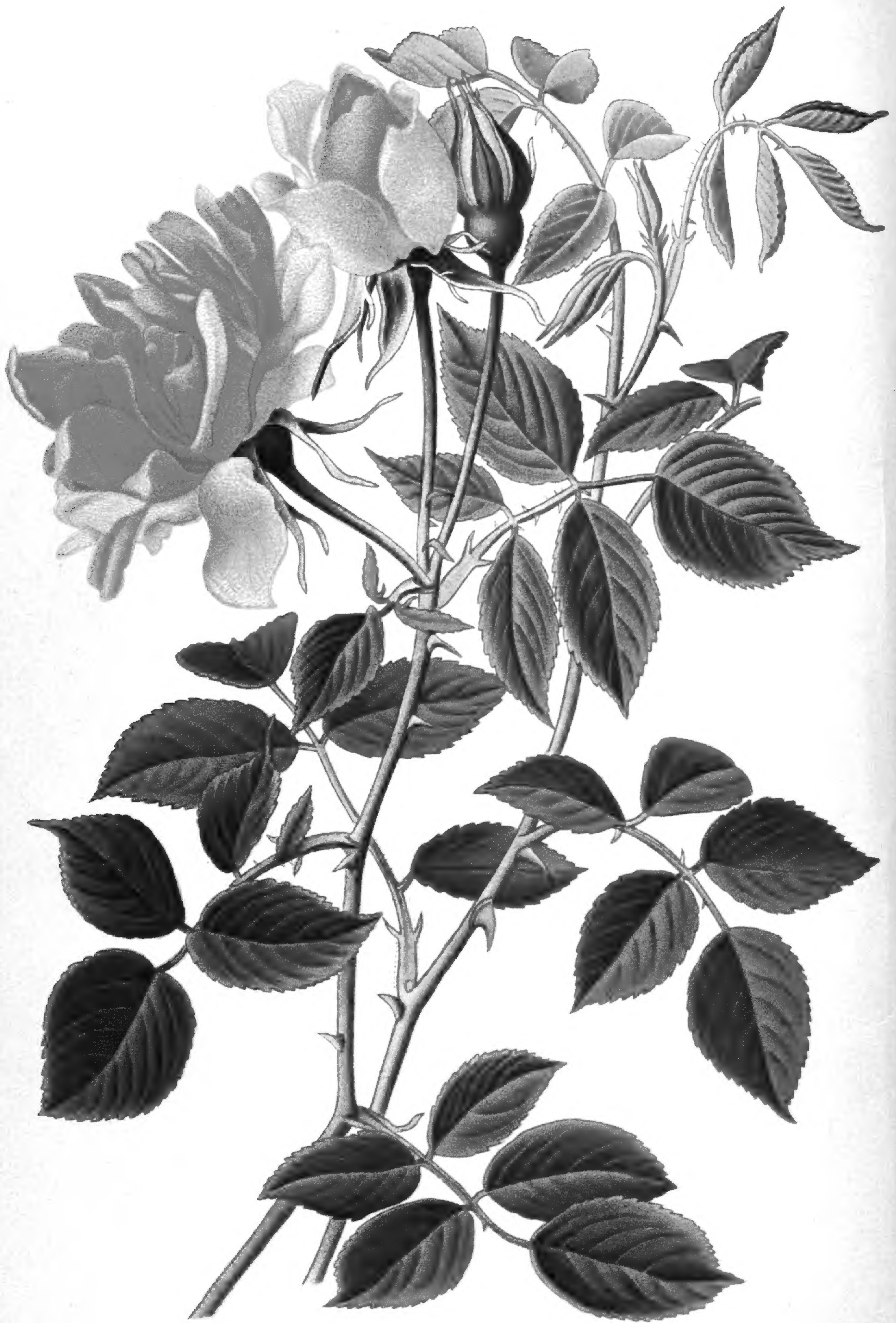
NOISETTE ROSE—"WILLIAM ALLEN RICHARDSON"