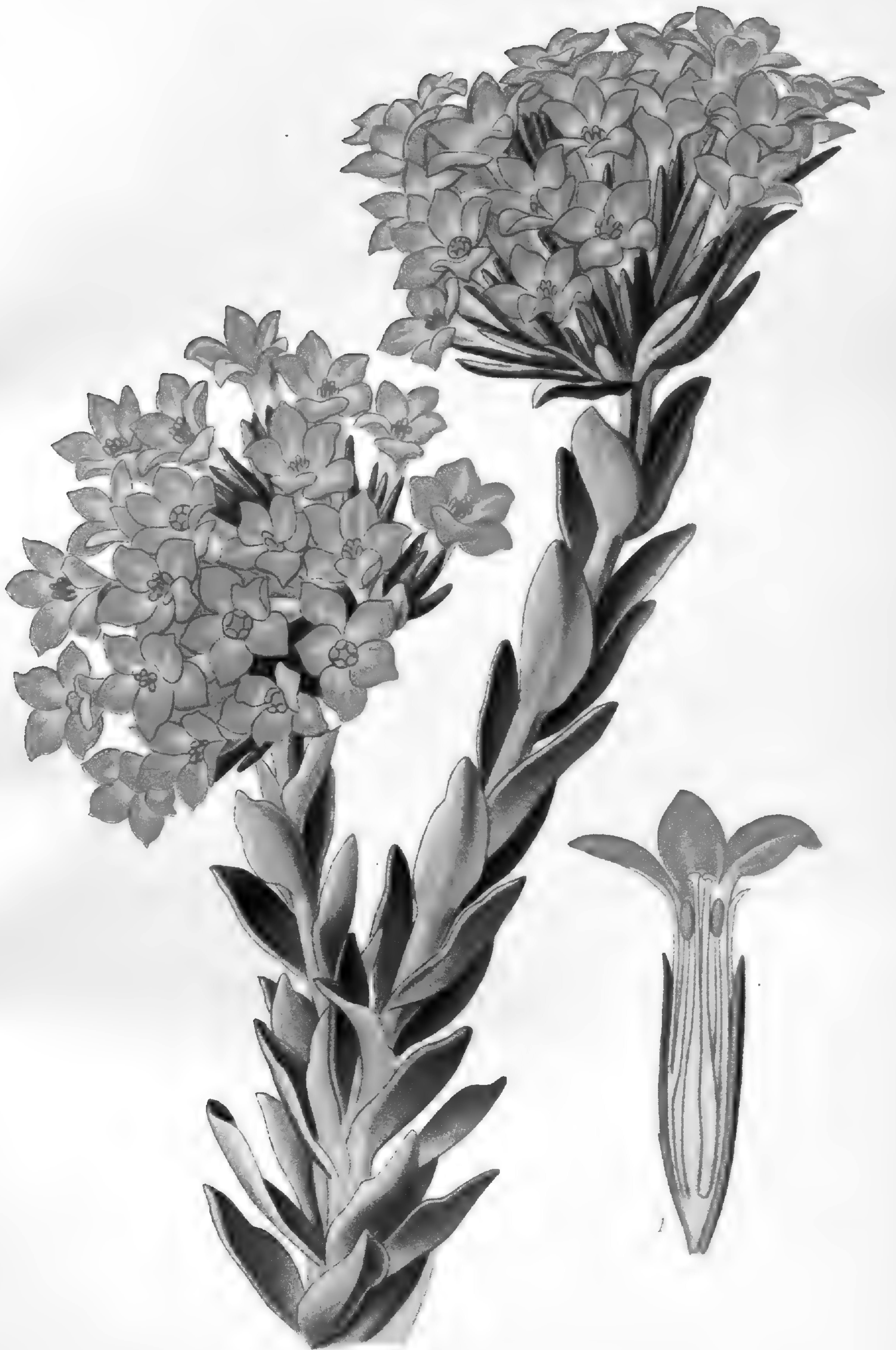
SCARLET CRASSULA (ROCHEA COCCINEA)