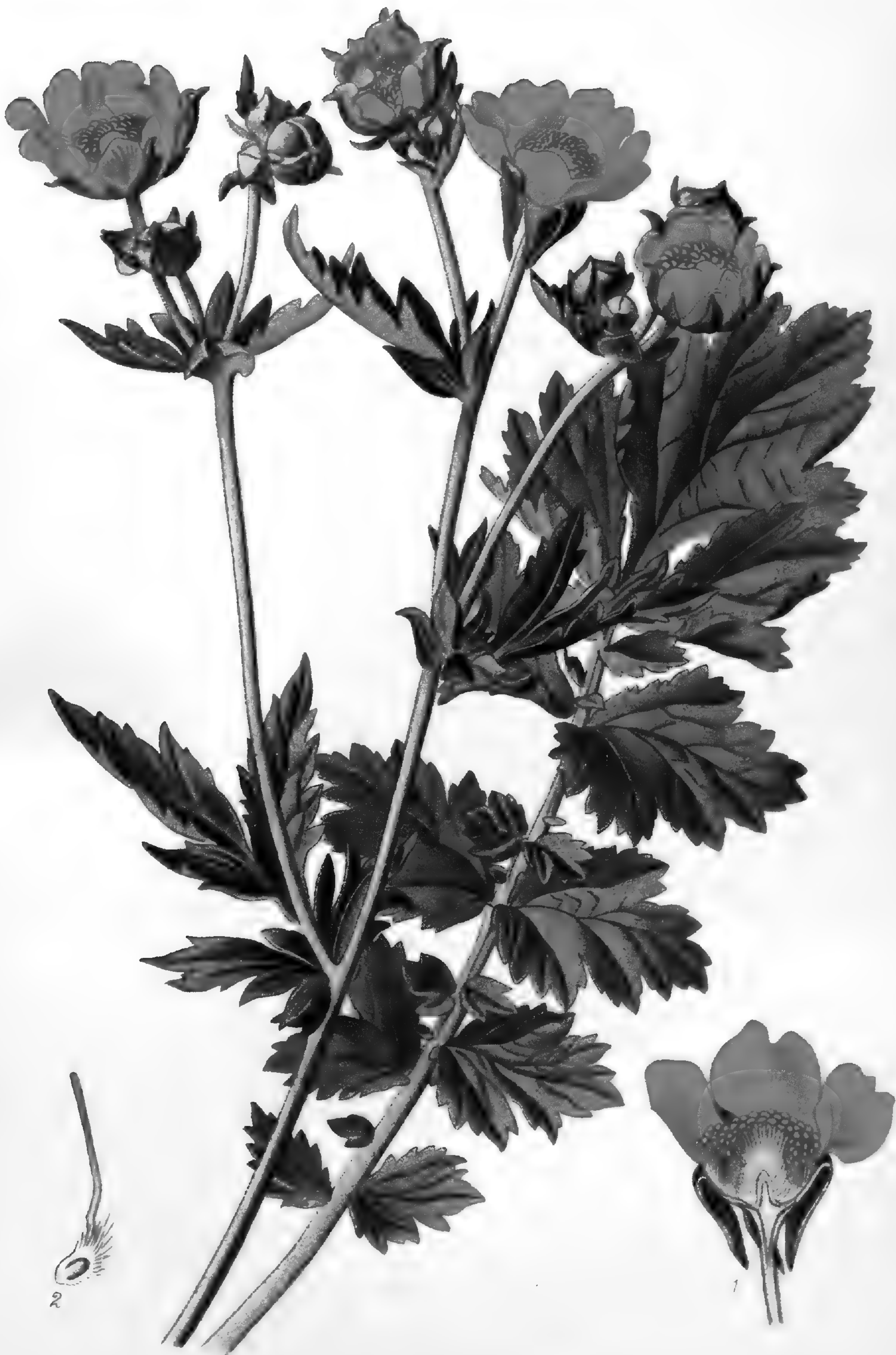
SCARLET AVENS ( GEUM CHILOENSE )