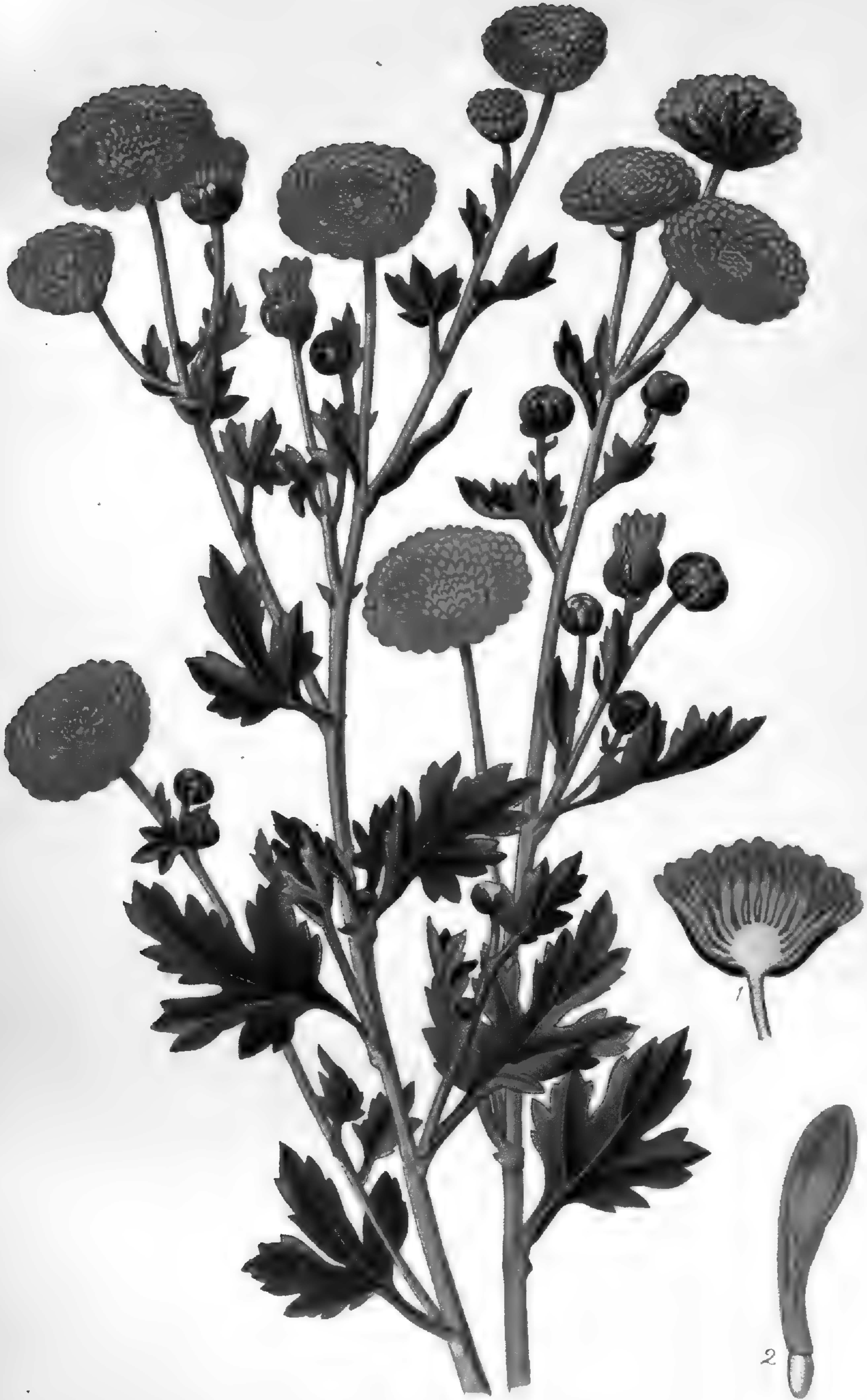
POMPON CHRYSANTHEMUM (CHRYSANTHEMUM SINENSE, var. Mont d'Or )