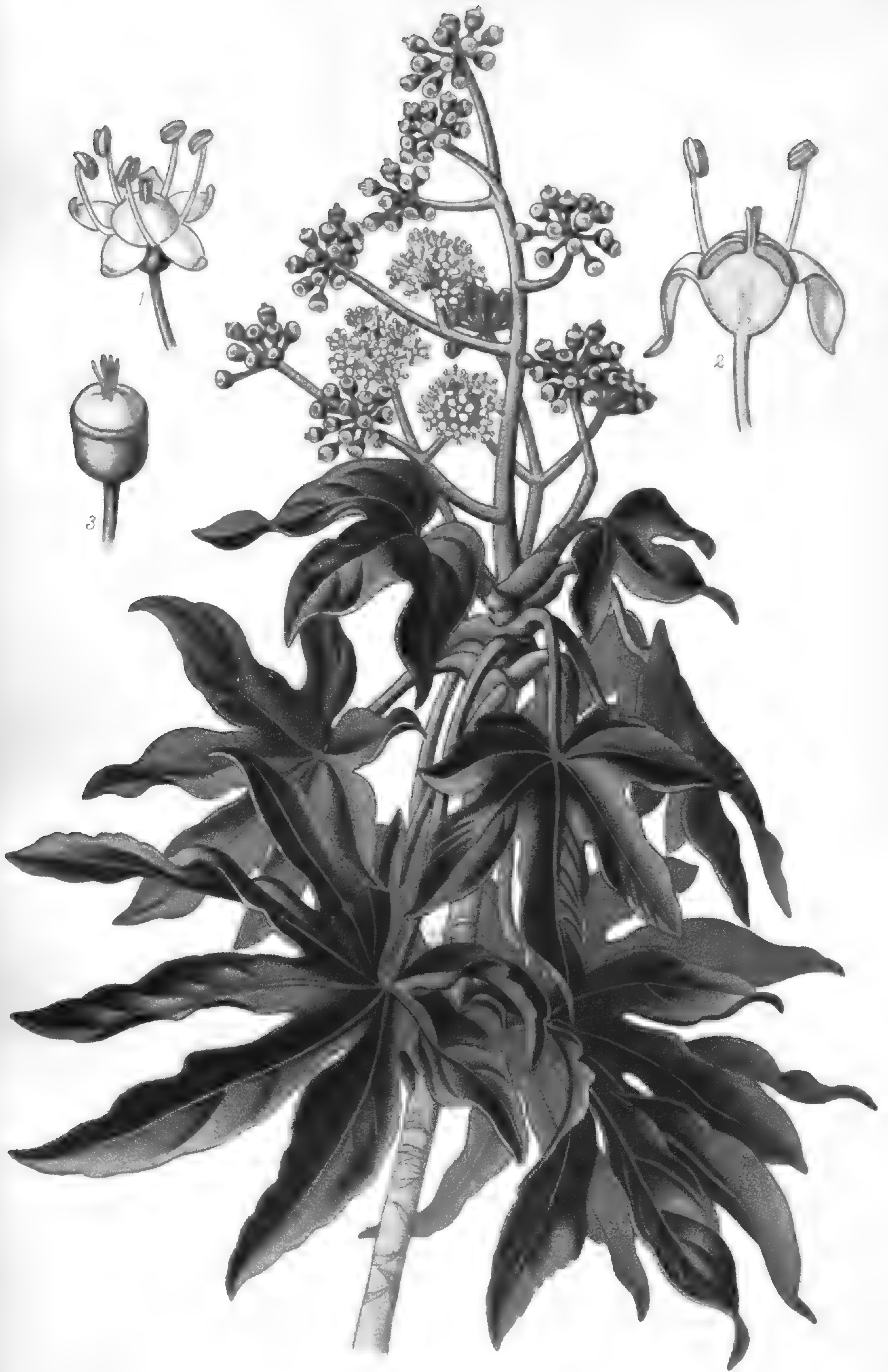
JAPANESE ARALIA (FATSIA JAPONICA)