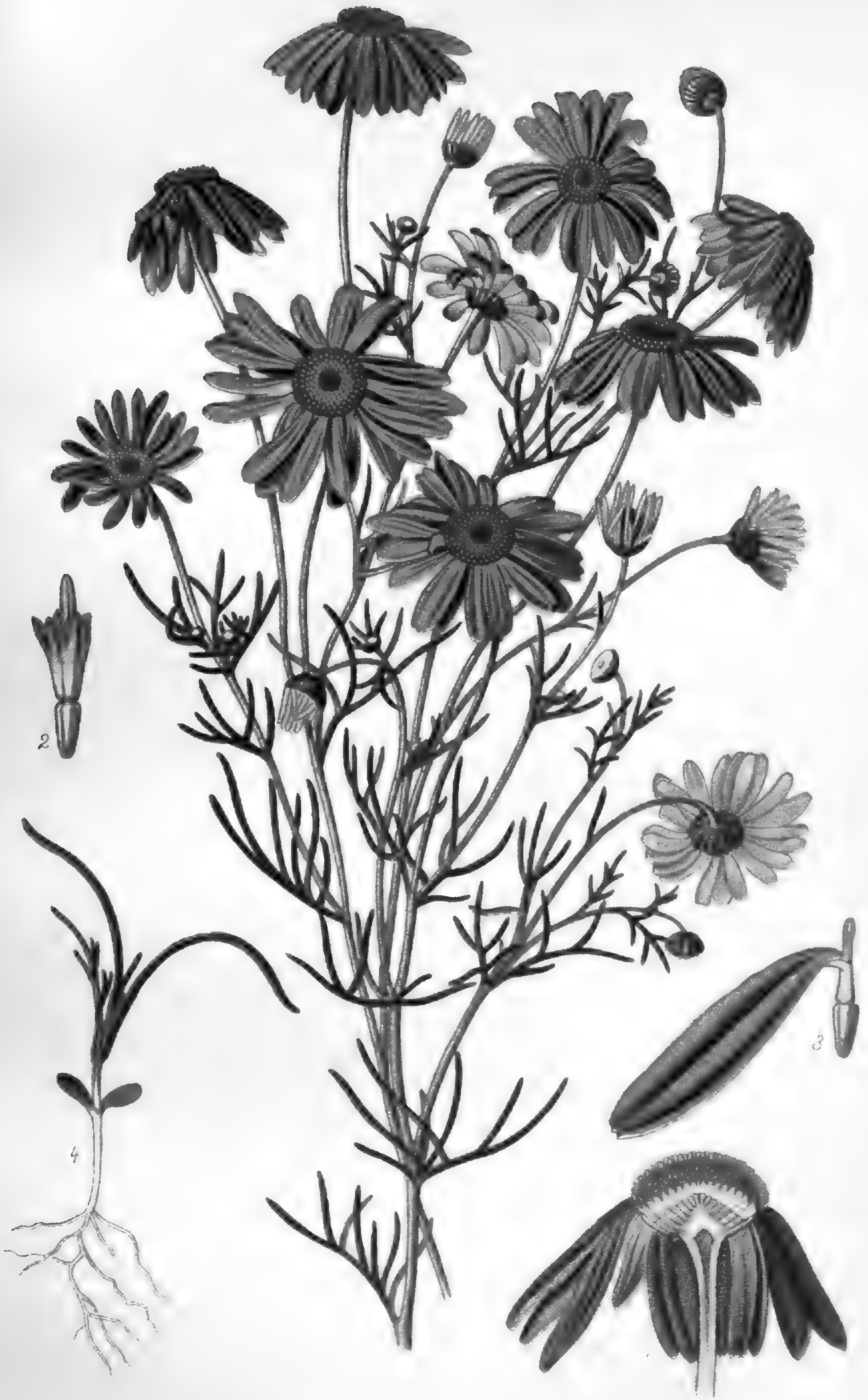
SWAN RIVER DAISY (BRACHYCOME IBERIDIFOLIA)