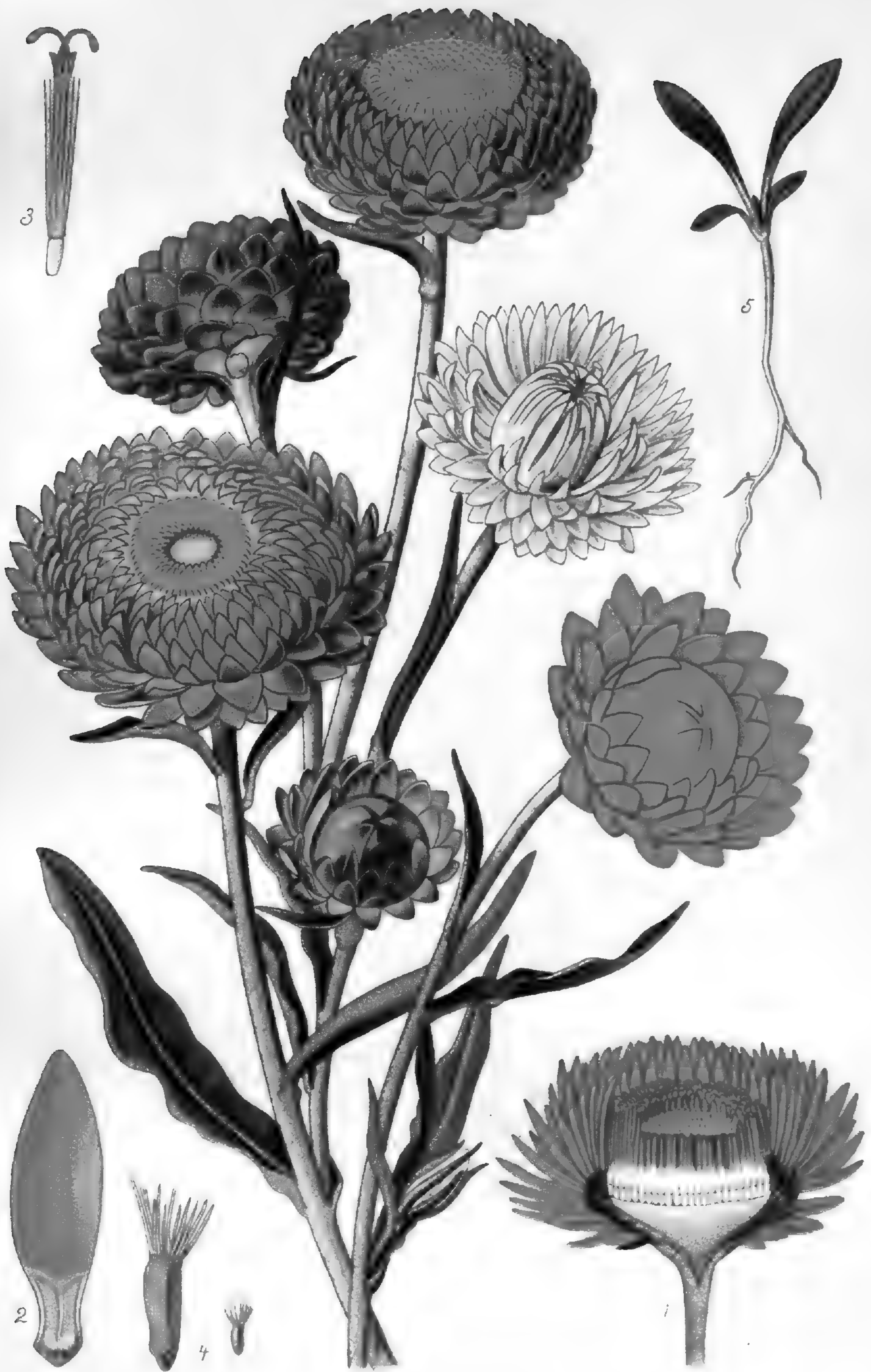
IMMORTElLES (HELICHRYSUM BRACTEATUM, vars. )