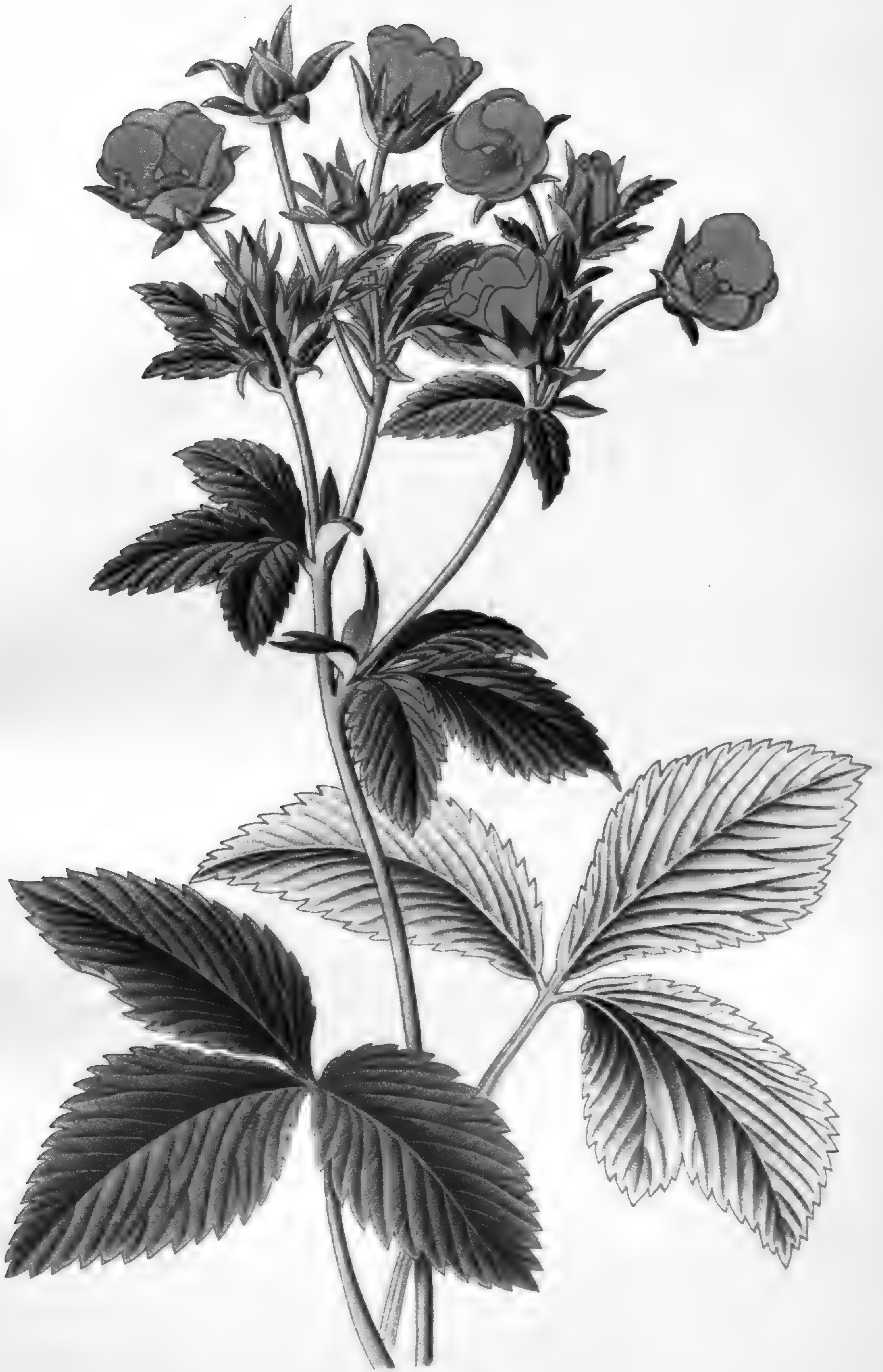
SILVERY CINQUEFOIL. ( POTENTILLA ATROSANGUINEA )