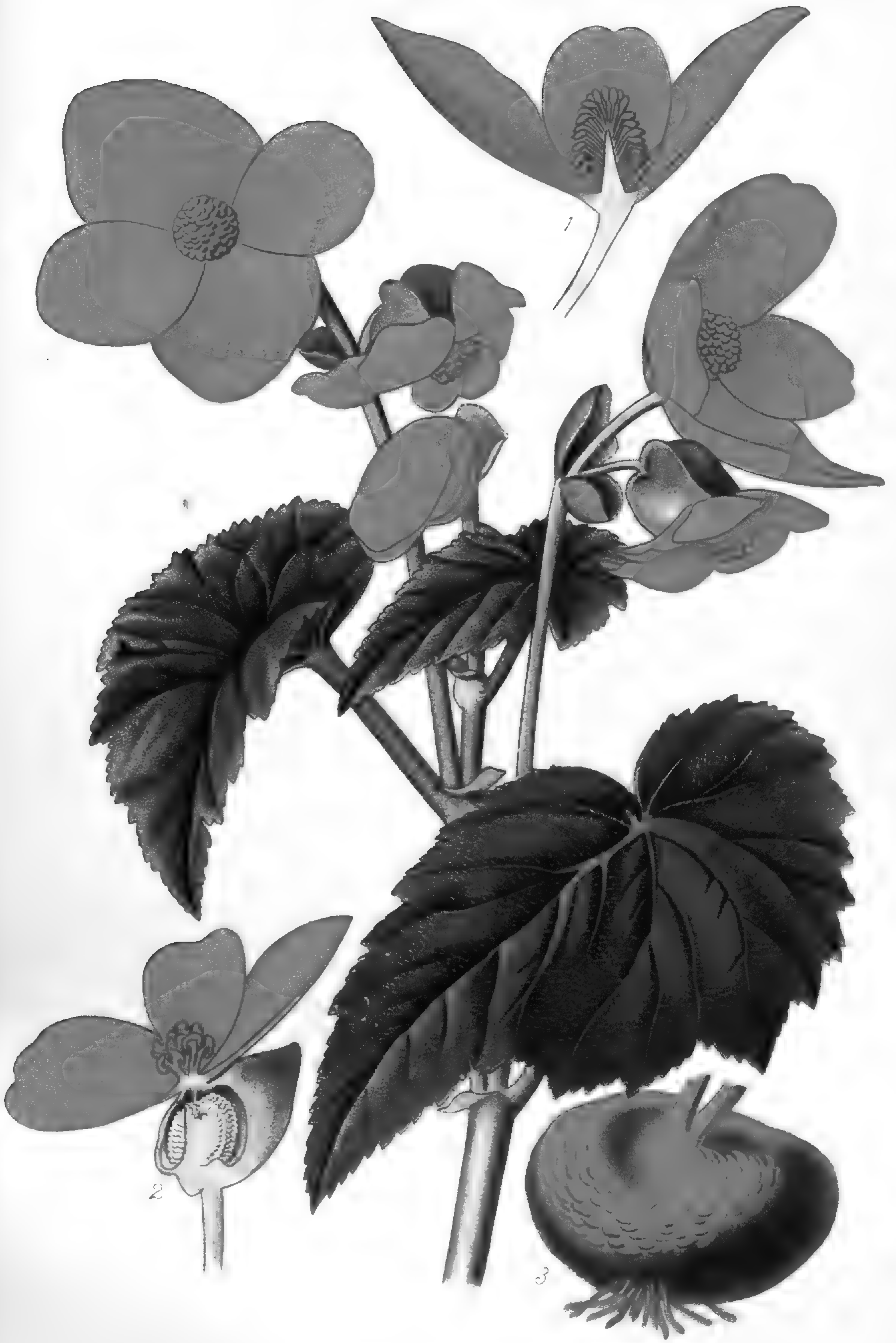
TUBEROUS BEGONIA— Hybrid