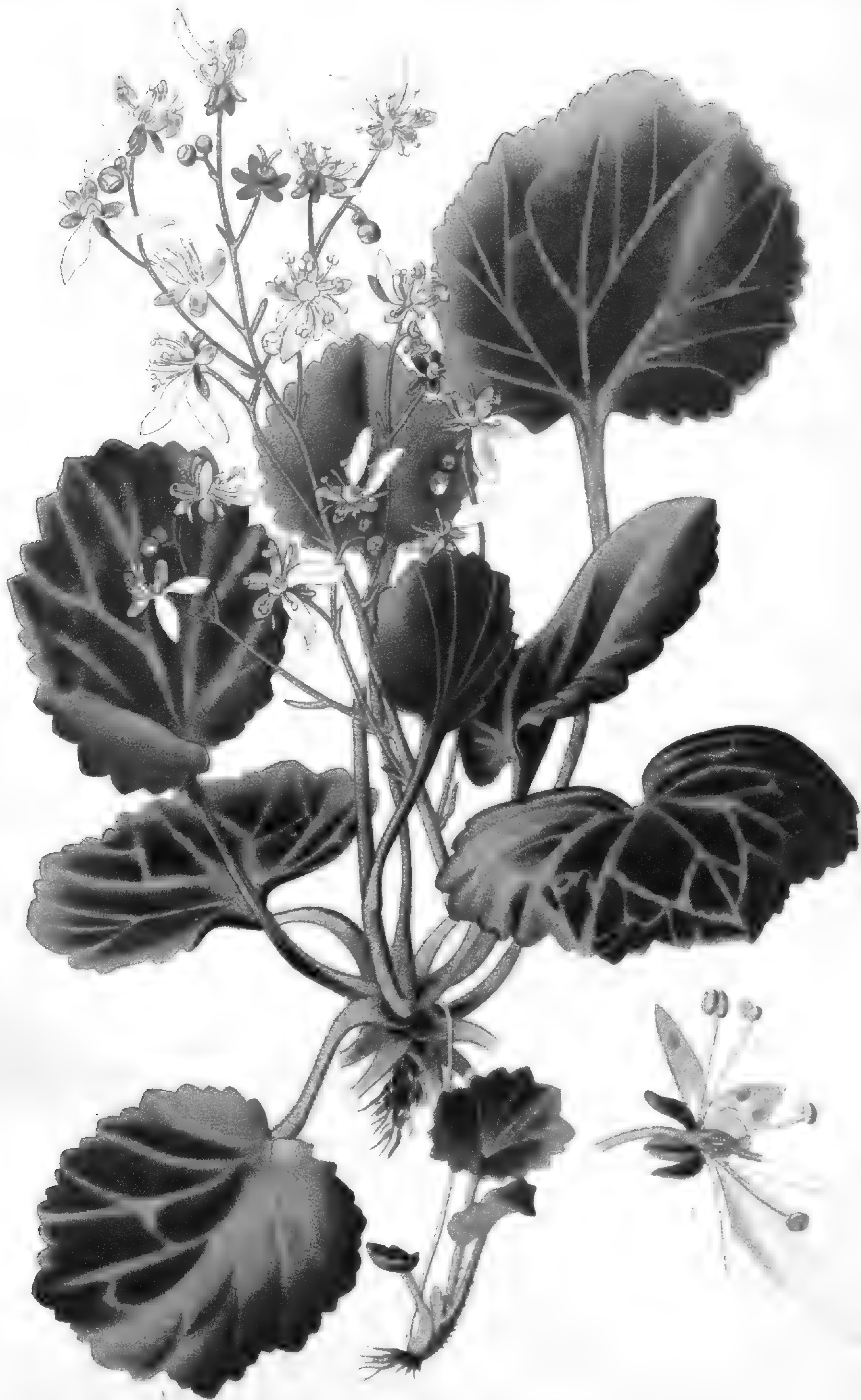
CREEPING SAILOR (SAXIFRAGA SARMENTOSA)