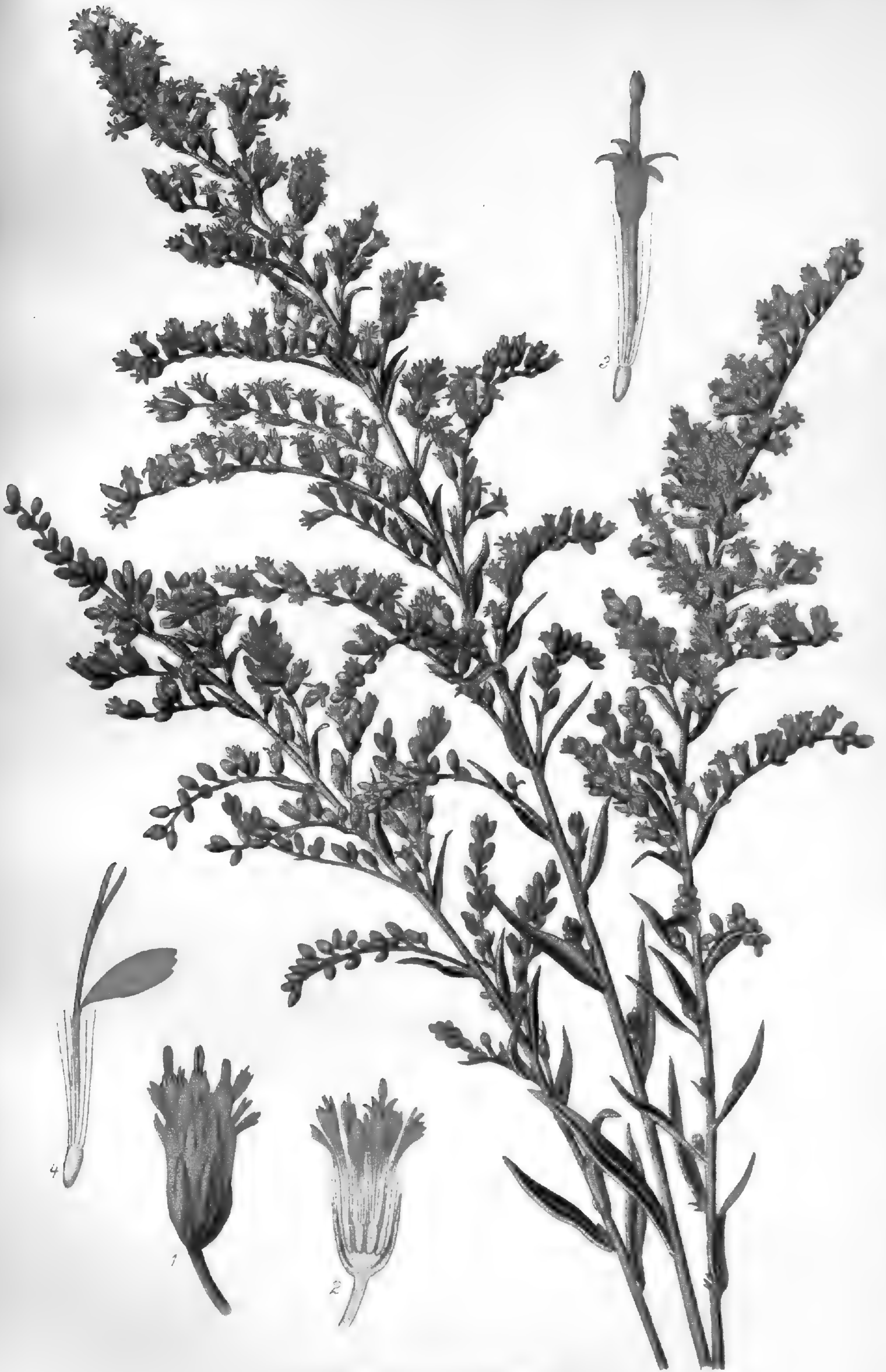
CANADIAN GOLDEN ROD (SOLIDAGO CANADENSIS)