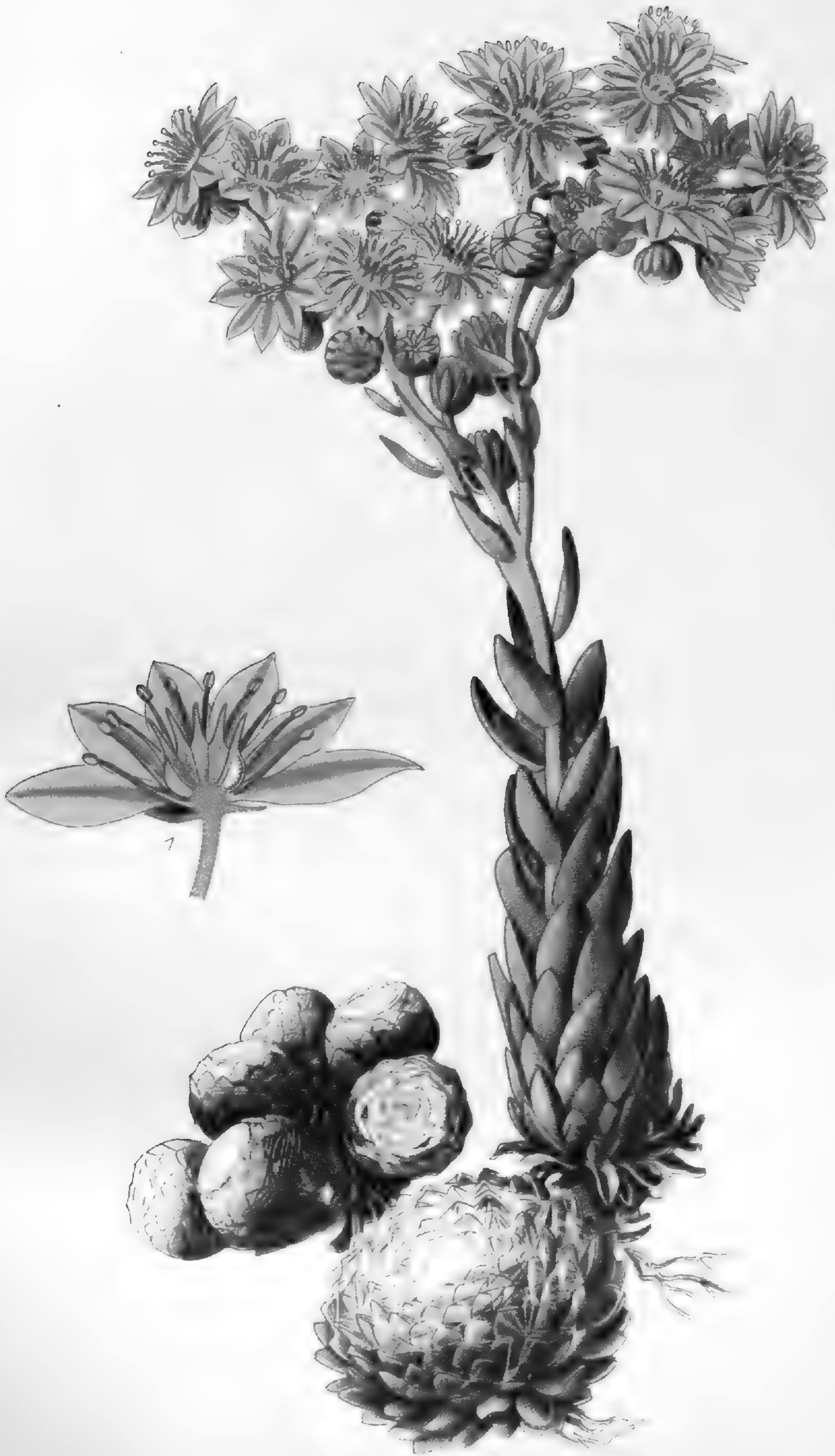
COBWEBBY HOUSELEEK (SEMPERVIVUM ARACHNOIDEUM)