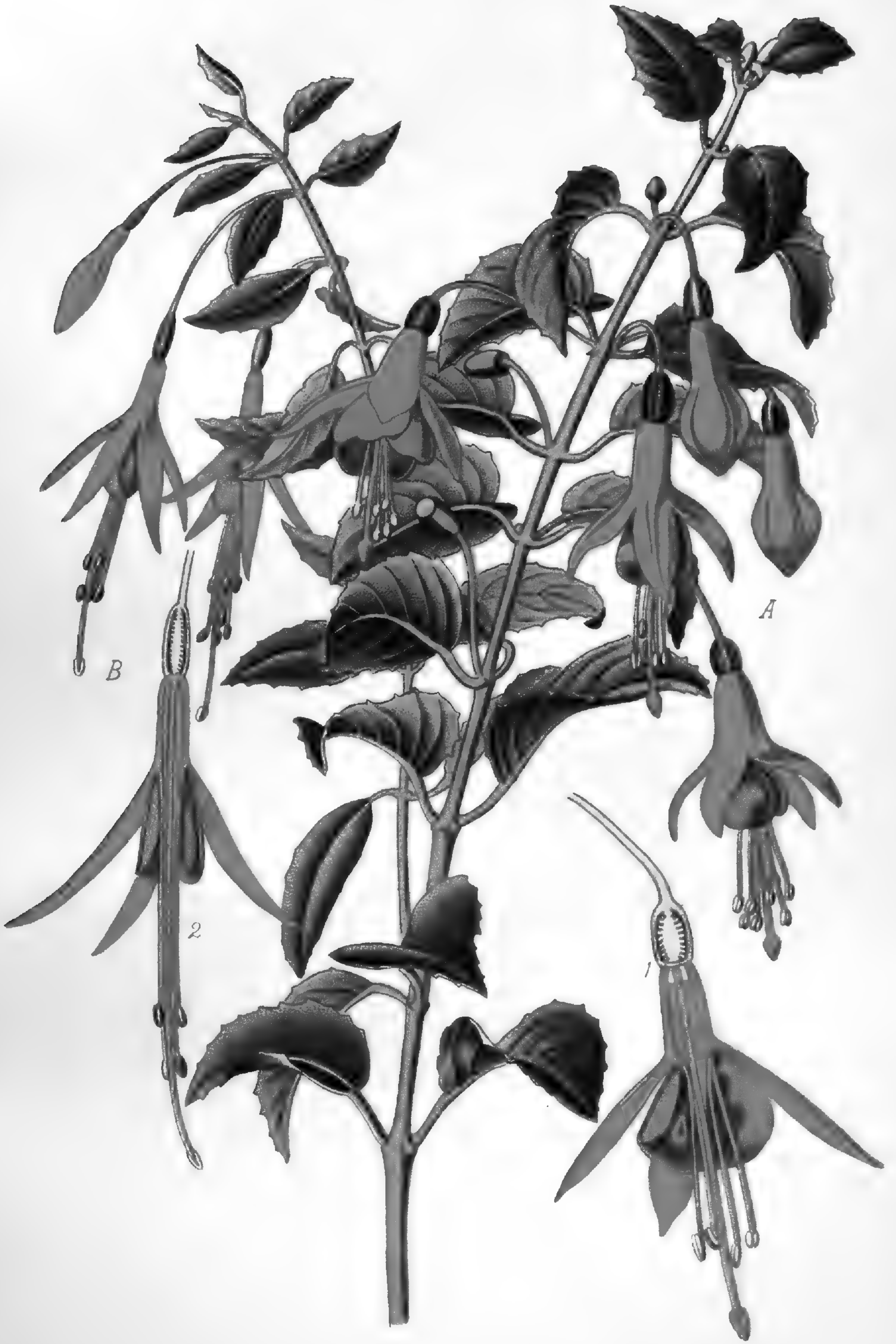
(A) FUCHSIA GLOBOSA