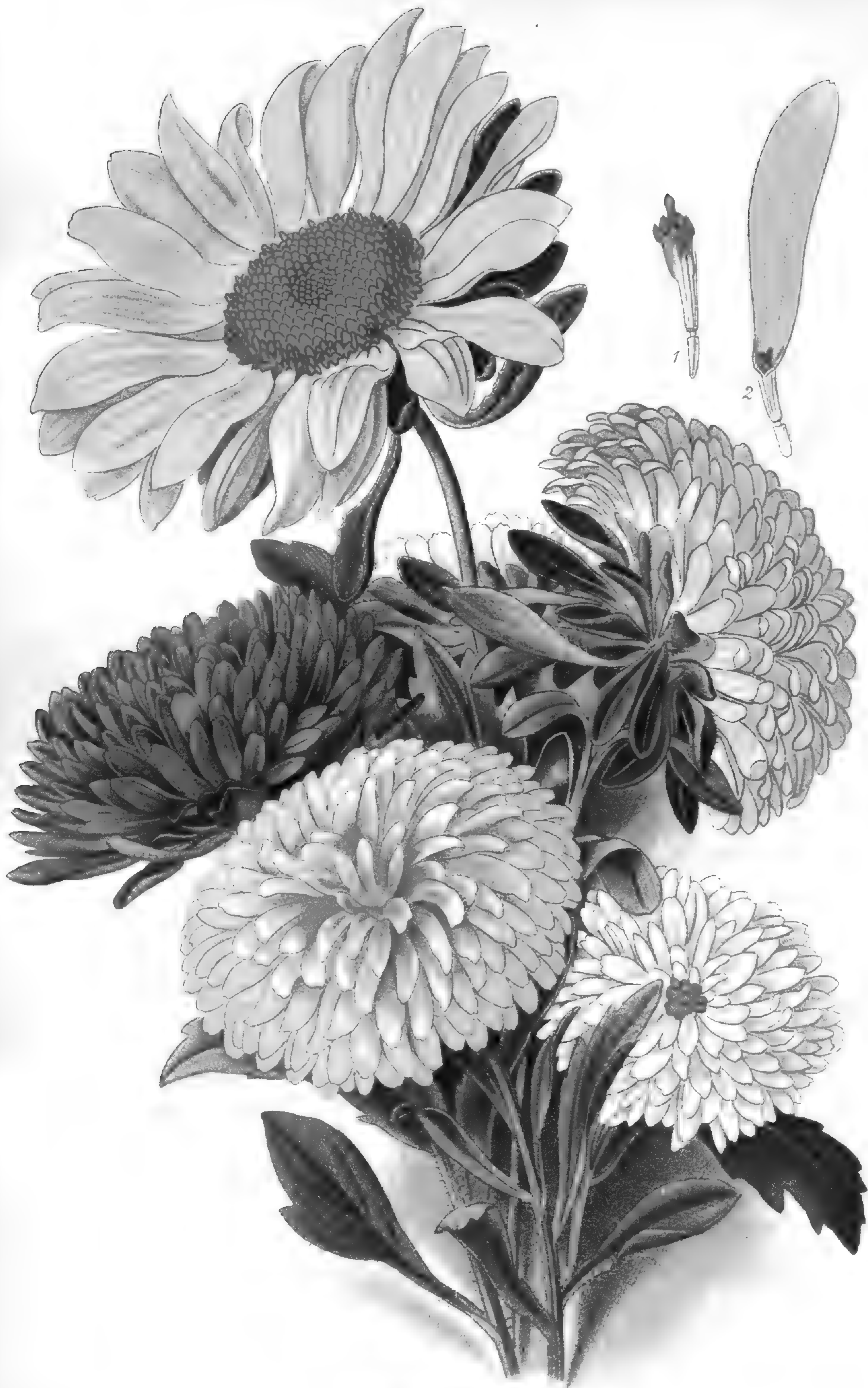
CHINA ASTERS (CALLISTEPHUS SINENSIS, vars. )