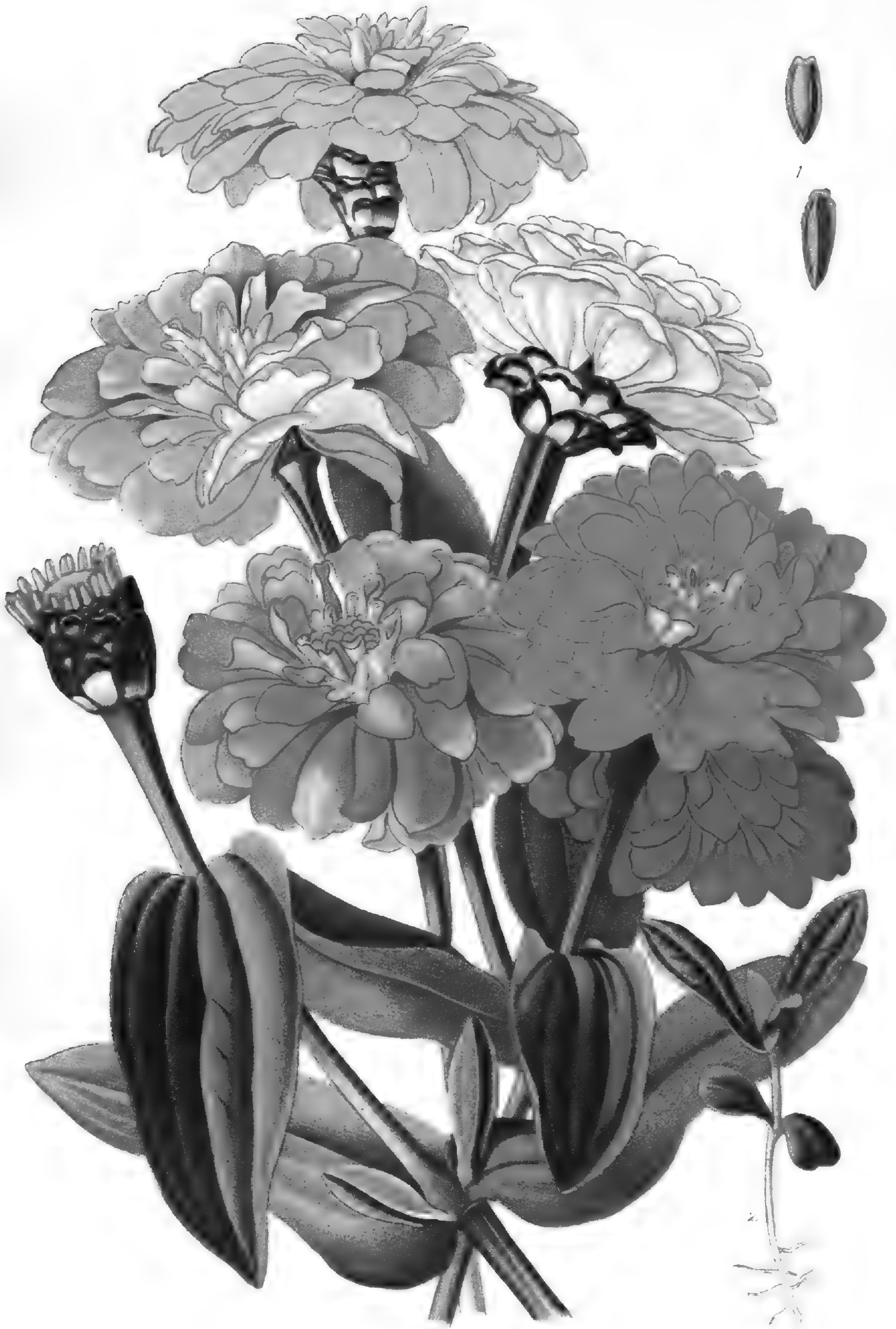
YOUTH AND AGE (ZINNIA ELEGANS, vars. )