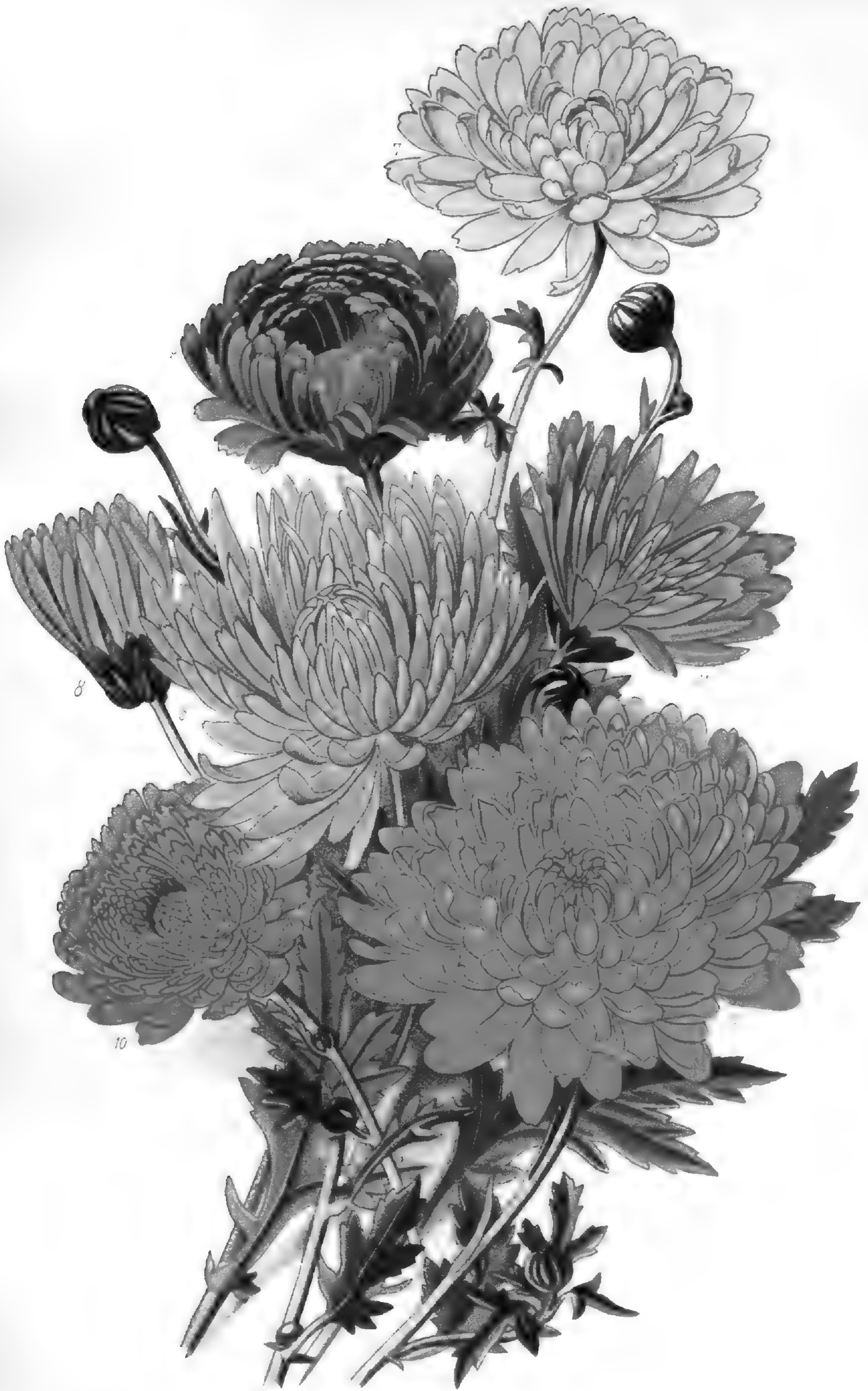
CHRYSANTHEMUMS (CHRYSANTHEMUM SINENSE, vars. )