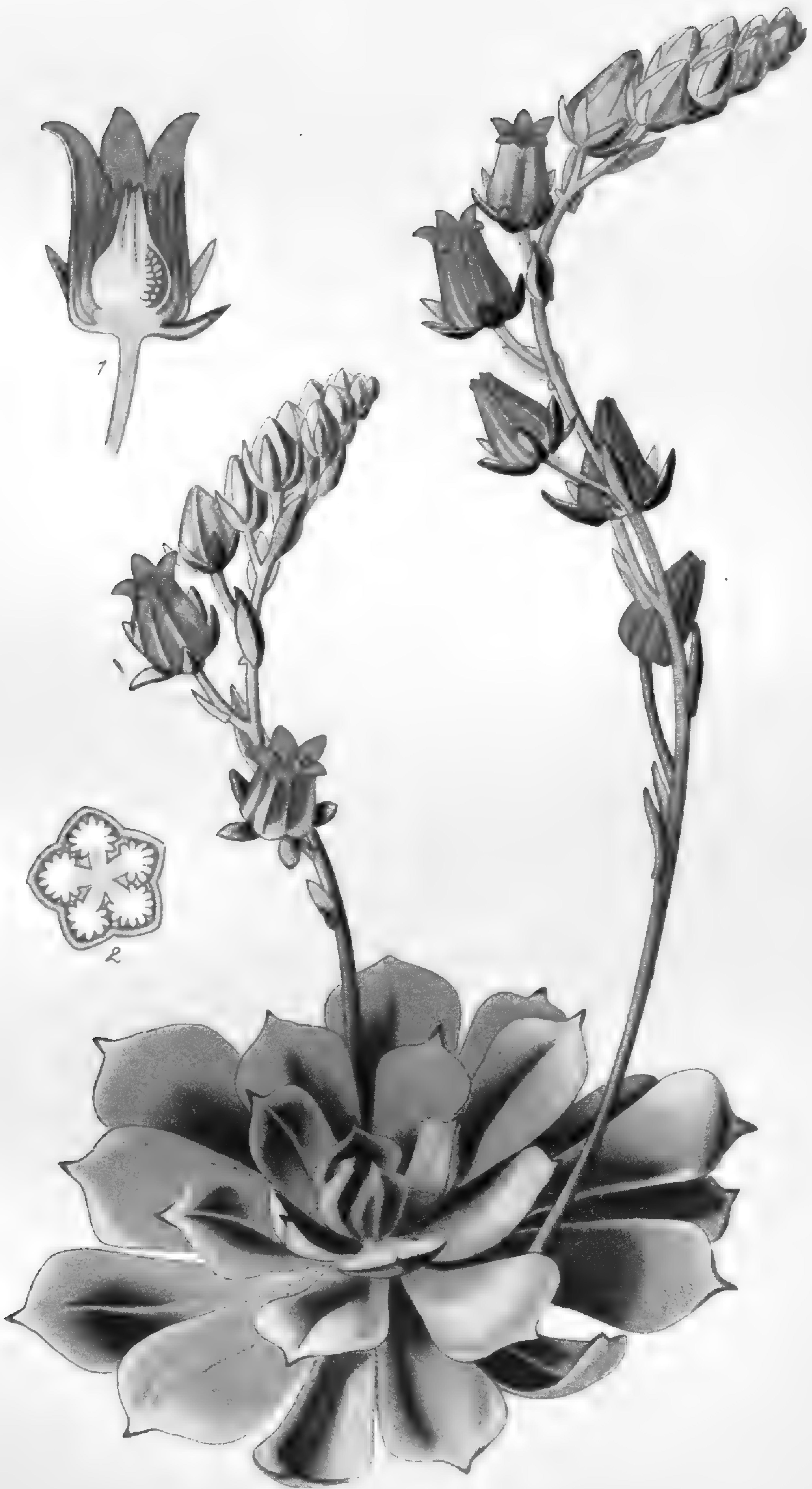
COTYLEDON SECUNDA, var. glauca