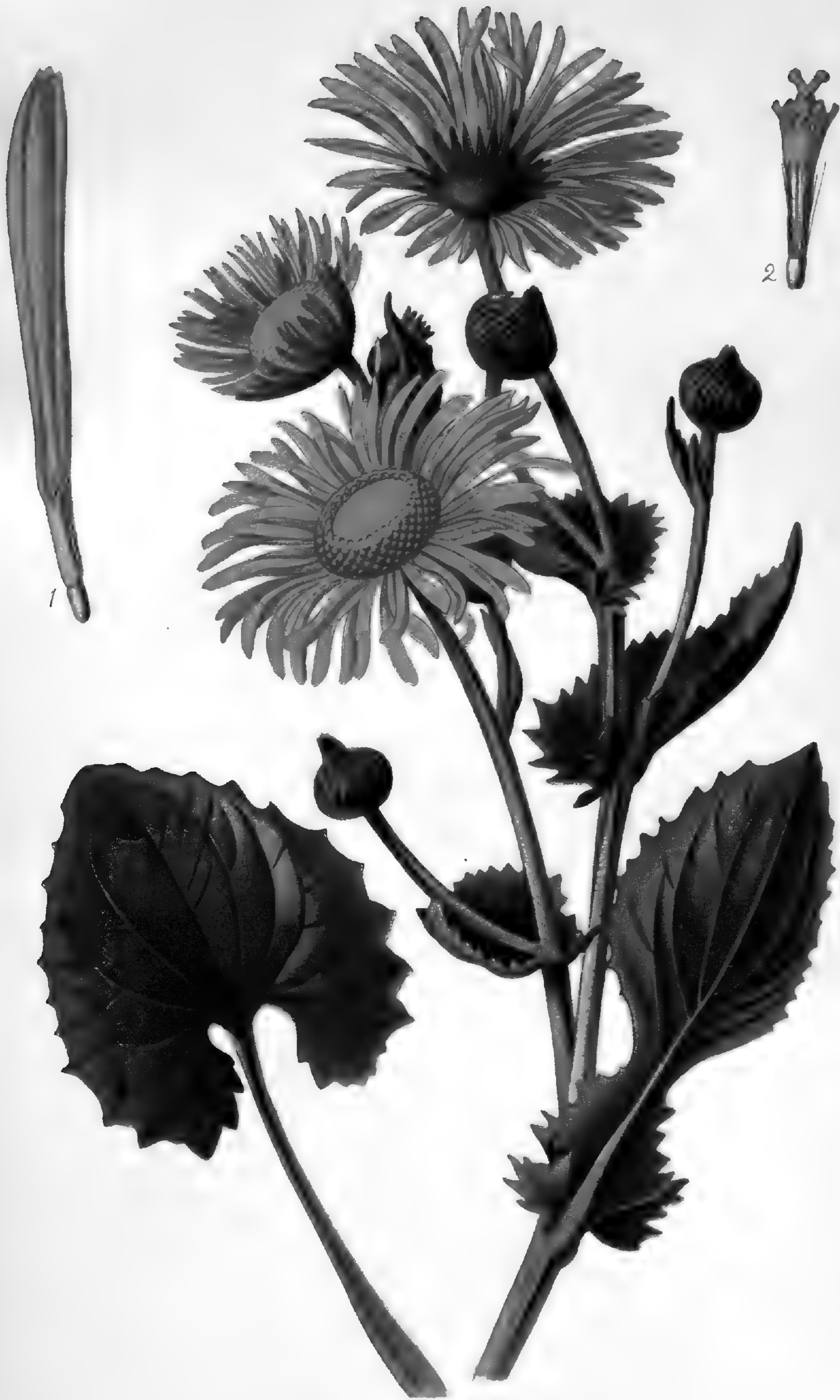
CAUCASIAN LEOPARD'S-BANE (DORONICUM CAUCASICUM)