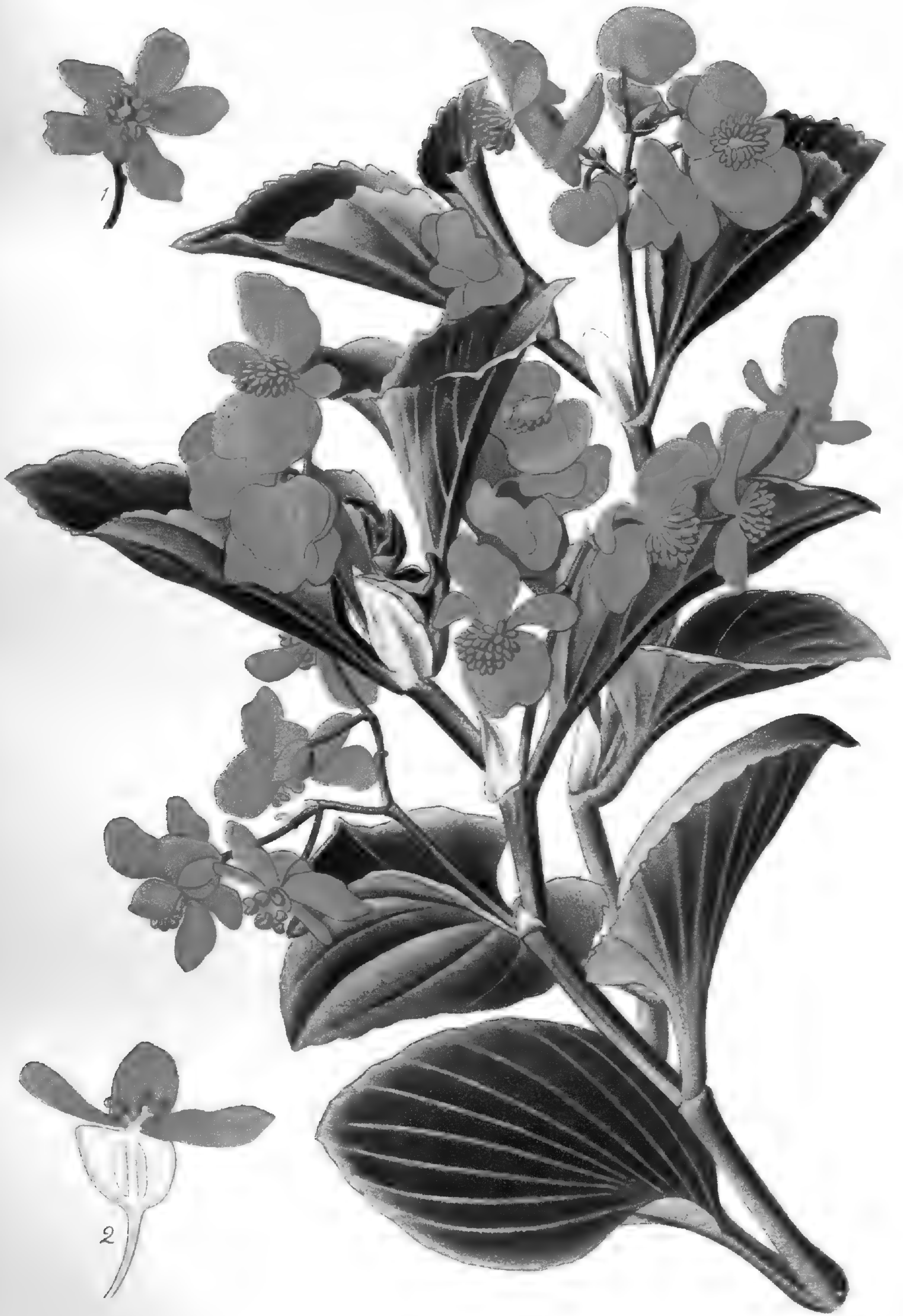
BEGONIA SEMPERFLORENS, var.