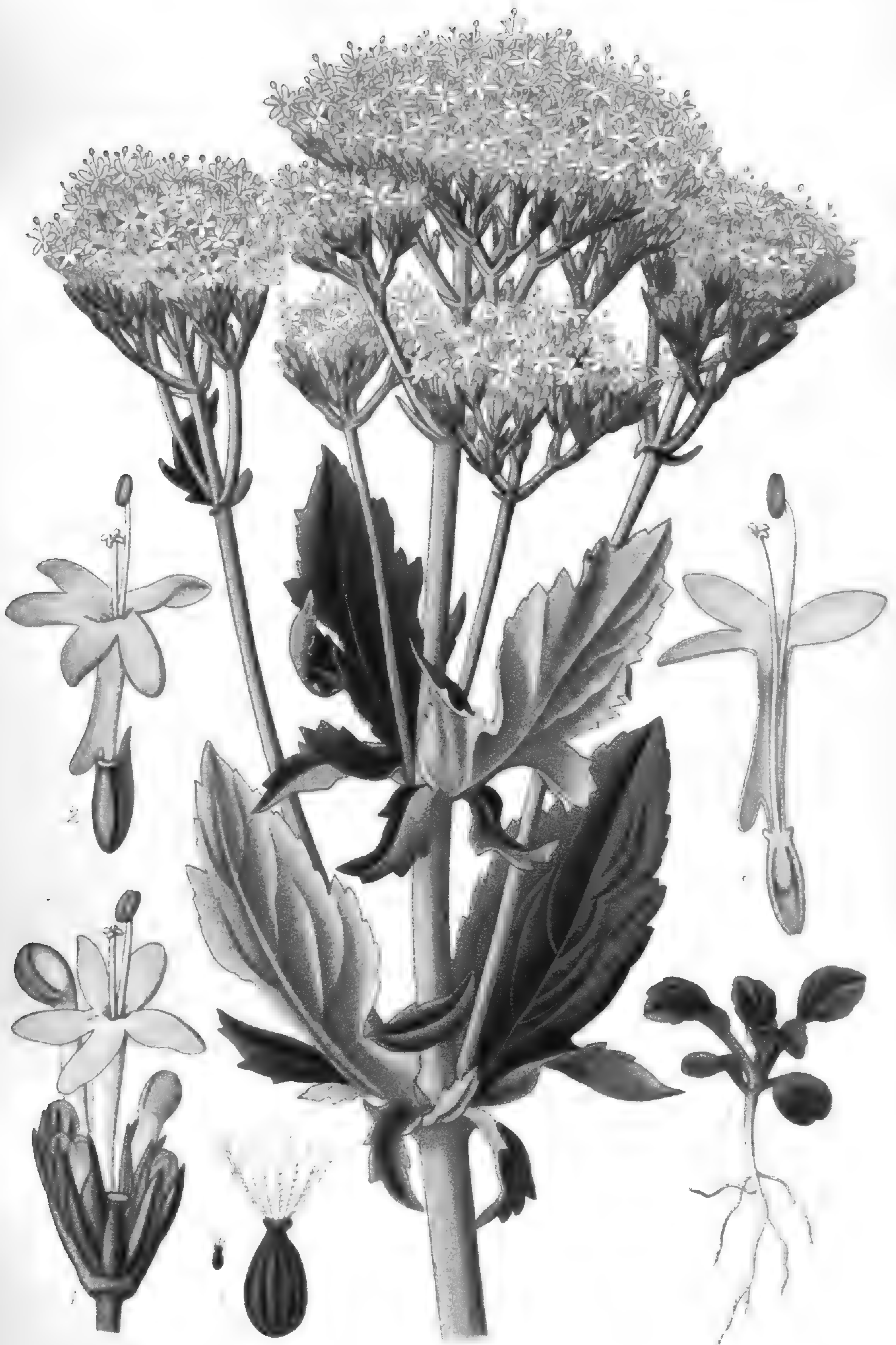
LARGE SPUR VALERIAN (CENTRANTHUS MACROSIPHON)