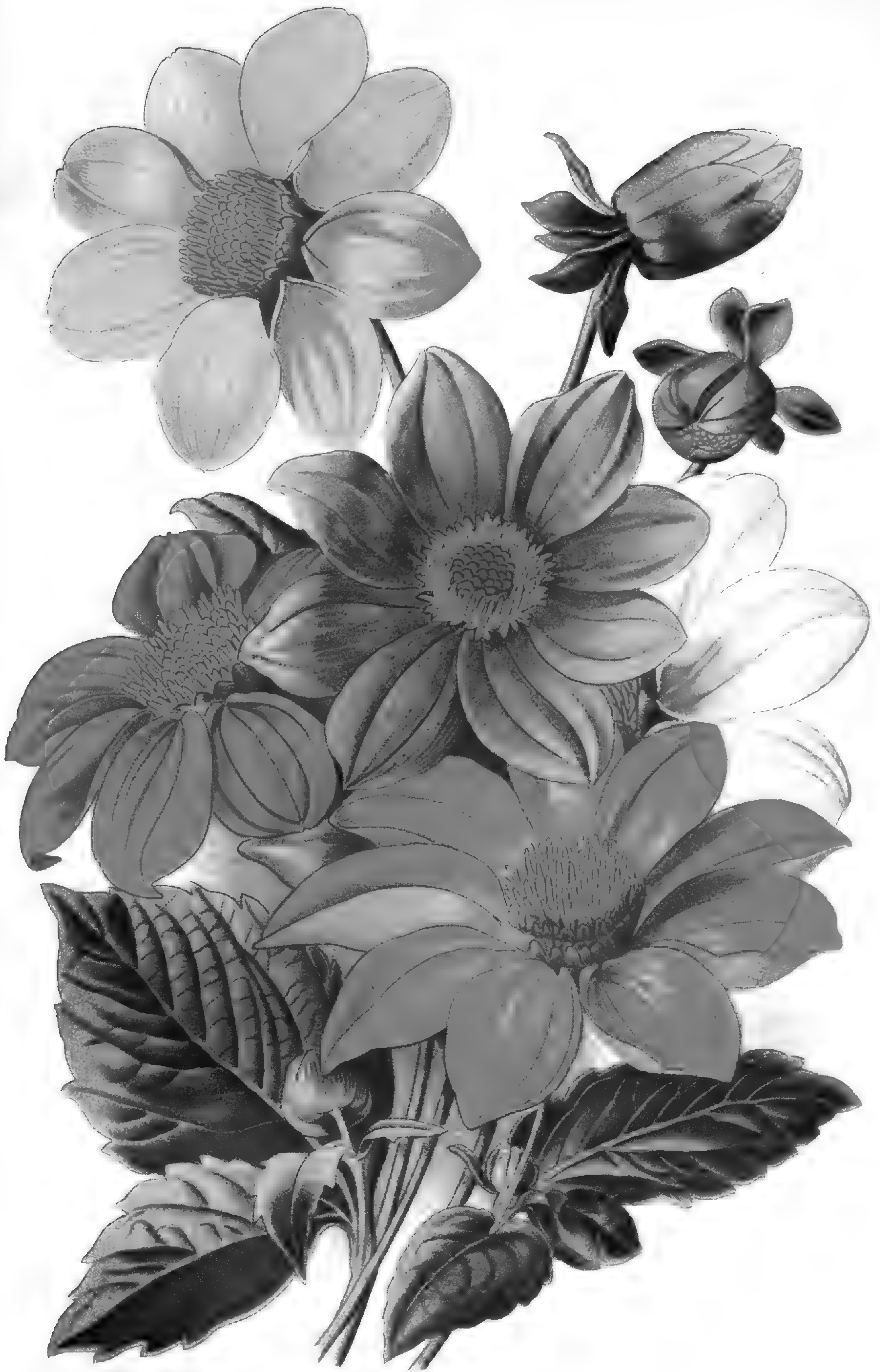
SINGLE DAHLIA ( DAHLIA VARIABILIS )