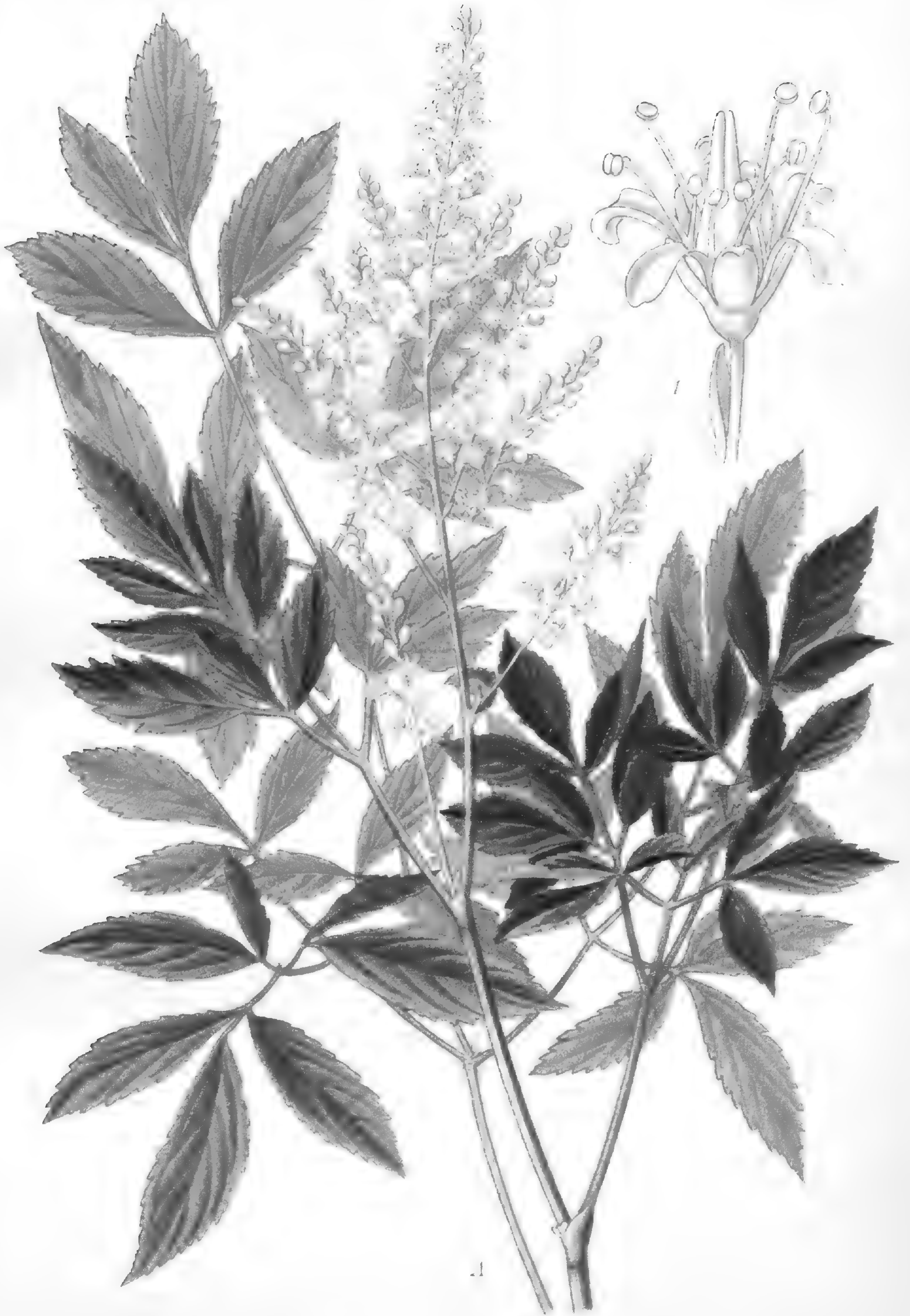
JAPANESE SPIREA (ASTILBE JAPONICA)