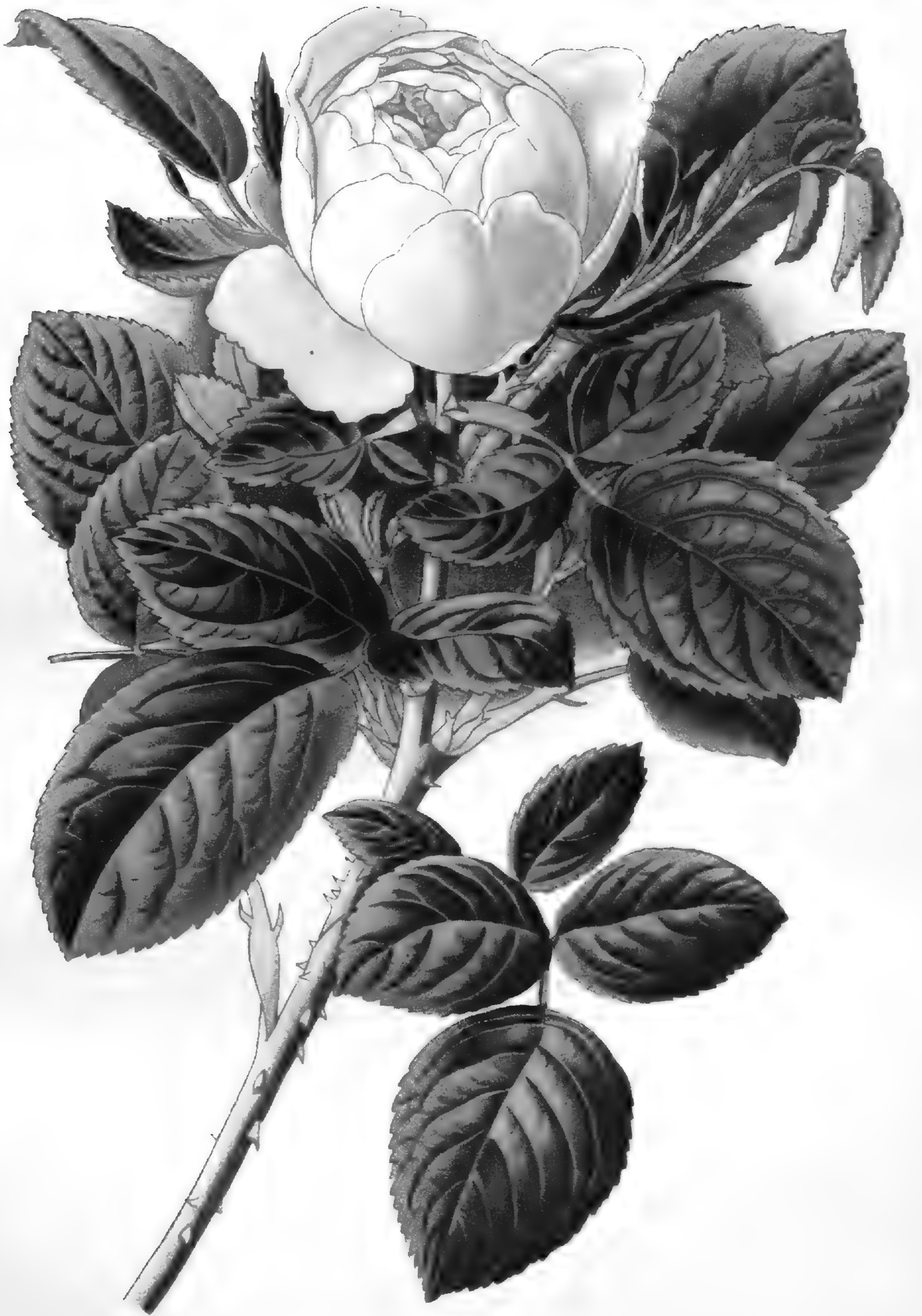
ROSE—"BARONESS ROTHSCHILD" (HYBRID PERPETUAL)