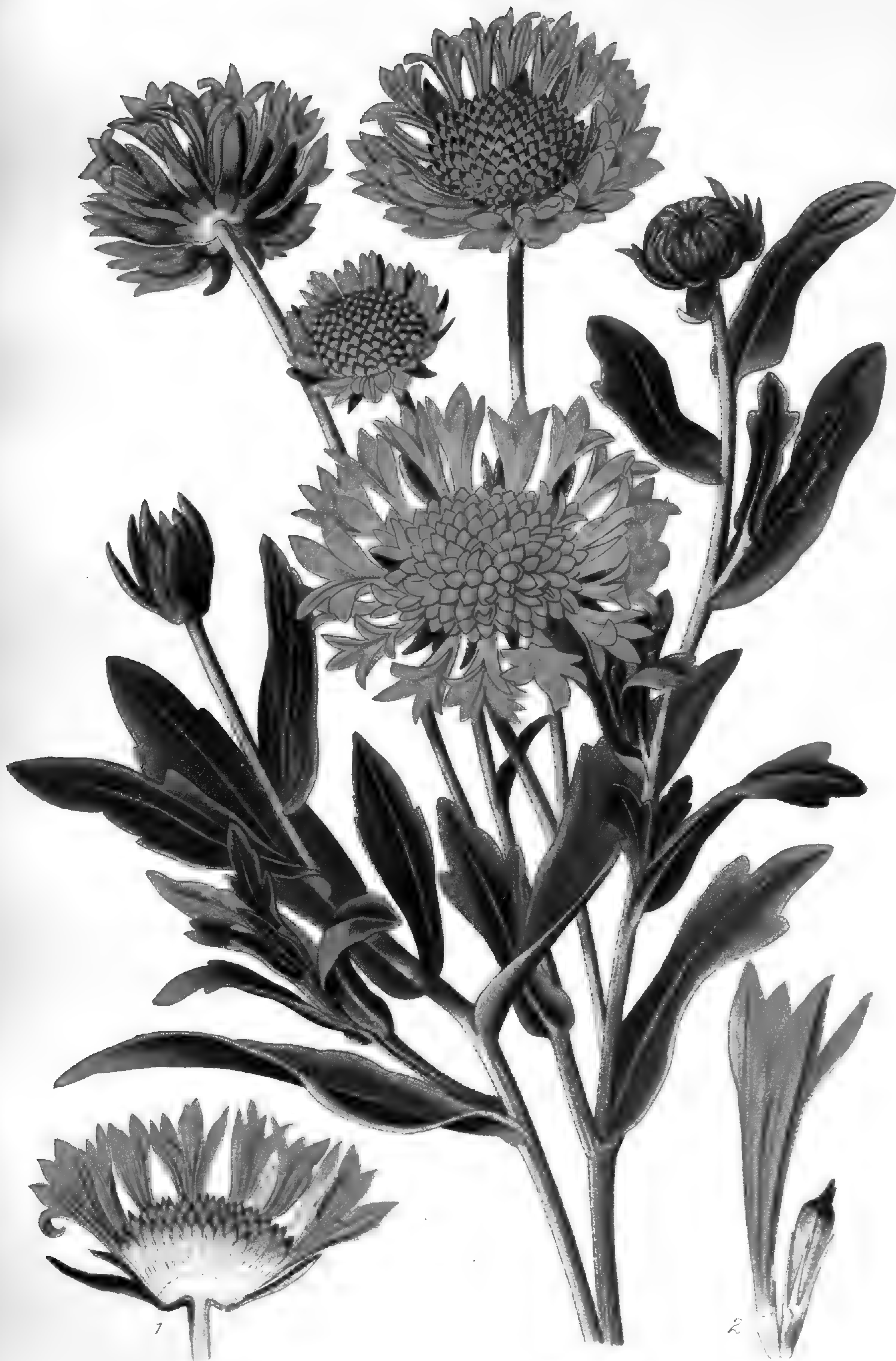
GAILLARDIA PULCHELLA, var. picta