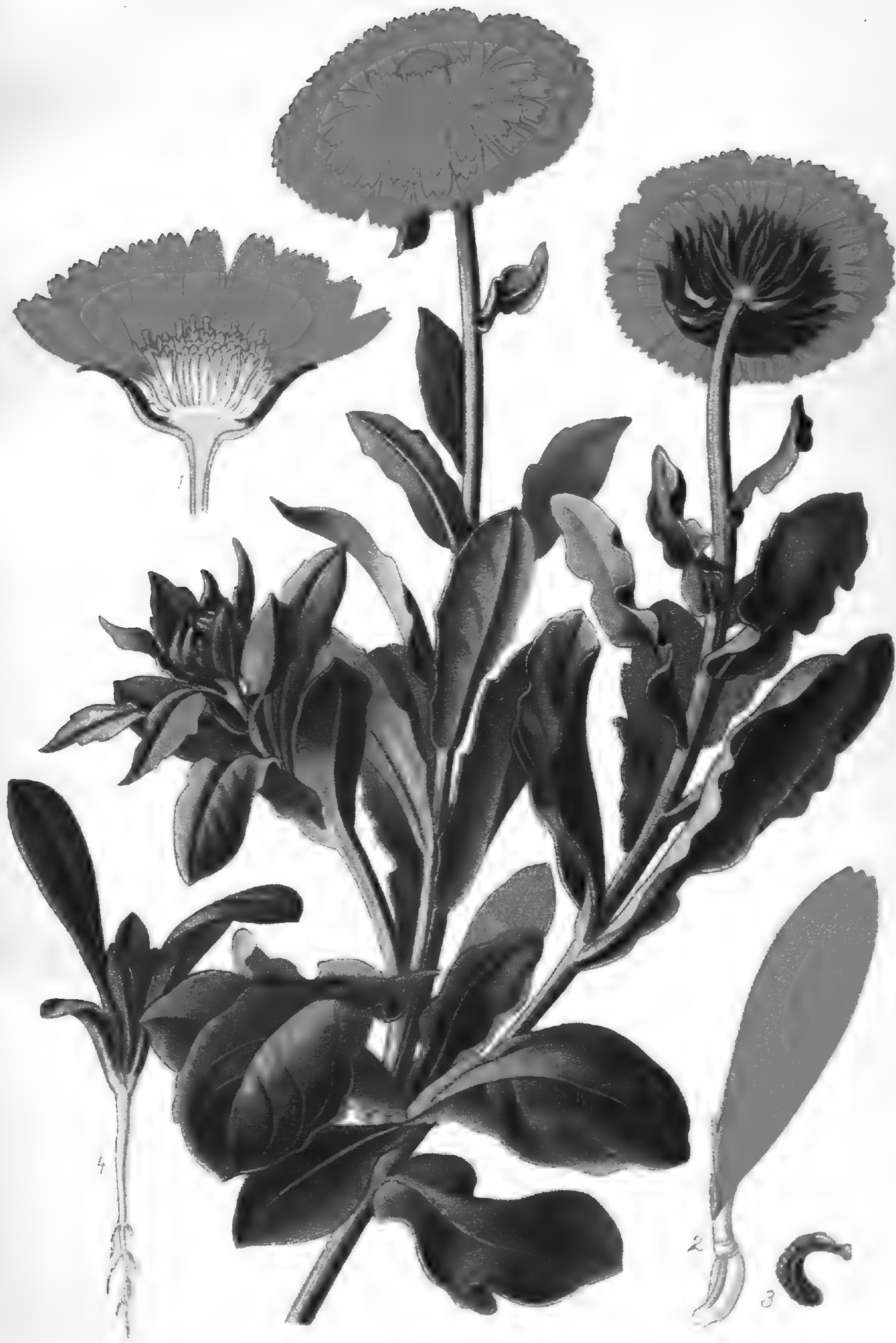
MARIGOLD ( CALENDULA OFFICINALIS )