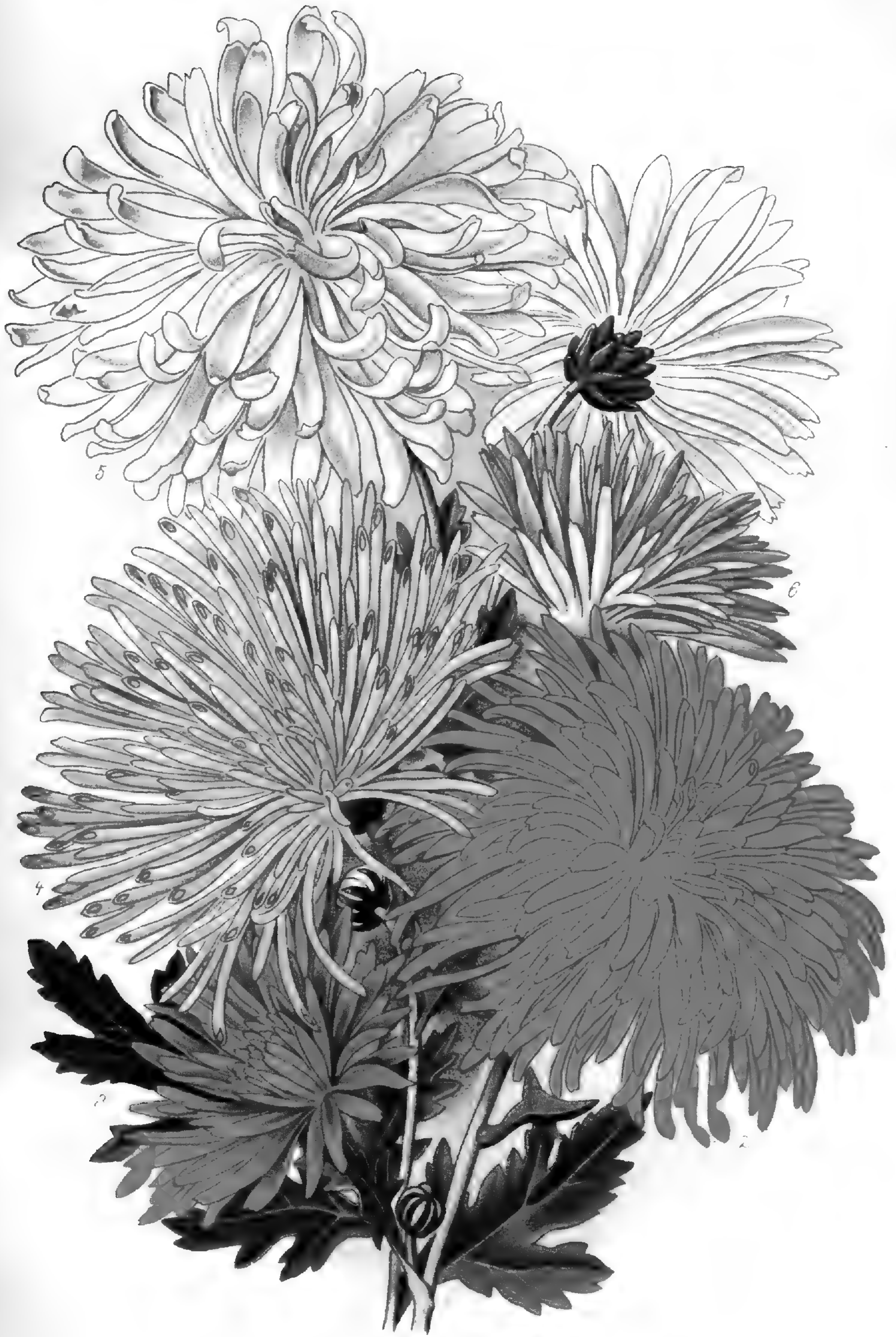
CHRYSANTHEMUMS (CHRYSANTHEMUM SINENSE, vars. )