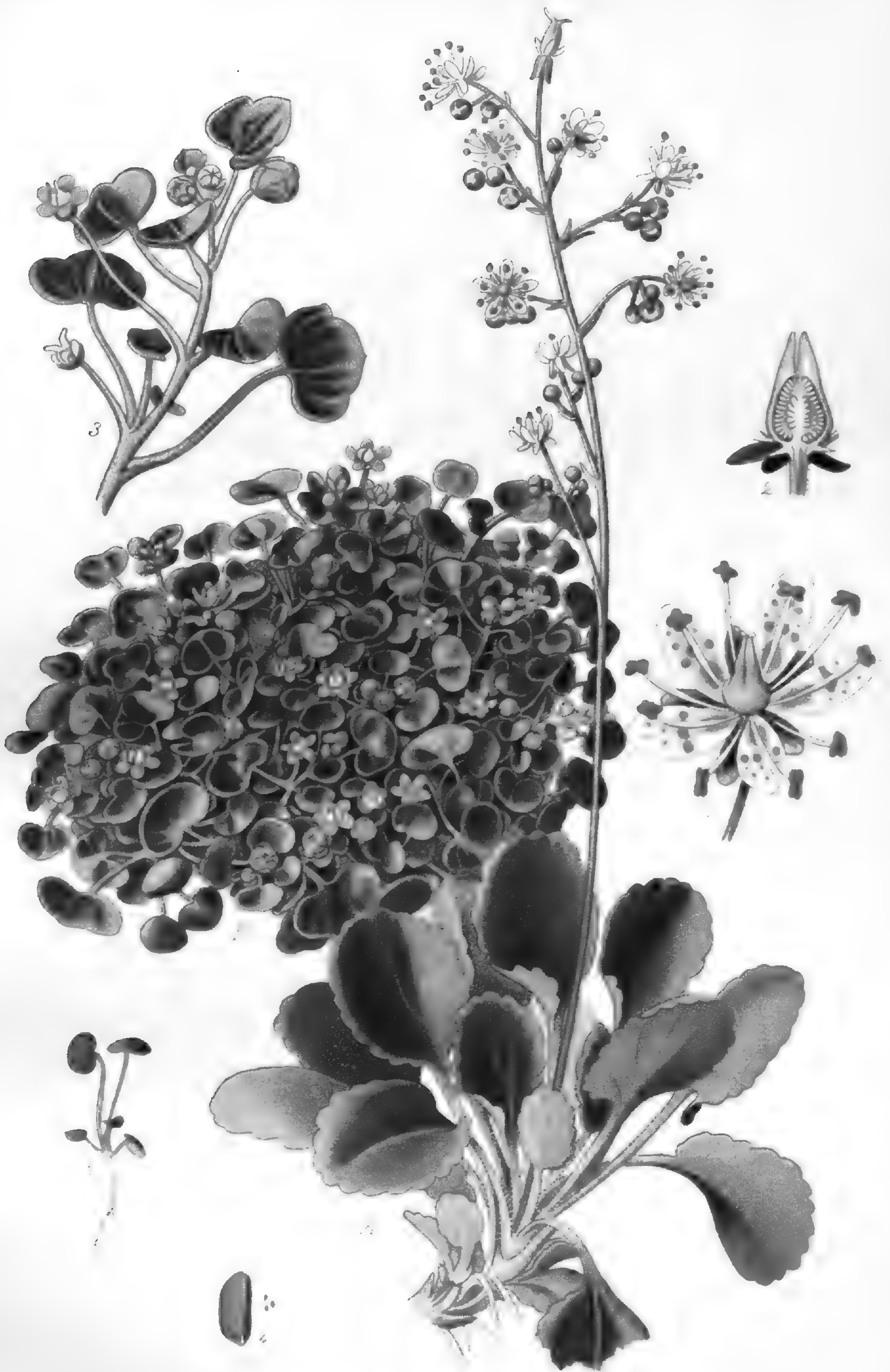
(A) LONDON PRIDE ( SAXIFRAGA UMBROSA )