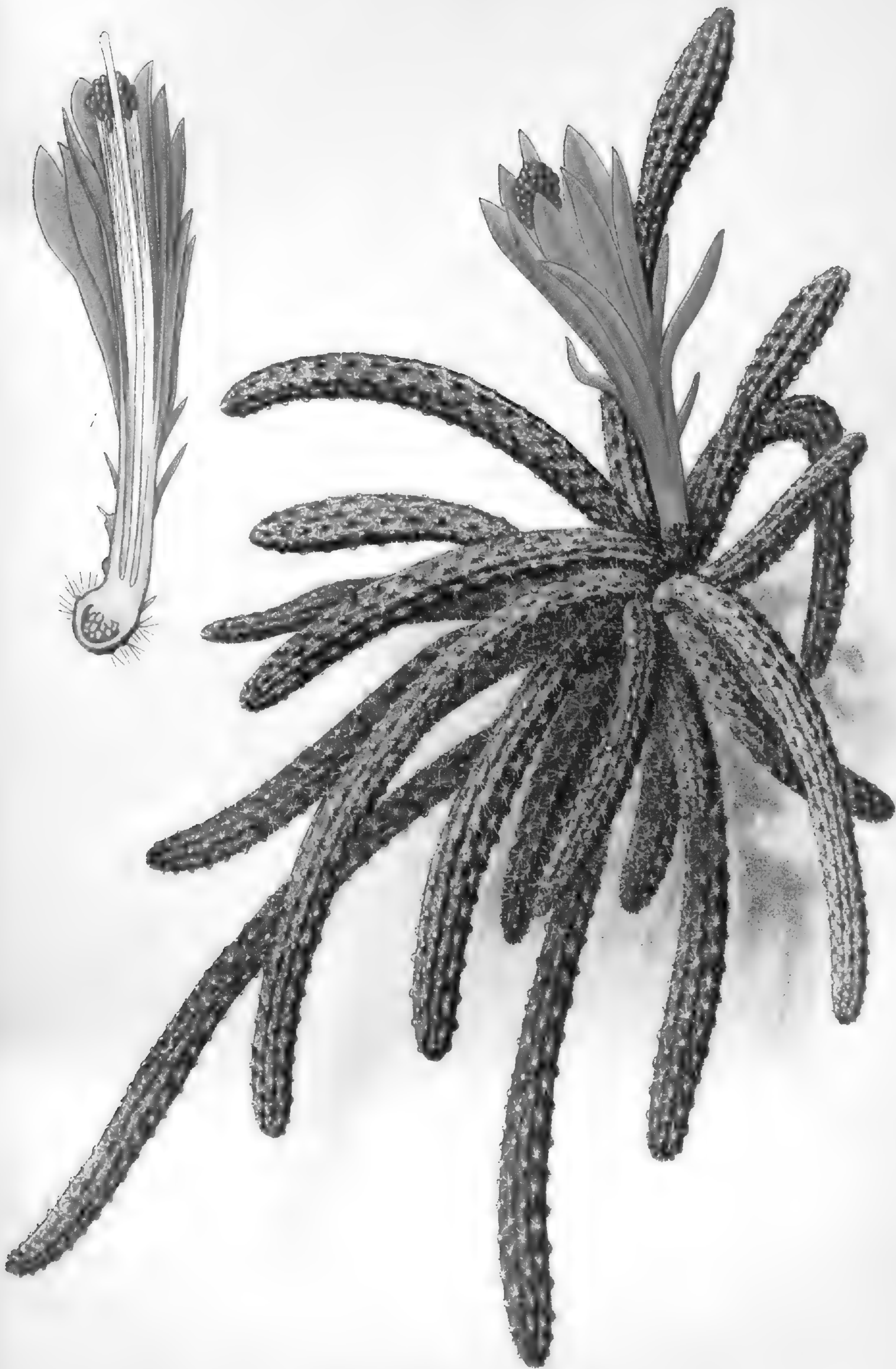
RAT'S-TAIL CACTUS ( CEREUS FLAGELLIFORMIS )