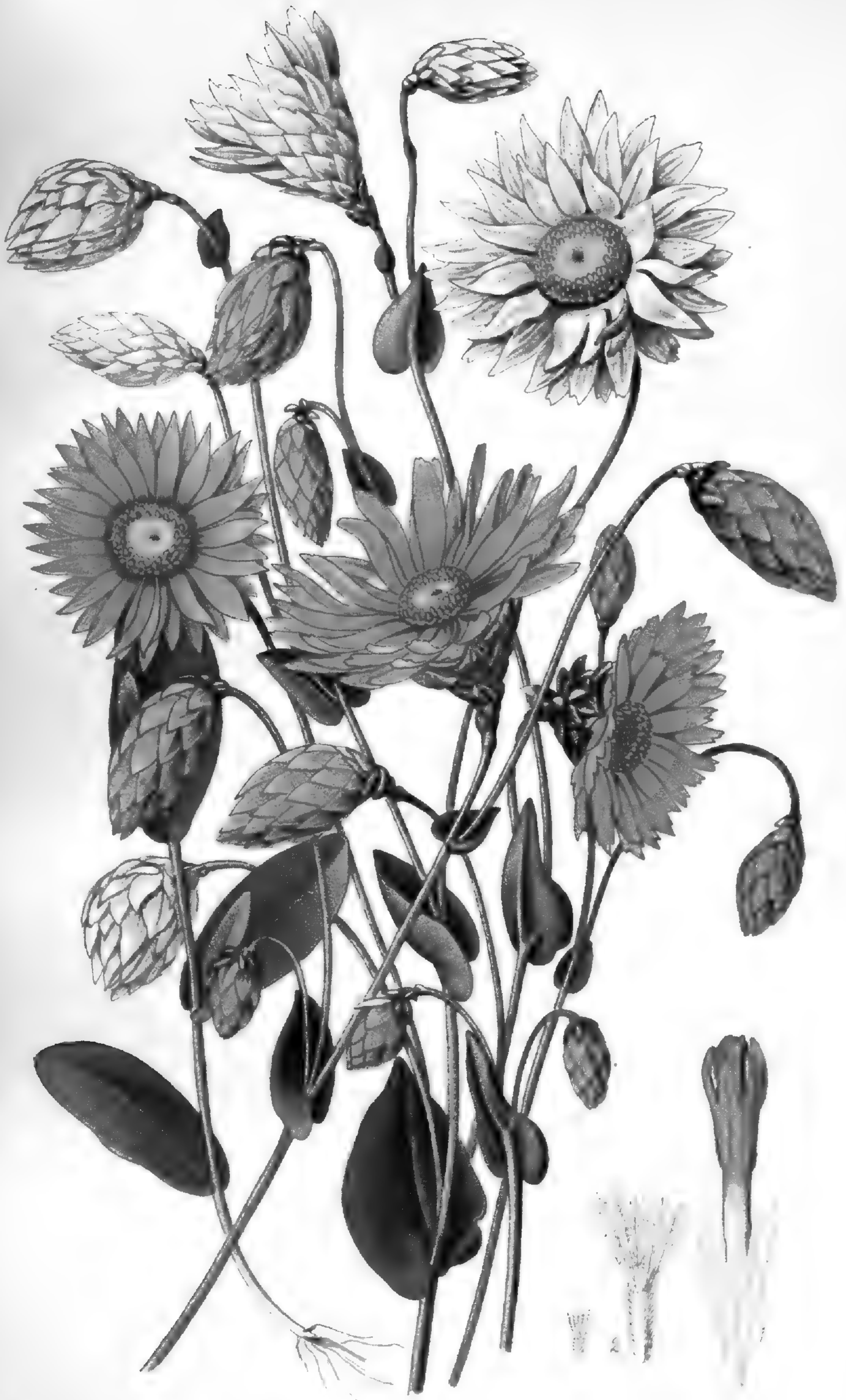
ROSY EVERLASTING FLOWER (HELIPTERUM MANGLESII)