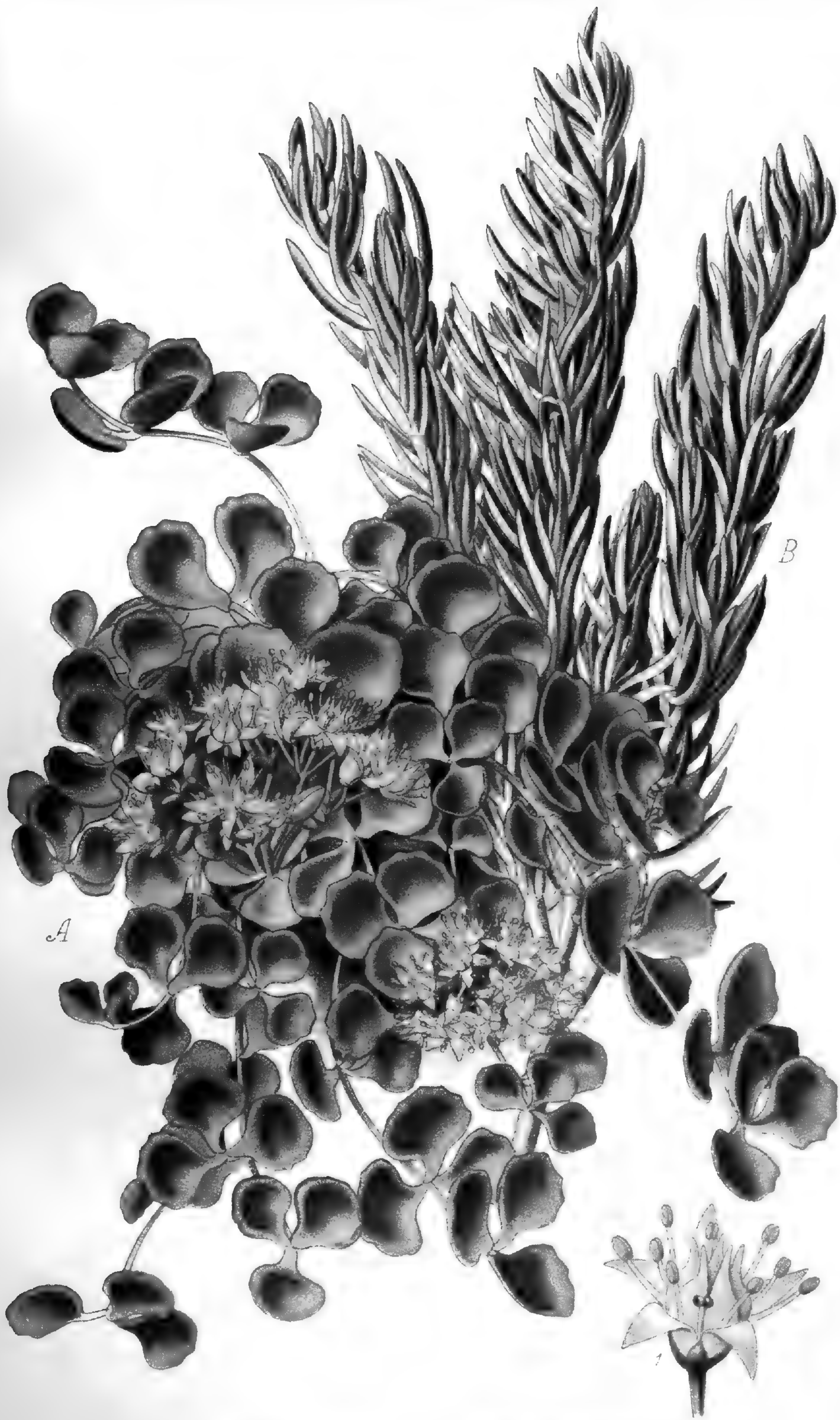
(A) SEDUM SIEBOLDII