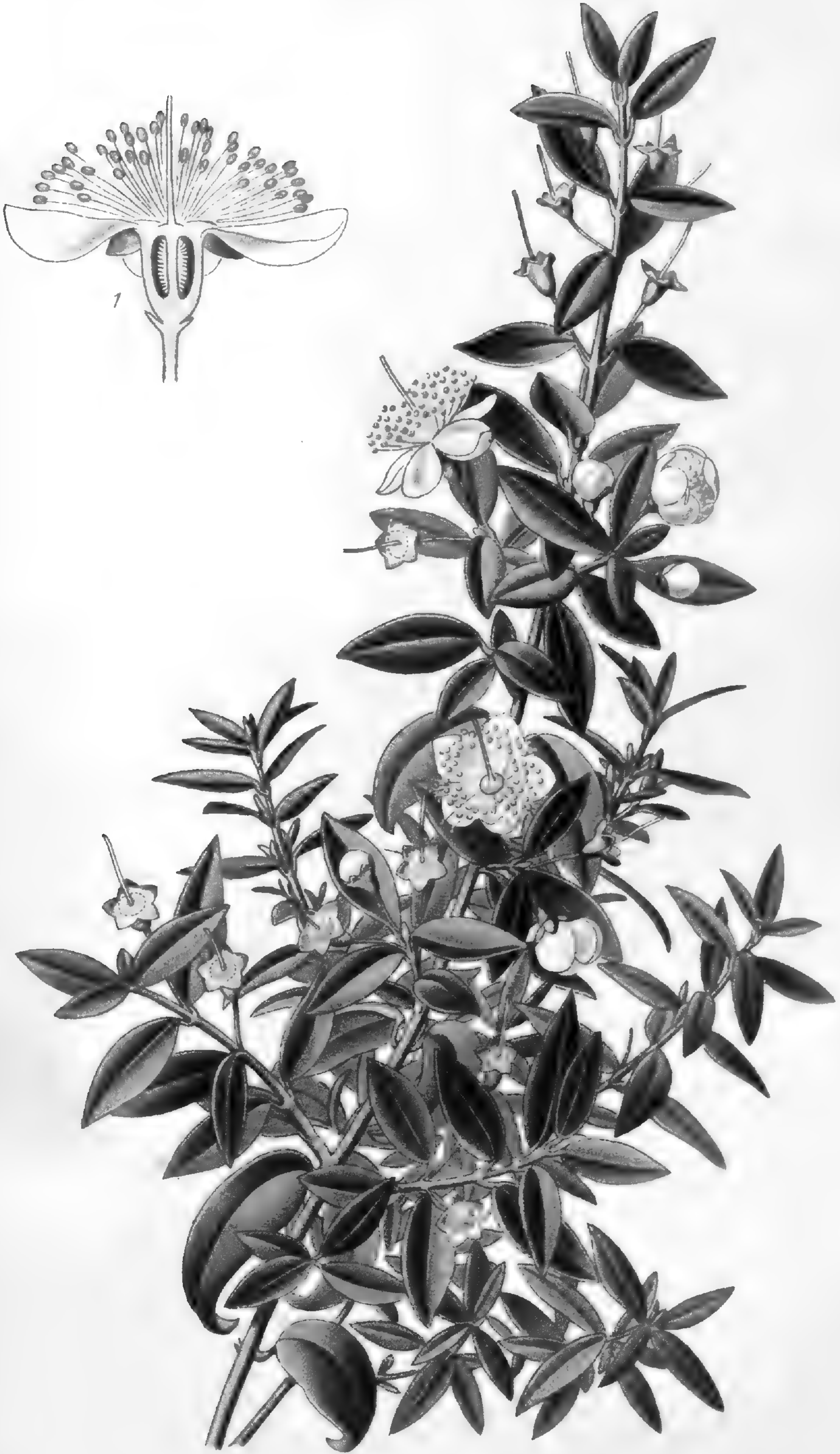
MYRTLE (MYRTUS COMMUNIS)