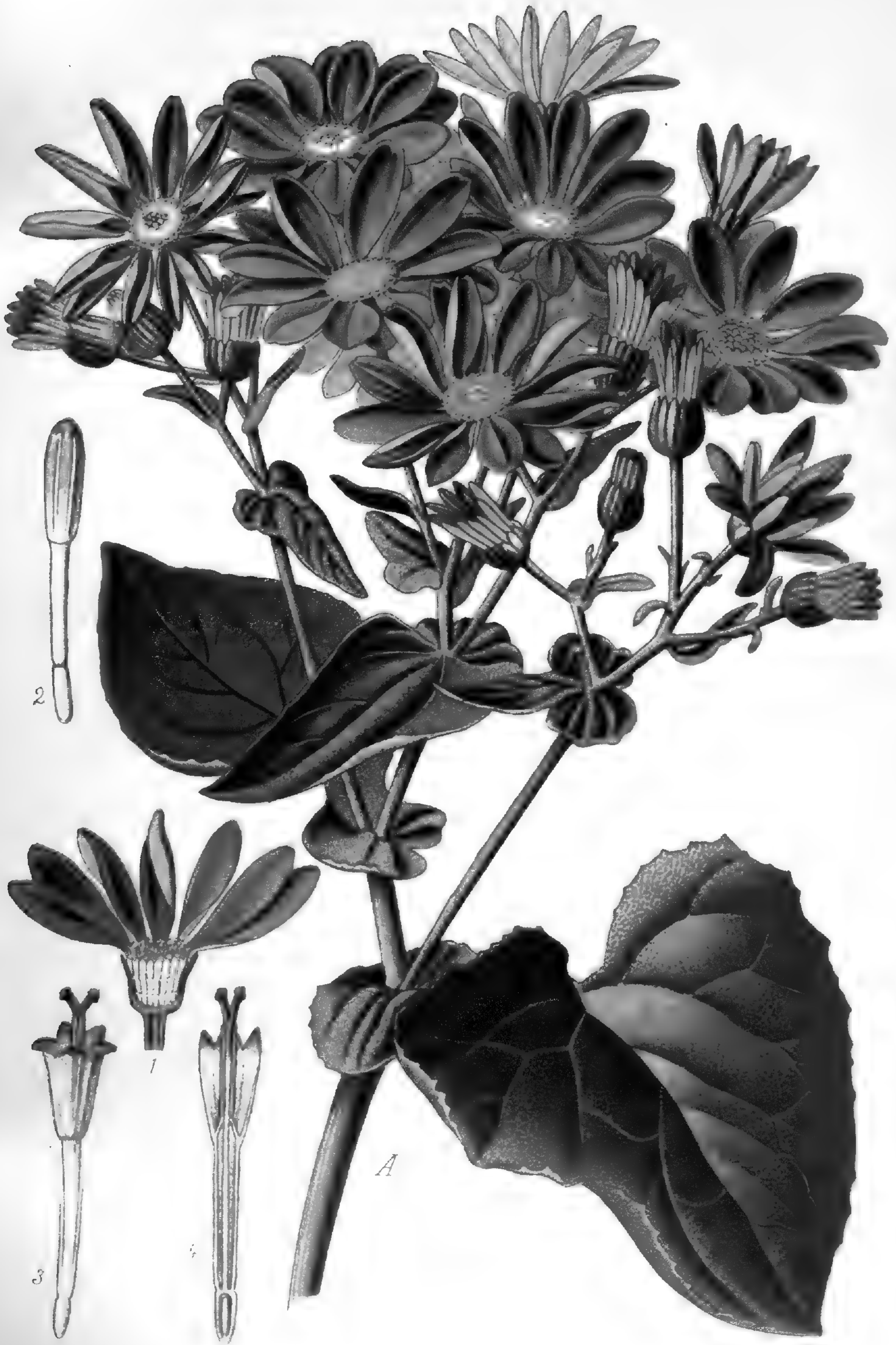
CINERARIA (SENECIO CRUENTUS, var. )