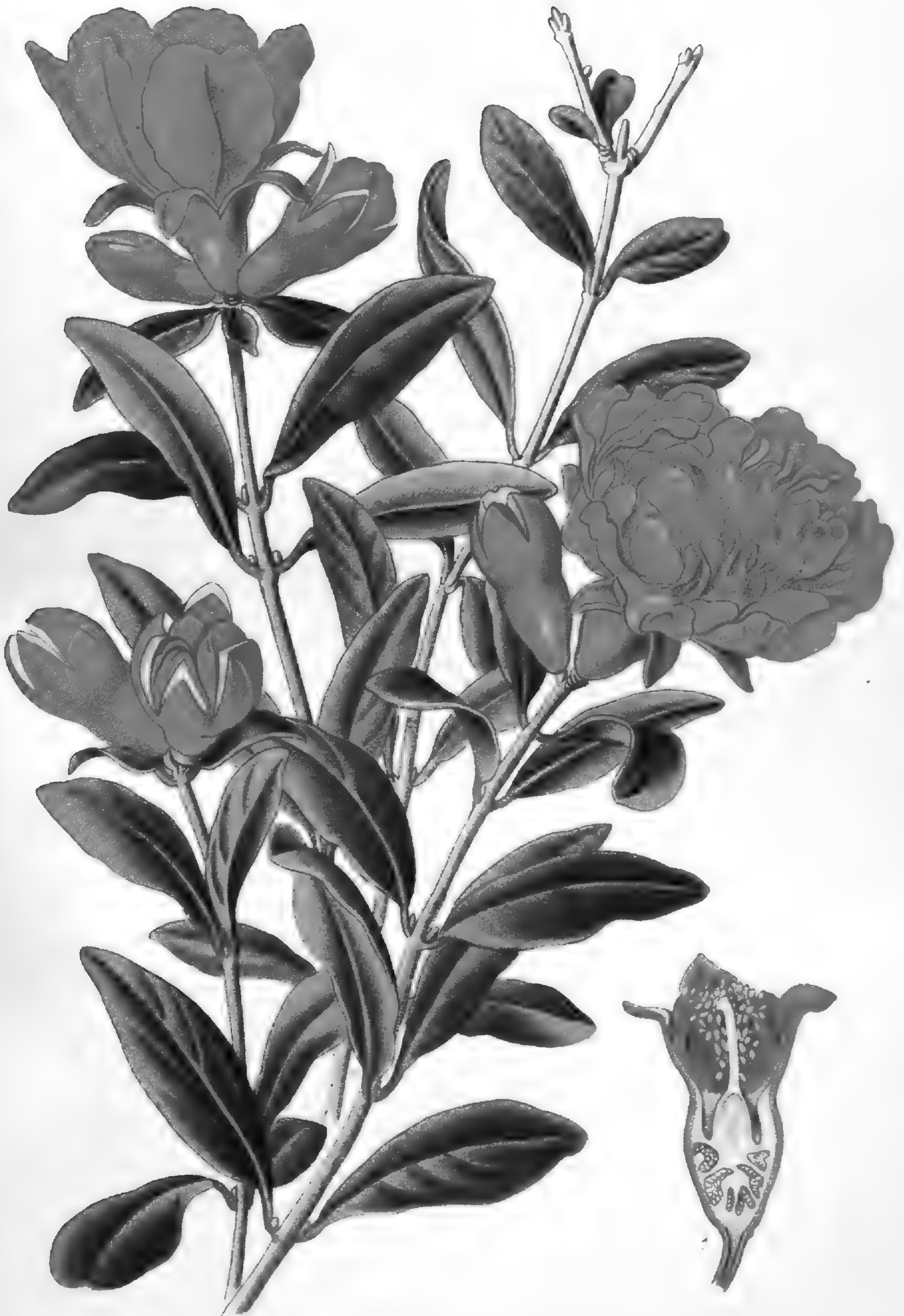
POMEGRANATE (PUNICA GRANATUM)