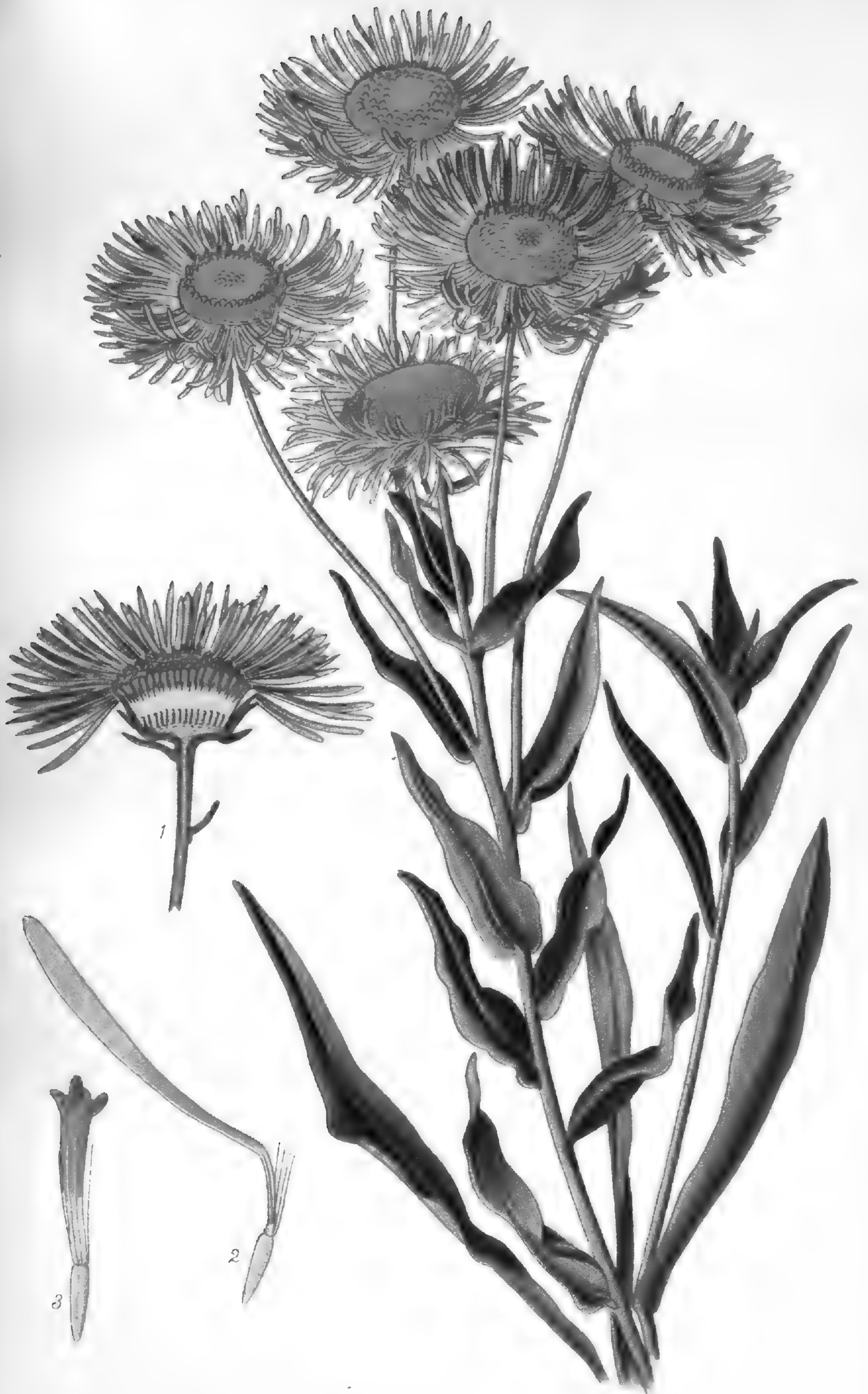
SHOWY FLEABANE (ERIGERON SPECIOSUM)