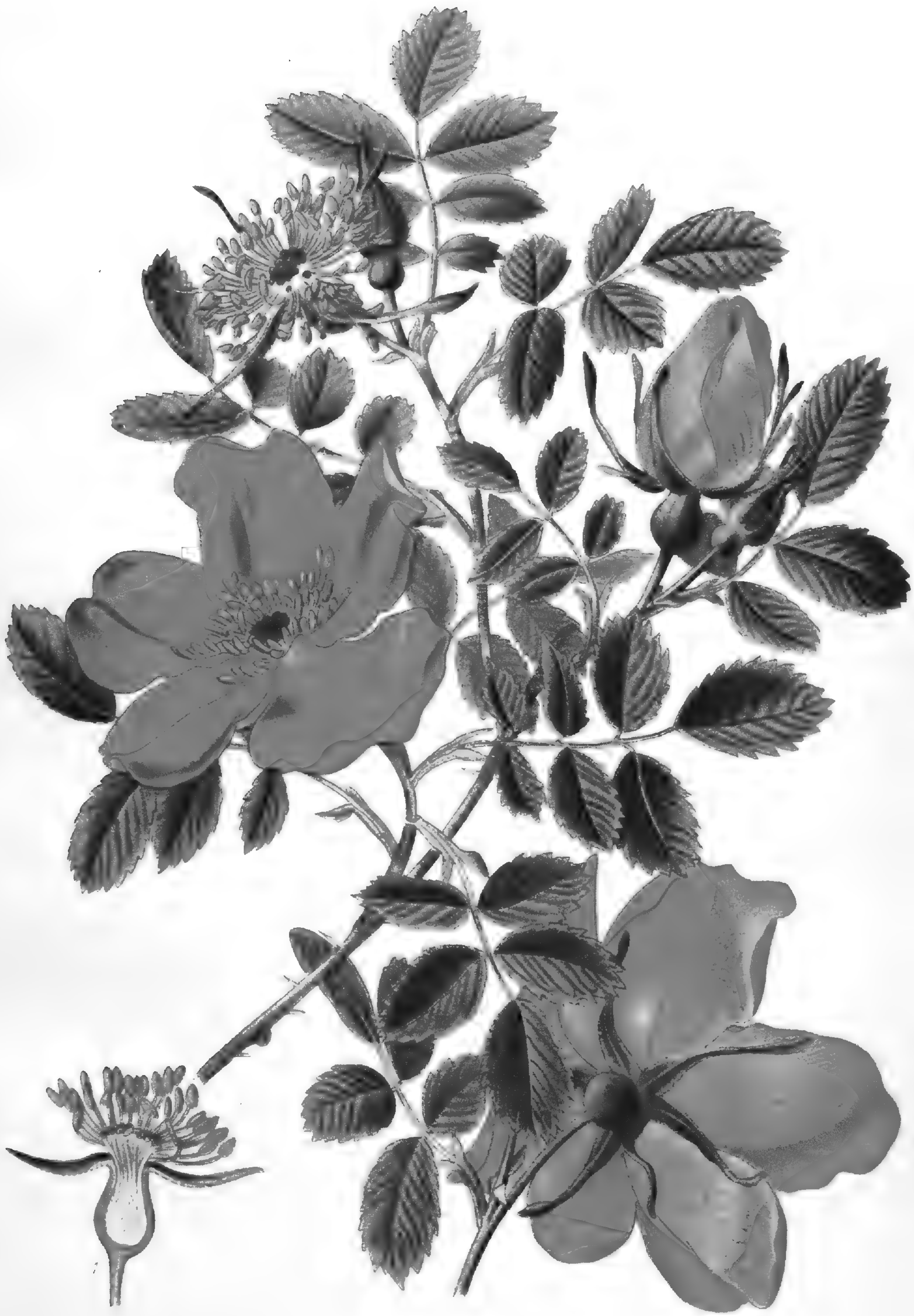
AUSTRIAN BRIAR ( ROSA LUTEA — var. punicea )