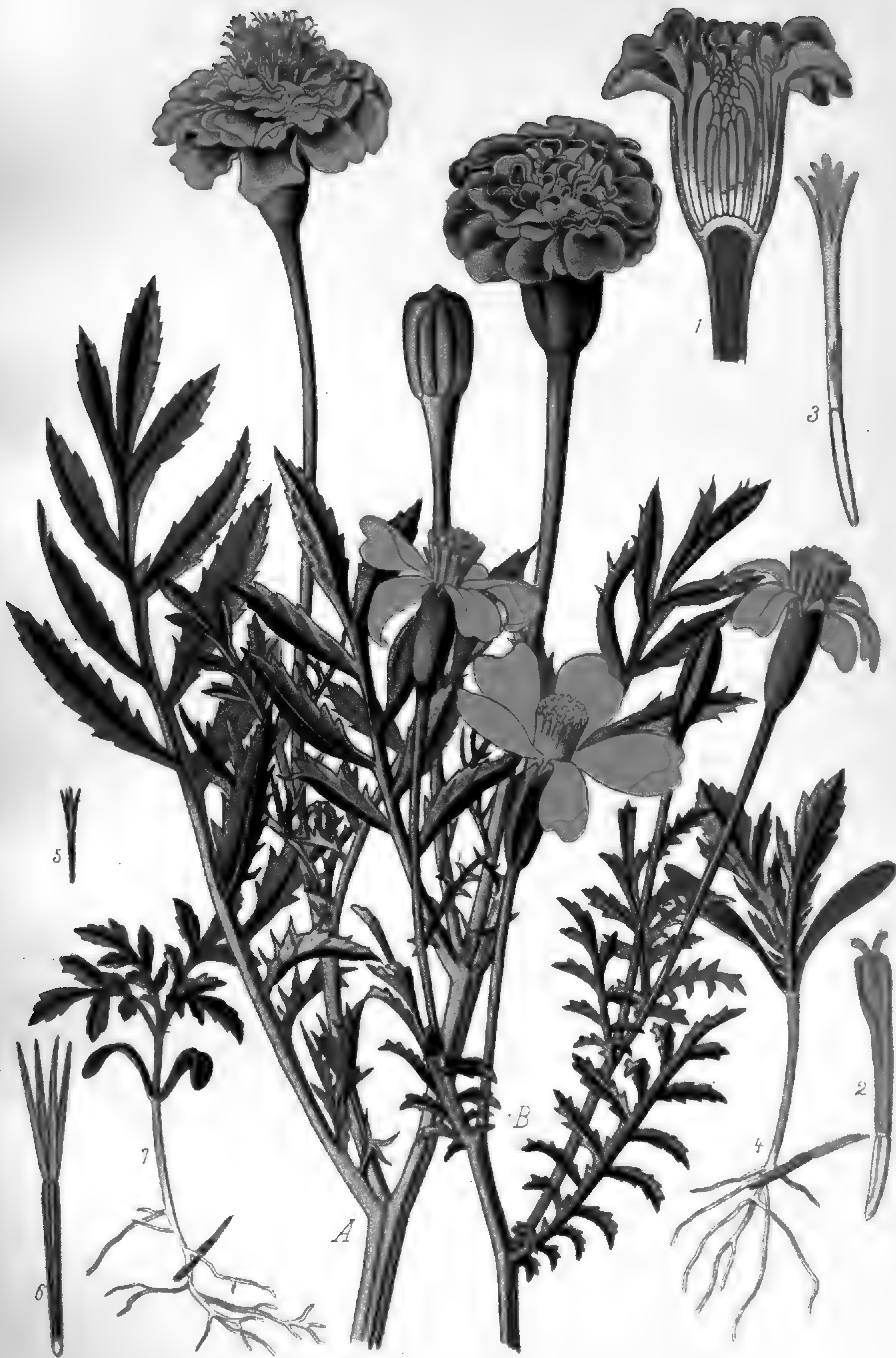
(A) FRENCH MARIGOLD ( TAGETES PATULA ) (B) MEXICAN MARIGOLD ( TAGETES SIGNATA )