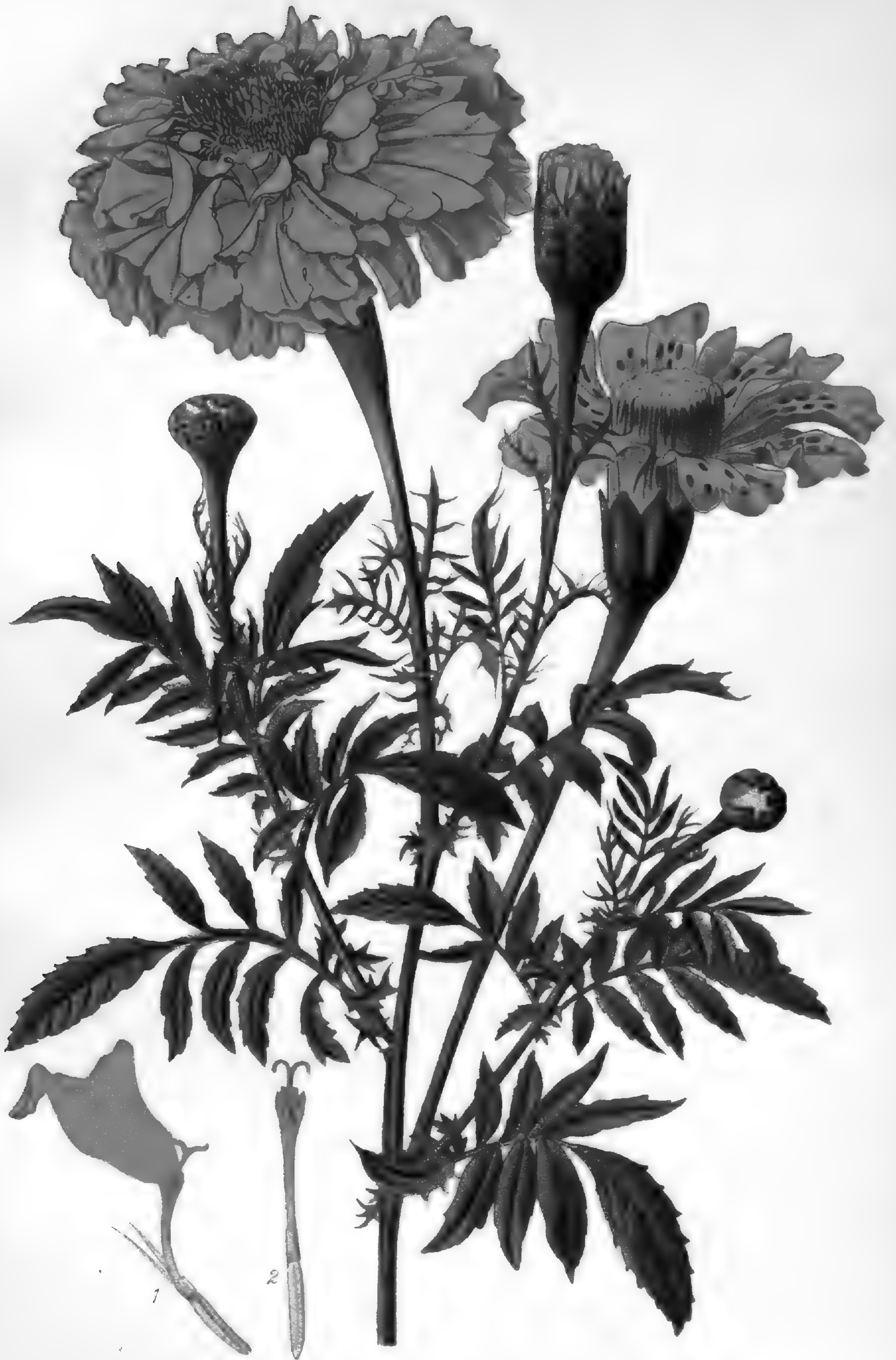
AFRICAN MARIGOLD ( TAGETES ERECTA )