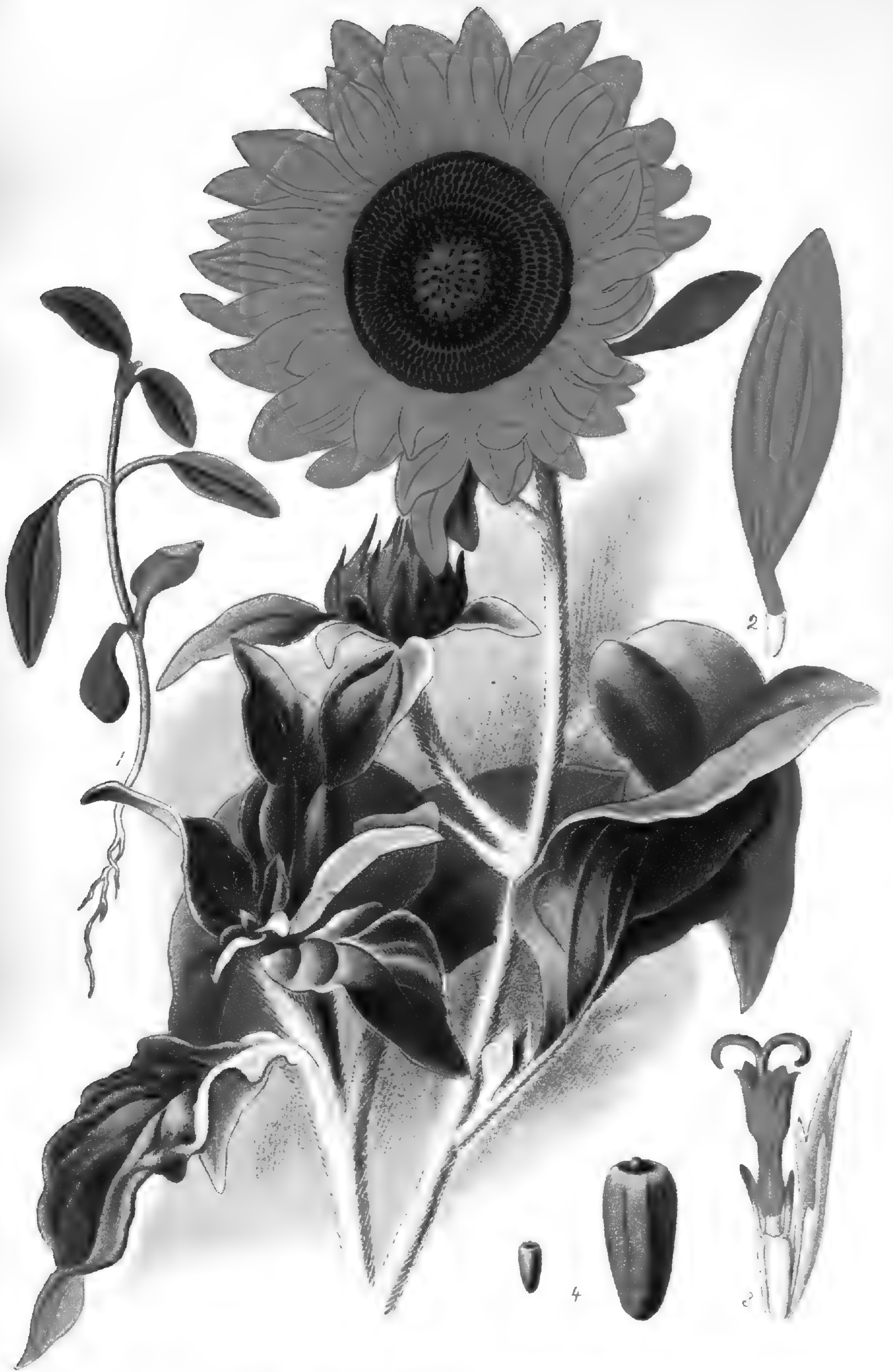
SILVER-LEAVED SUNFLOWER ( HELIANTHUS ARGOPHYLLUS )