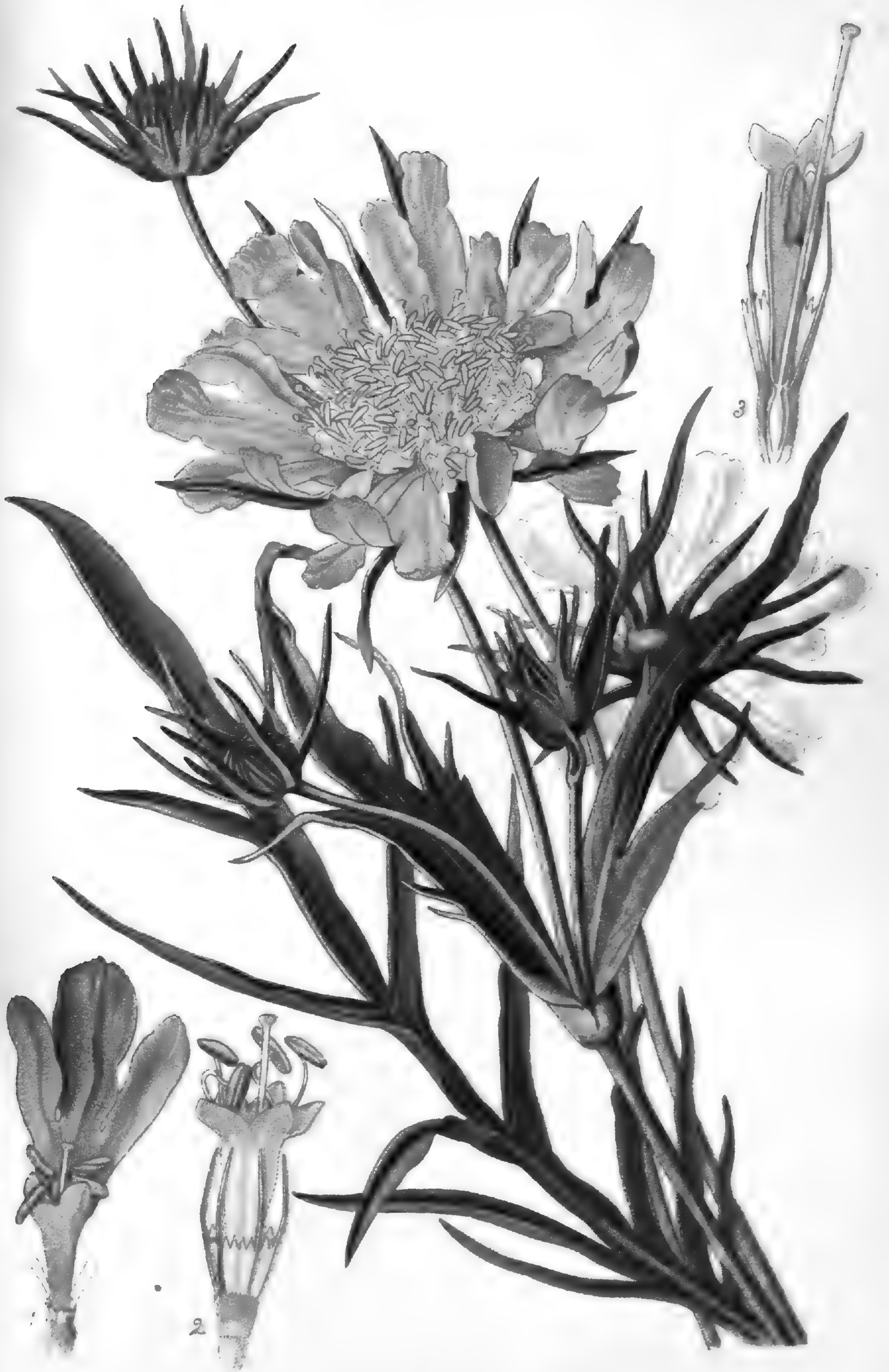
CAUCASIAN SCABIOUS (SCABIOSA CAUCASICA)