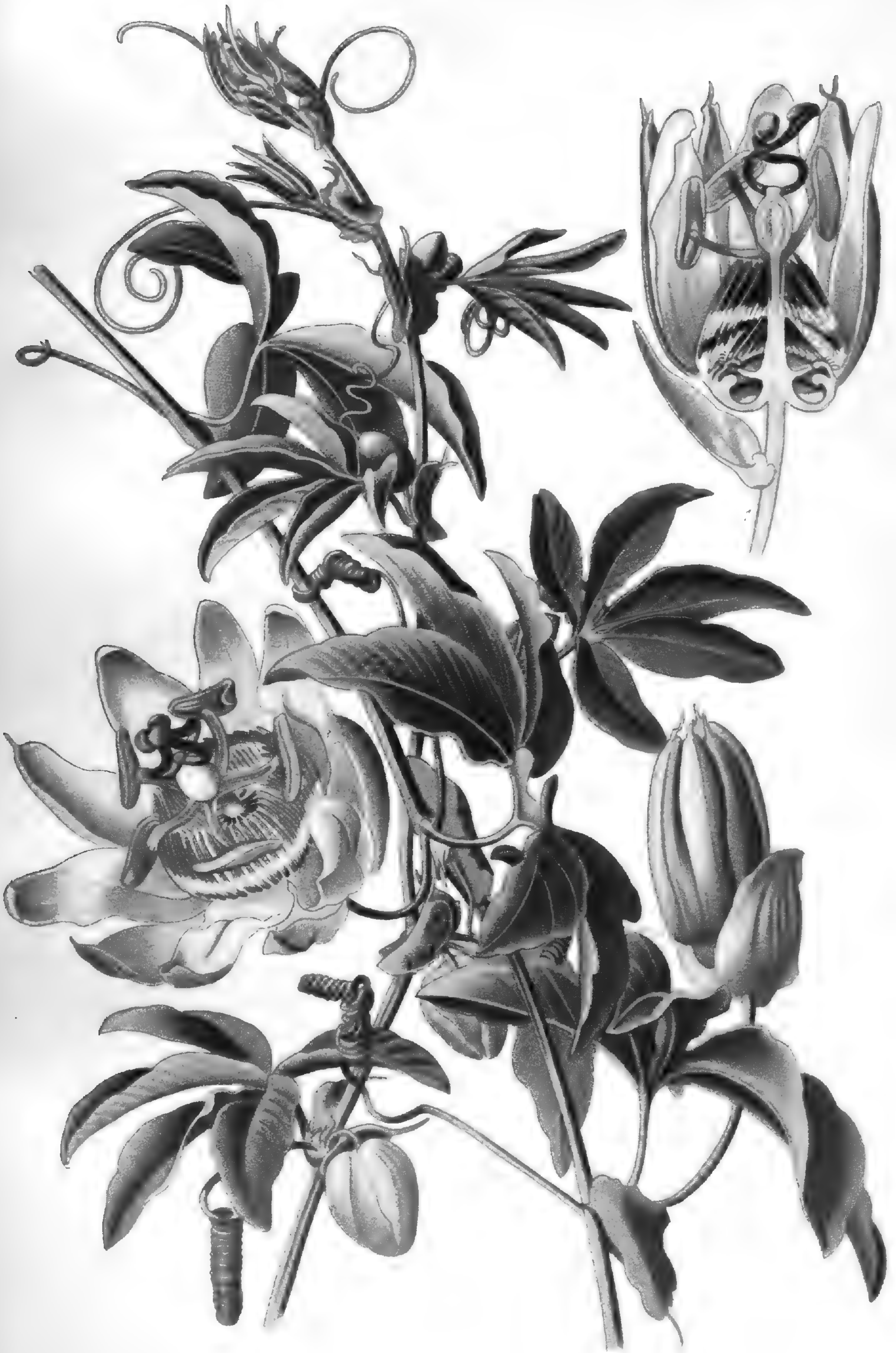
PASSION-FLOWER (PASSIFLORA CŒRULEA)