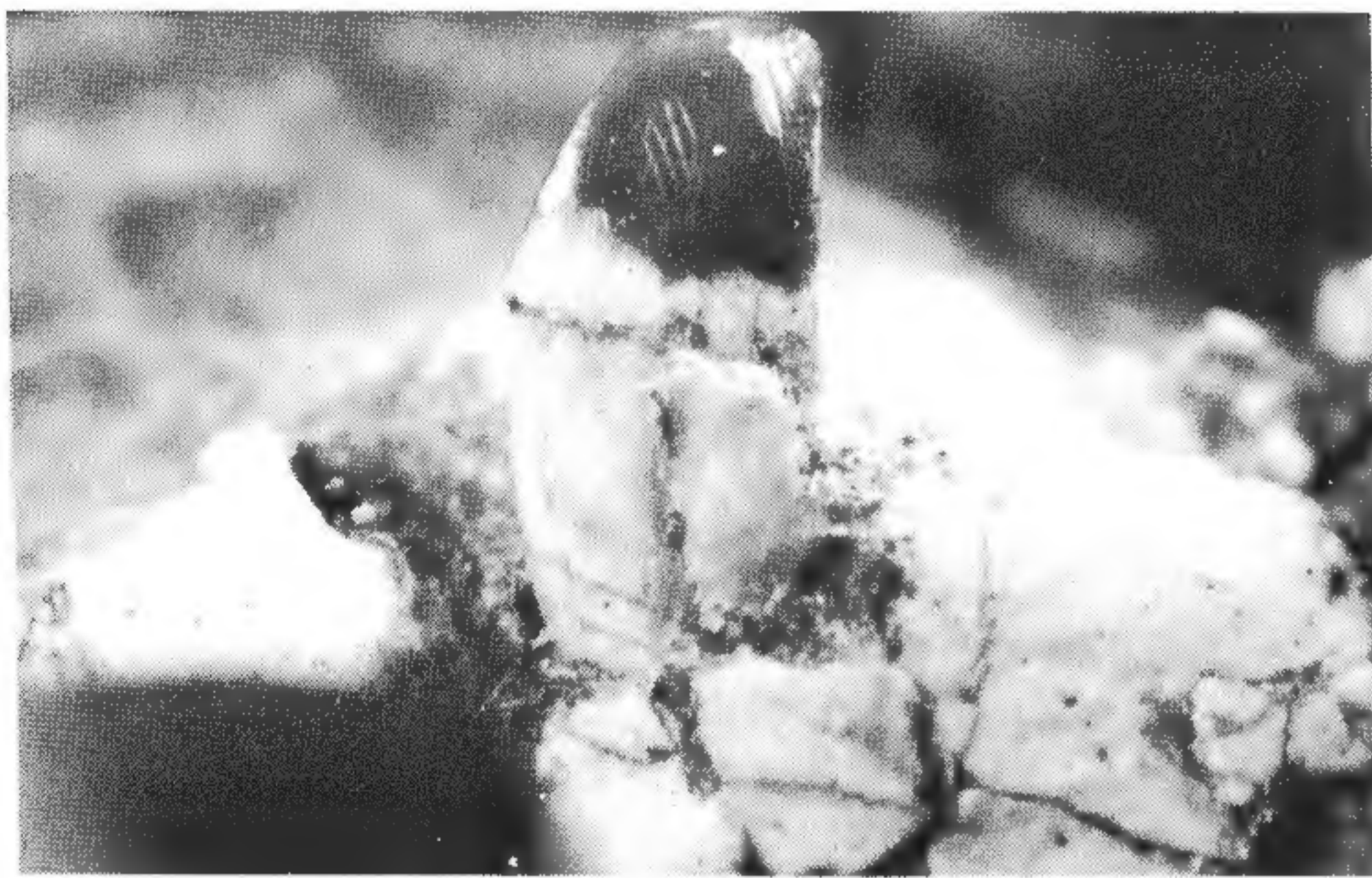
Fig. 2 Lateral view of canine of the holotype of Alocodon atopum , YPM 30790.

two tiny single-rooted premolars, now indicated only by indistinct alveoli which are circular in cross-section. When the specimen was first studied by one of us (T.M.B.) in 1972, the crown of P 1 was present, but was later lost. It was simple and bulbous with no cingula or cristae. The shape and outline of the cross-section of the root of P 2 is like that of P 1 , and presumably its crown was similar (see Fig. 3).