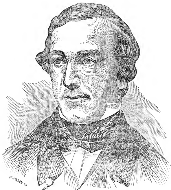
HON. MAYOR WOOD.