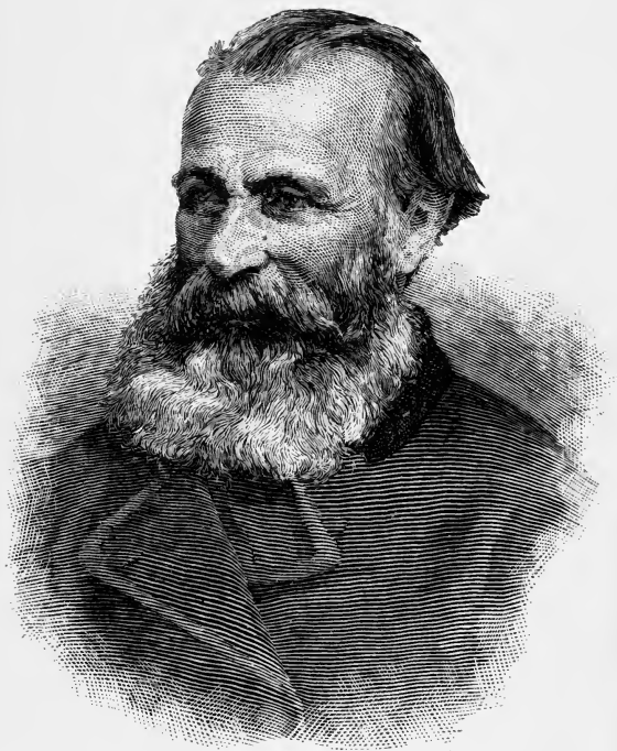
FRANCESCO DALL' ONGARA.