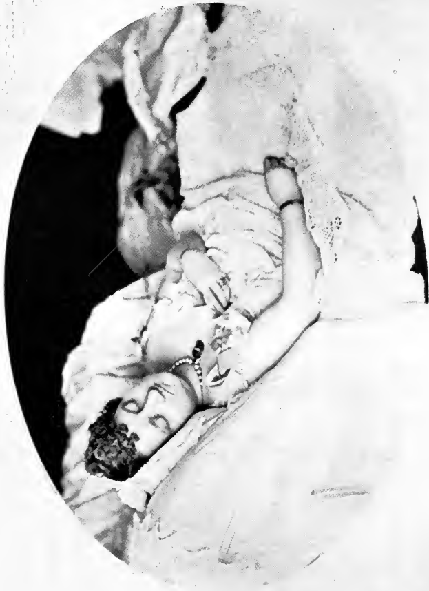
AS MOLLIE FANCHER APPEARED IN 1887, IN A TRANCE.