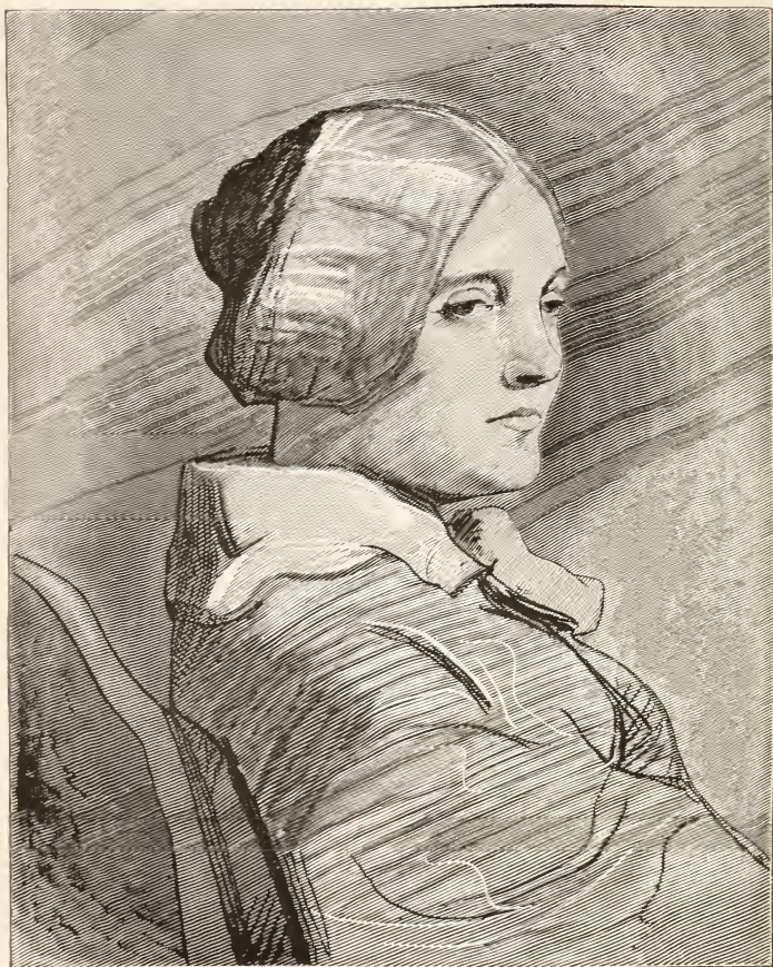
HARRIET LADY ASHBURTON.