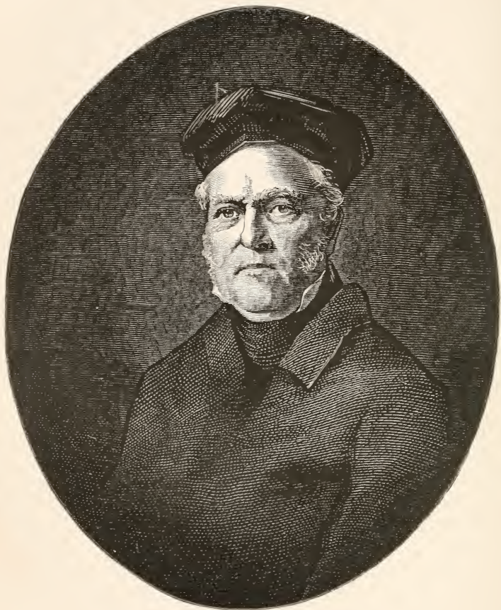
WALTER SAVAGE LANDOR.