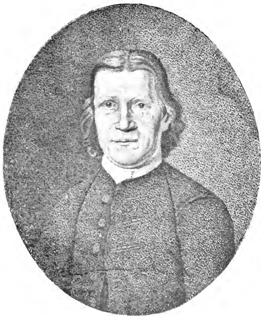
REV. D. ZEISBERGER.