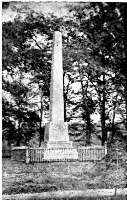
MONUMENT AT GNADENHUTTEN, OHIO.