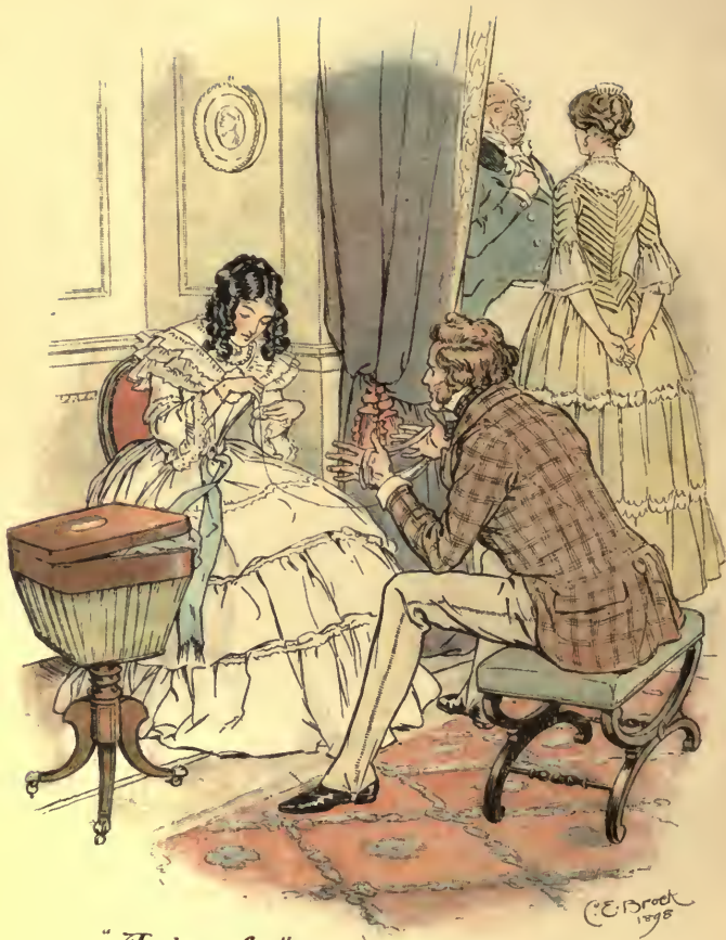
"A skein of silk to wind"