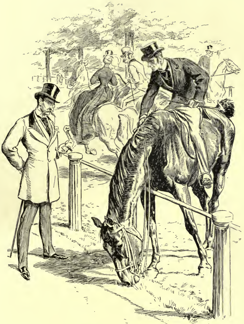
"The purchaser was biting"