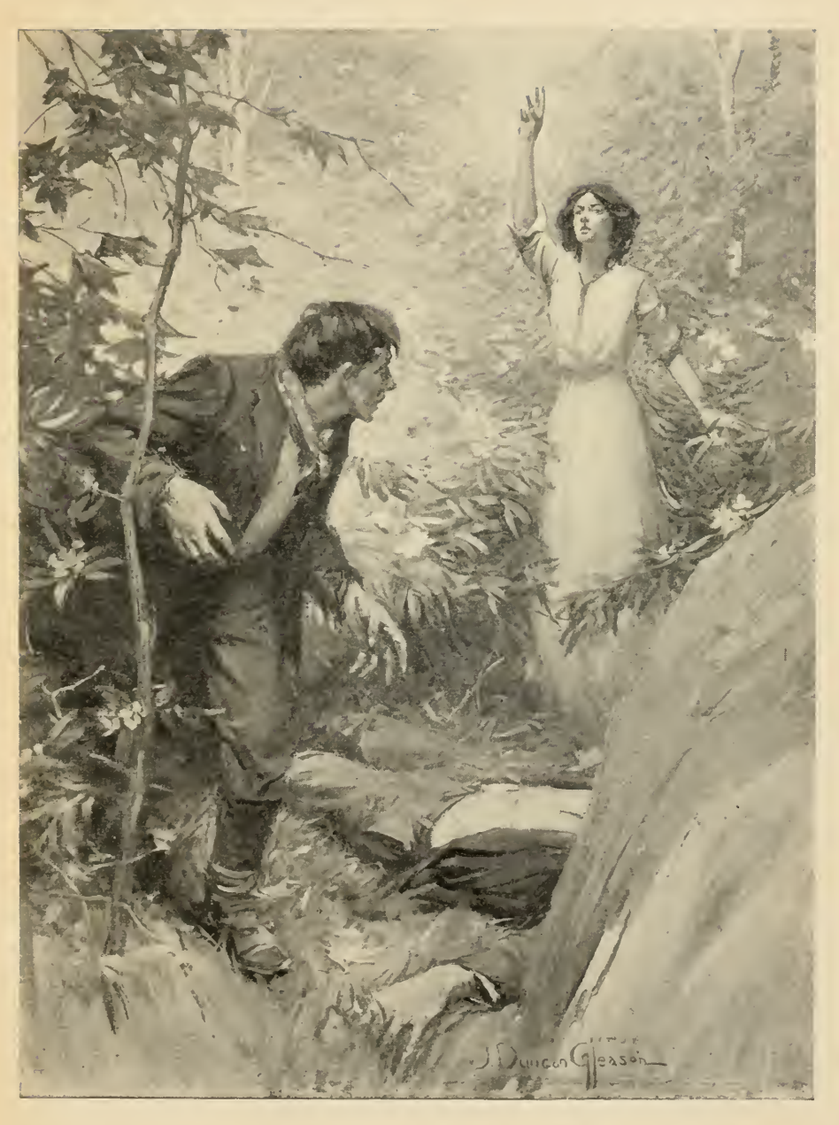
"I take it back-back from God-the promise I gave you there by the fall." Page 171.