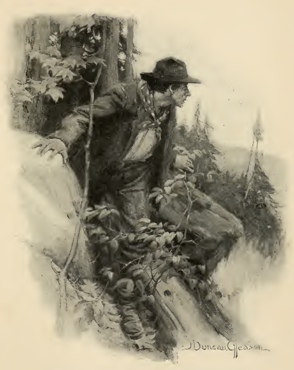
Skulking and hiding by day, and struggling on again by night. Page 70.