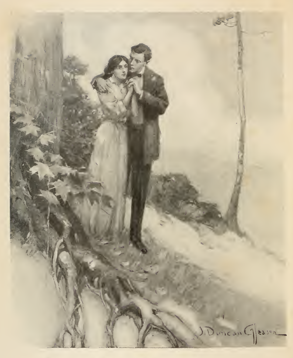
"We will go home-to my home-just like this, together." FRONTISPIECE. See Page 311.