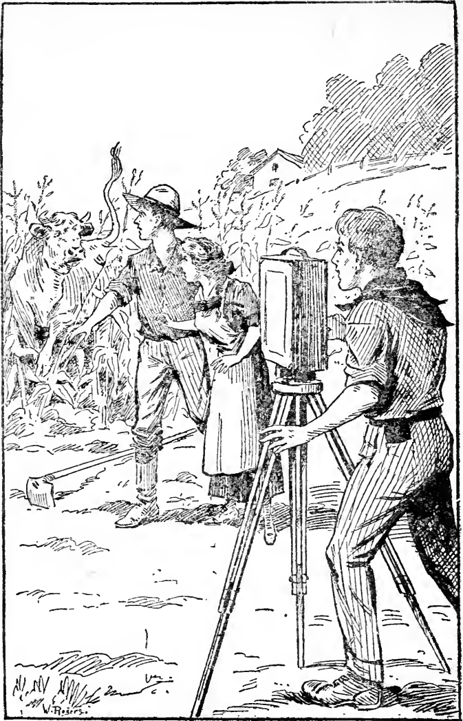
A BULL CAME RUSHING THROUGH THE CORN.