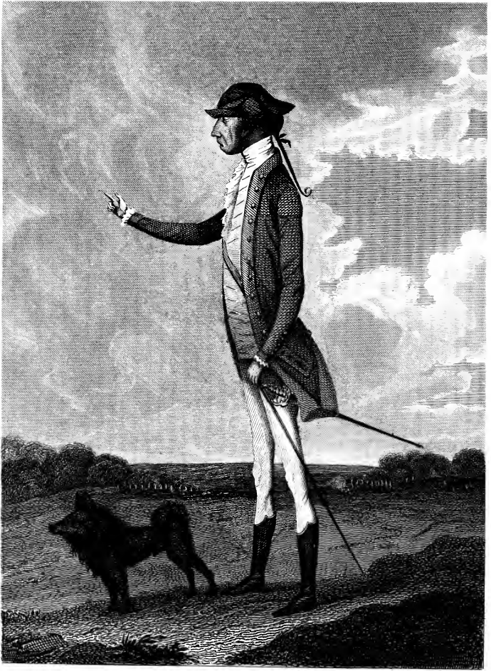
THE MAN OF THE MOUNTAIN