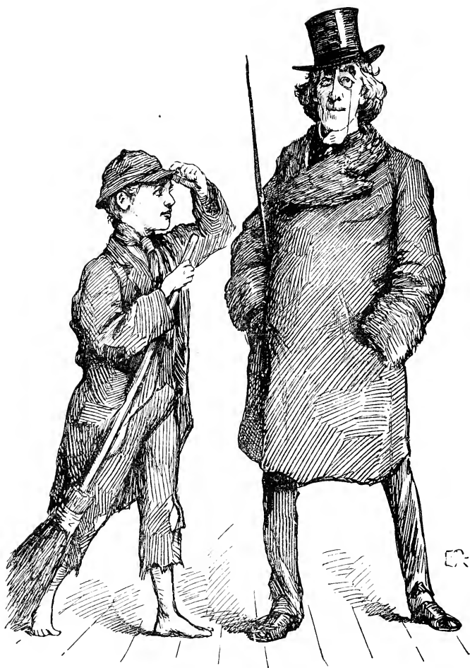
THE LITTLE CROSSING-SWEEPER.