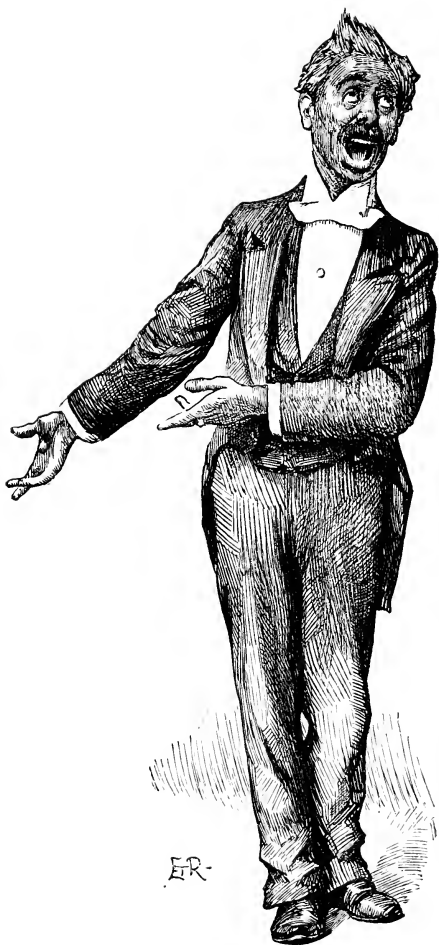
THE PLAINATIVELY PATHETIC.