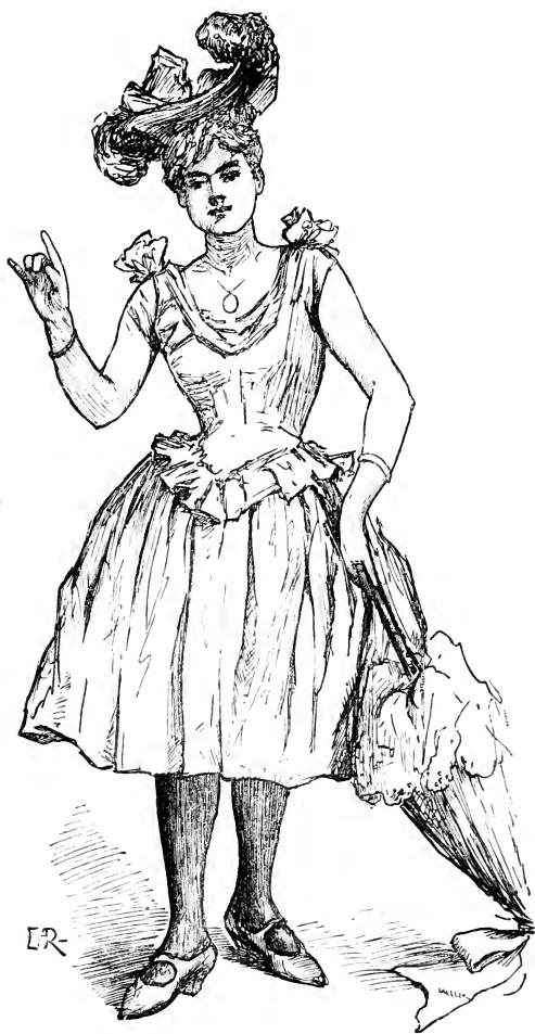
THE PANEGYRIC PATTEN.