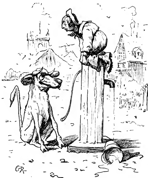
On top of the Pump.

Lydia. Bull, I'll turn naughty, if you'll but be lenient ! Goodness, I see, is sometimes inconvenient. I promise you henceforth I'll try , at any rate, To act like children who are unregenerate !