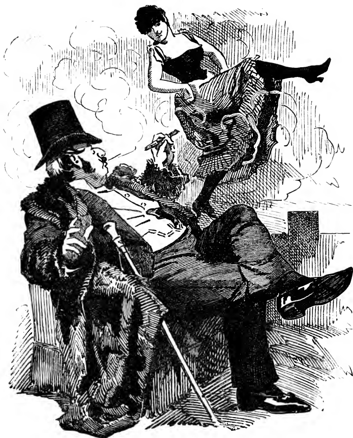
MUSIC HALL PROPRIETOR.