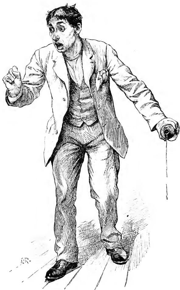
THE DRAMATIC SCENA.