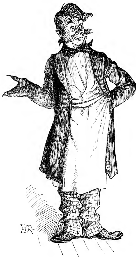
A DEMOCRATIC DITTY.