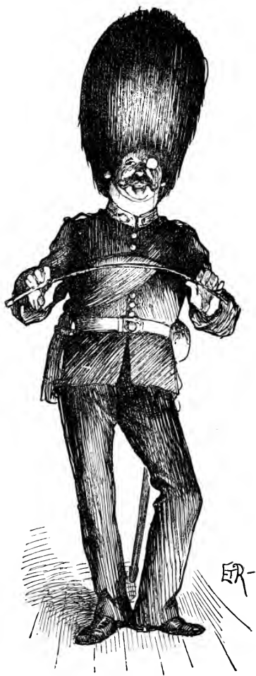
THE MILITARY IMPERSONATOR.