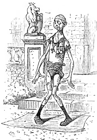
Lord B. in tights.