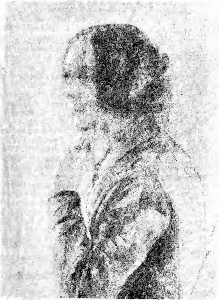
Young Welsh Priest etc from the original in water color and pen — Boston —