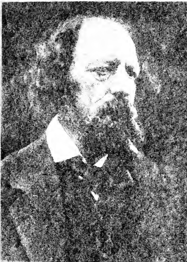
Alfred, Lord Tennyson