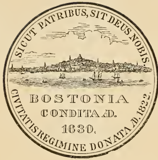
SEAL OF THE CITY.