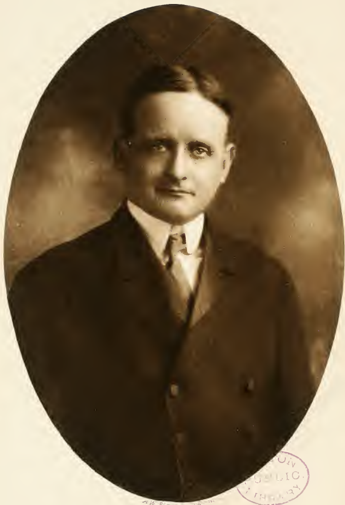
John F. Fitzgerald.