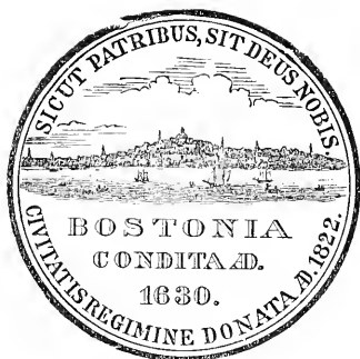
SEAL OF THE CITY OF BOSTON.