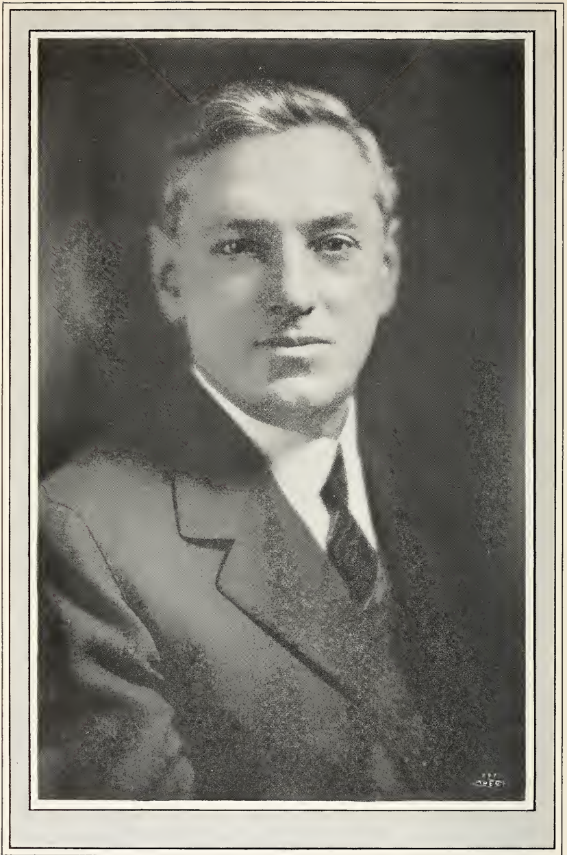
James M. Curley MAYOR OF BOSTON