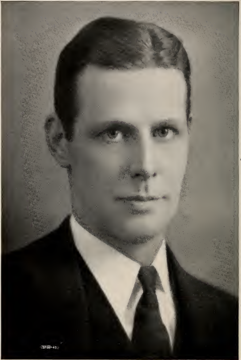
Maurice J. Tobin MAYOR OF BOSTON