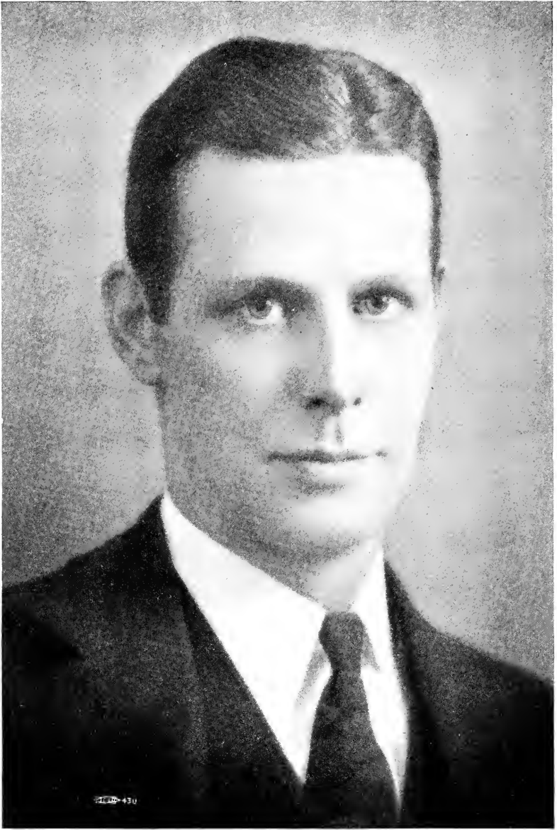
Maurice J. Tobin MAYOR OF BOSTON