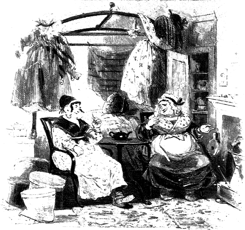
Mrs. Gamp proposes a toast