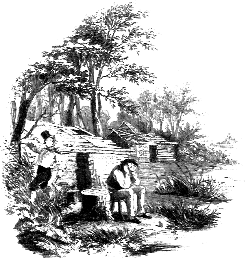
The thriving City of Eden as it appeared in fact