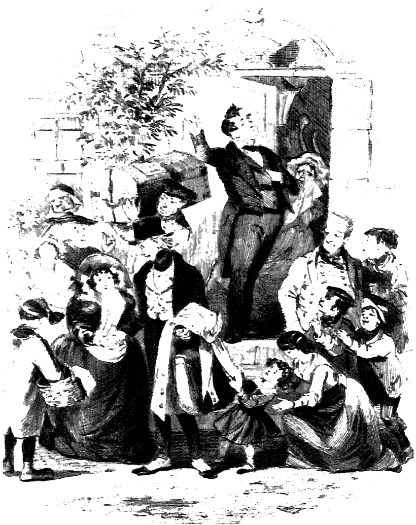
Mr. Pecksniff discharges a duty which he owes to Society