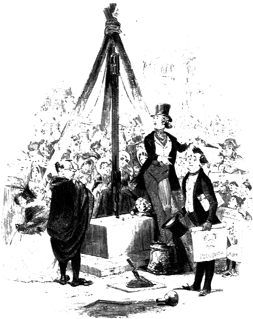
Martin is much gratified by an imposing ceremony