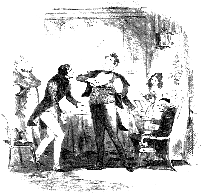
Mr. Pecksniff announces himself as the shield of Virtue