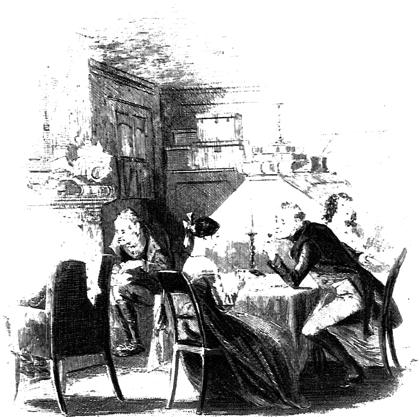
Mr. Jonas Chuzzlewit entertains his cousins