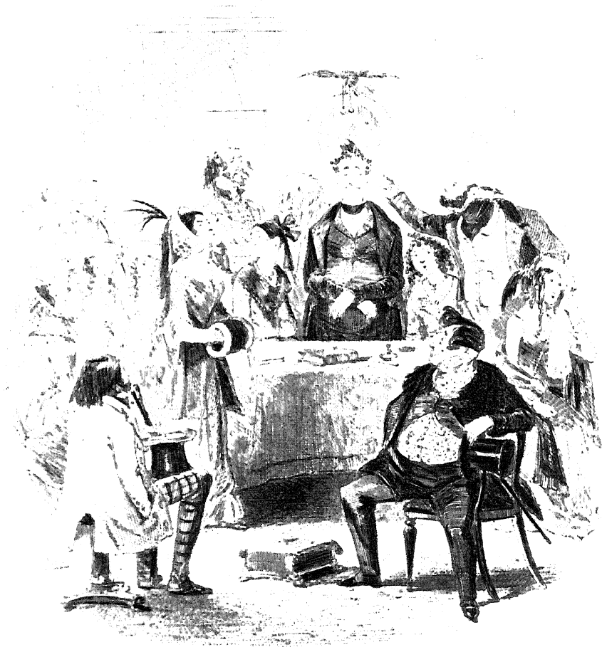
Pleasant little family party at Mr. Pecksniff's