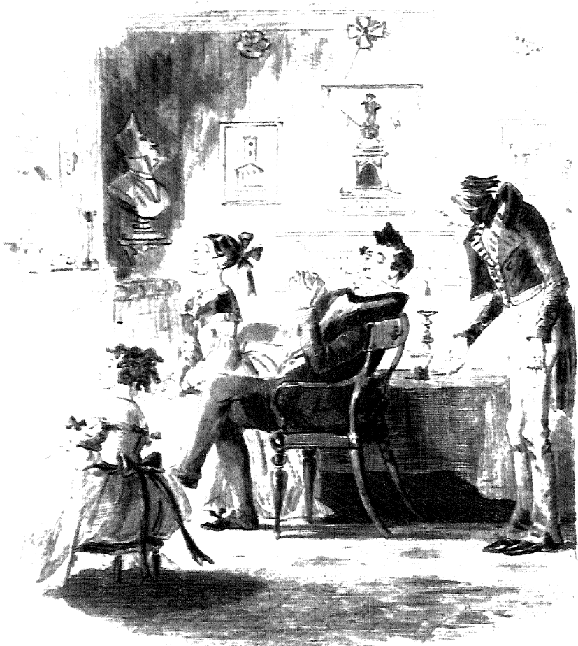
Meekness of Mr. Pecksniff and his charming daughters