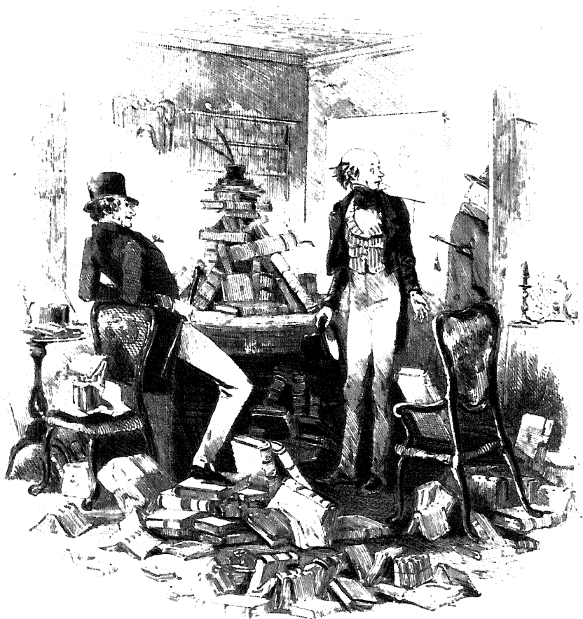
Mysterious installation of Mr. Pinch