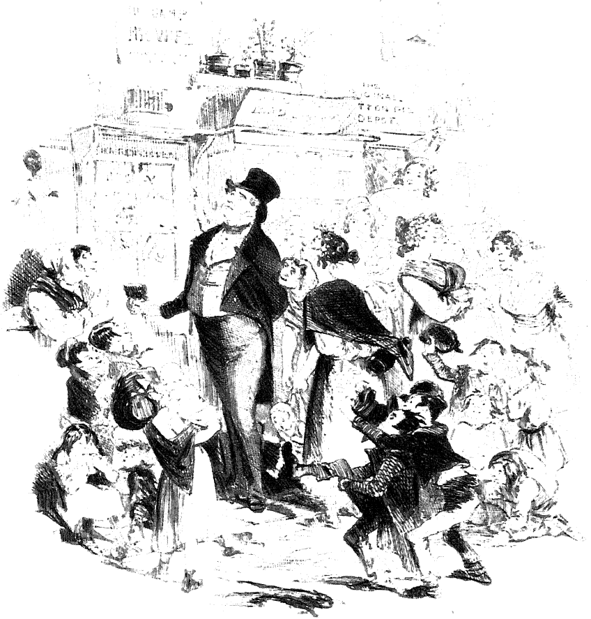
Mr. Pecksniff on his Mission