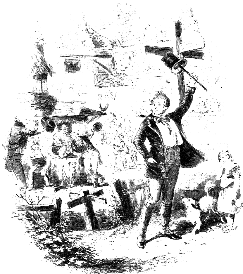
Mark begins to be jolly under creditable circumstances