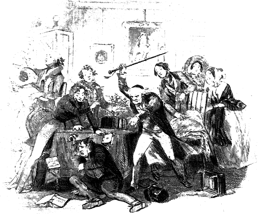
Warm reception of Mr. Pecksniff by his venerable friend