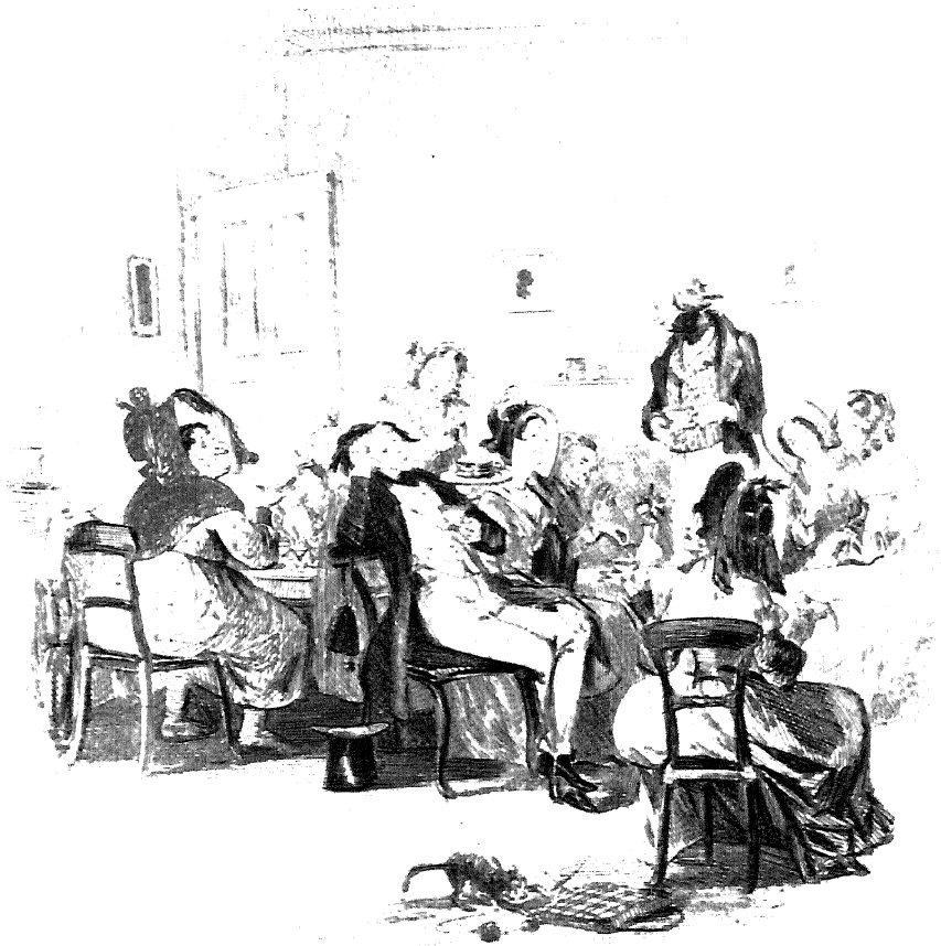
Mrs. Gamp makes tea