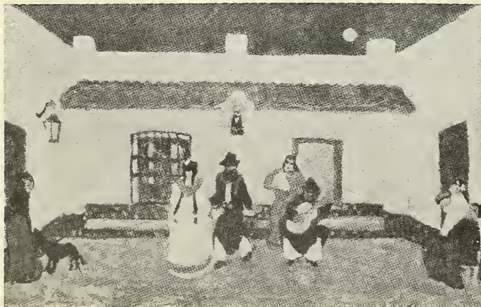
Uruguayan Dance Oil by the painter Pedro Figari

One of the leading composers of the nationalist school in Cuba was Ignacio Cervantes (1847-1905), an outstanding pianist whose Danzas Cubanas compare favorably with the best piano pieces of Grieg. He also wrote a symphony in C minor and other works for orchestra.