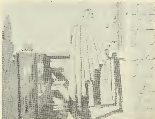
A musician in El Beni, in Bolivia, plays a 12-barreled panpipe. One of the most widely-used instruments in western South America, the panpipe is also one of the oldest, going back to pre-Columbian times.