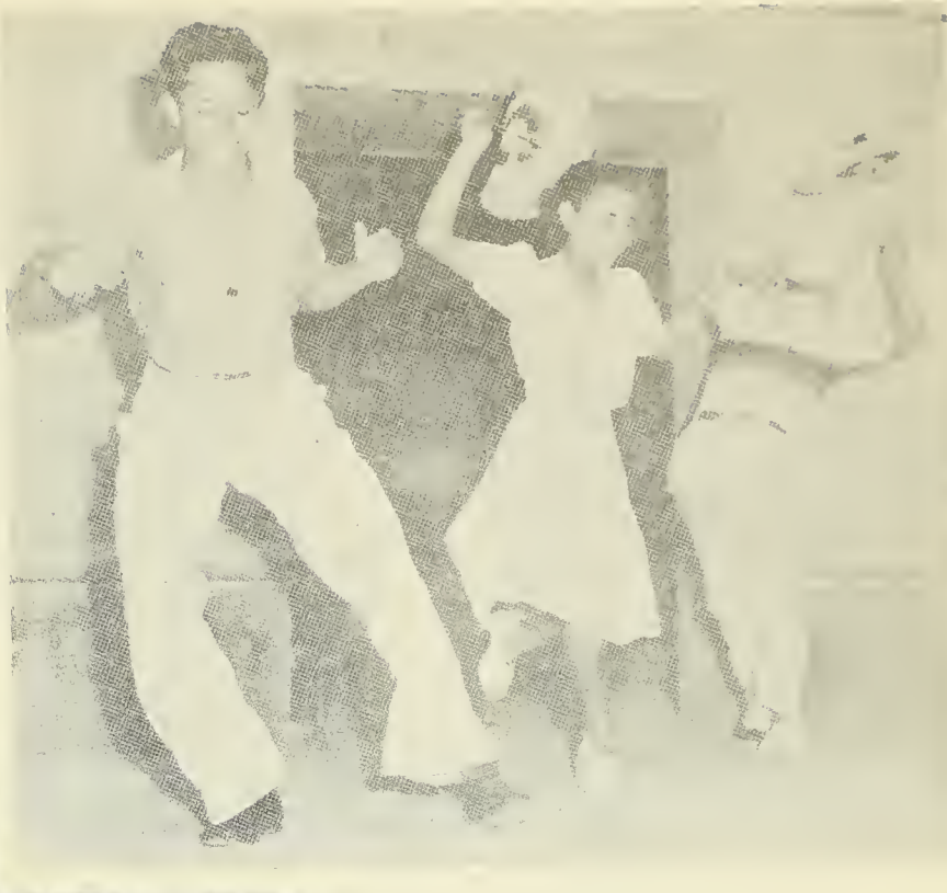
Steps of the Frêvo Carnival Dance of North Brazil