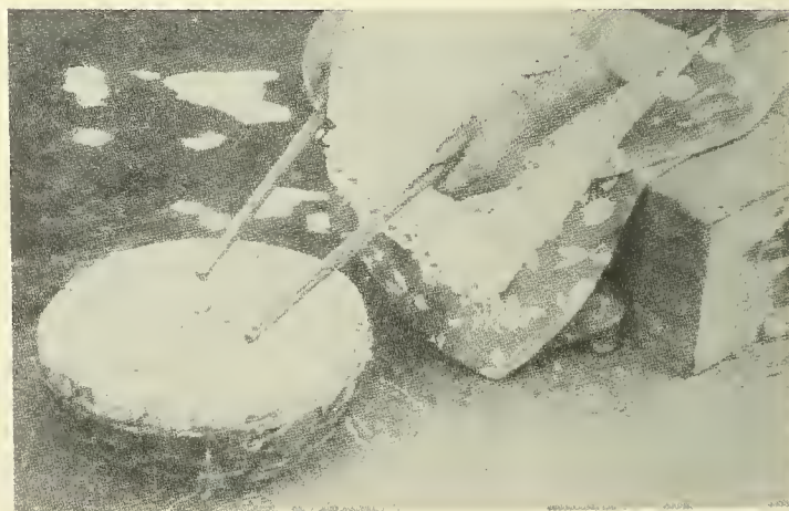
Araucanian Kultrum Kettledrum of the Araucanian indians of Chile