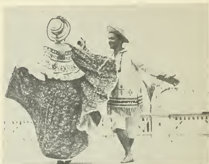
Tamborito Panamanian Dance