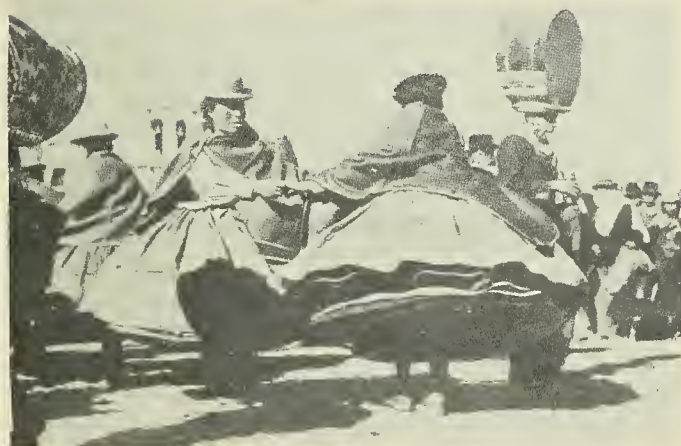
Huayño Bolivian Dance

the 16th century, Spain introduced African slaves into the Caribbean Islands and Portugal sent Negroes to Brazil. Thus the seeds were sown for what was to become one of the most important strains in contemporary Latin American music.