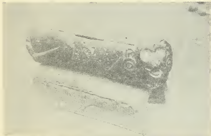
Mixtec Teponaztli Pre-Columbian wooden drum of Mexico