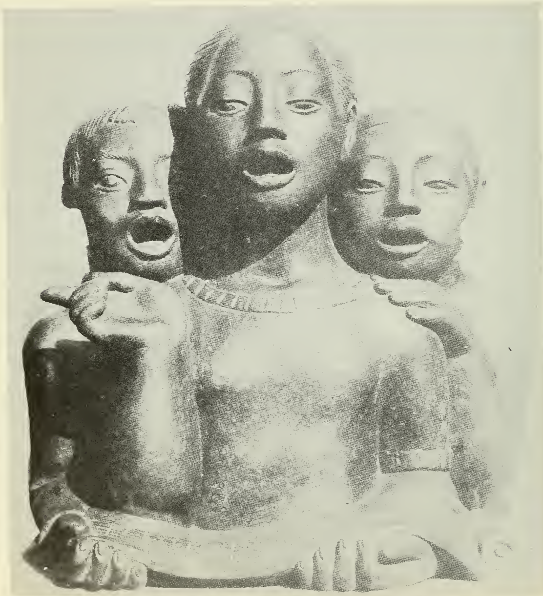
Children Singing Bronze by the Costa Rican sculptor Francisco Zúñiga