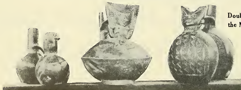
Double whistling jars of the Mochican Indians of Peru

In addition to these three great civilizations - the Maya, Aztec, and Inca - the Chibchas of Colombia and Venezuela, the tribes of the Amazon Valley, and those of the Paraguay and Plata regions had also attained some musical development in pre-Columbian times. Their music was, however, much more rudimentary than that described above. The Chibchas had some musical instruments and it is known that their religious ceremonies were accompanied by music. Instruments that have survived point to the existence of a pentatonic scale, but nothing remains from which to reconstruct their melodies.