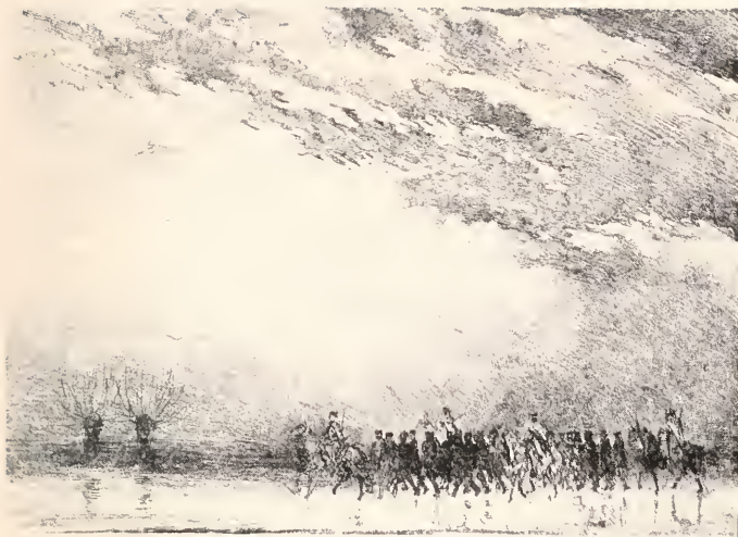
THE RETREAT FROM CHARLEROY TO THE MARNE