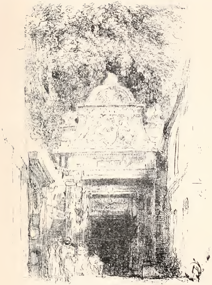
THE COLLEGE DOOR, SOISSONS