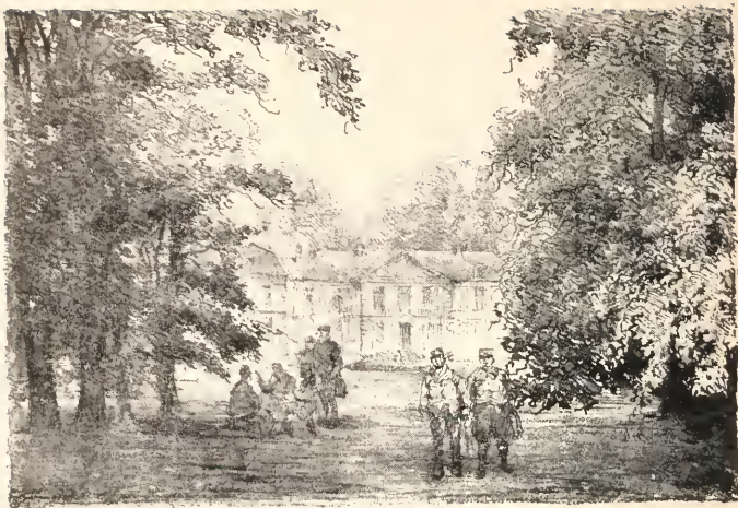
THE CHATEAU DE VILLIERS