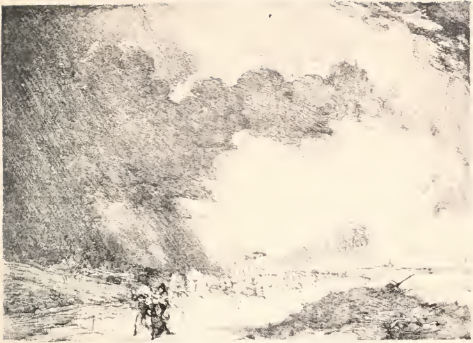
SOMEONE GOT NEWS THAT HIS FAMILY HAD FLED DURING THE INVASION