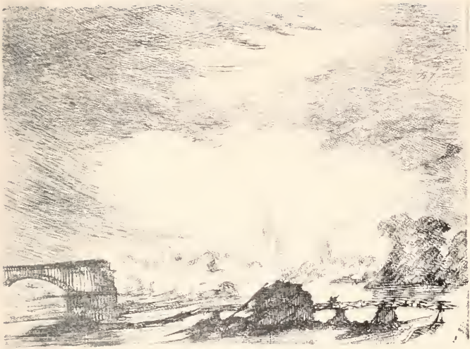
VIEW OF SOISSONS FROM THE PONT DE VILLENEUVE