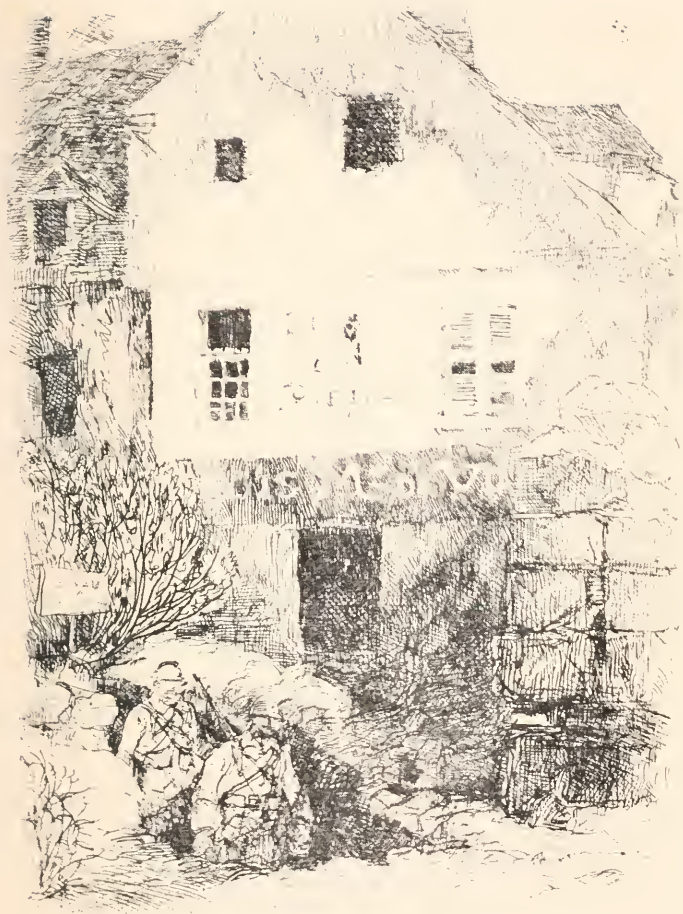
ENTRANCE TO THE TRENCHES NEAR THE PONT-NEUF, SOISSONS