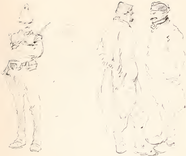
CALM AMID THE GENERAL TUMULT