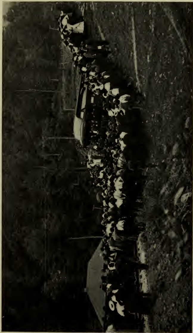
MR. WASHINGTON ADDRESSING AN AUDIENCE OF VIRGINIA NEGROES