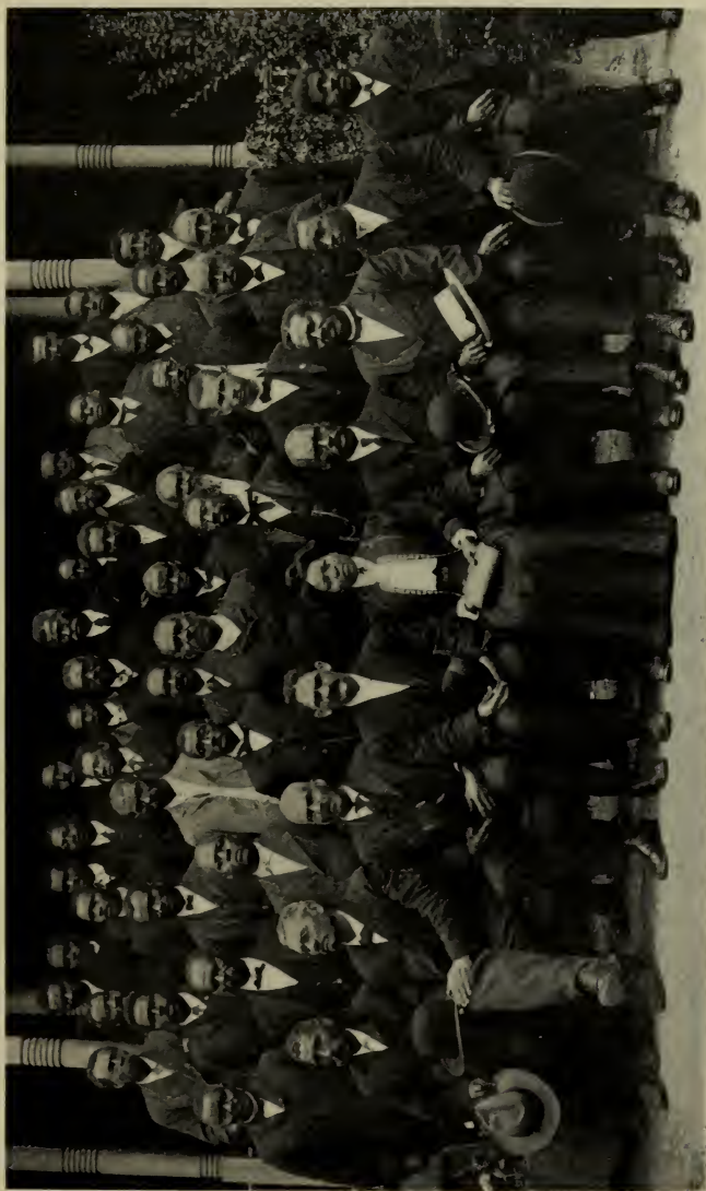
A MEETING OF THE NEGRO MINISTERS OF MACON COUNTY, ALABAMA