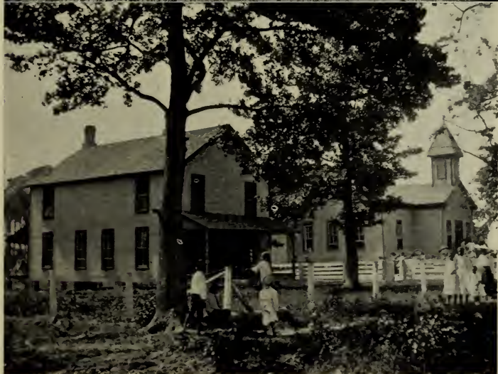
TWO TYPES OF COLOURED CHURCHES