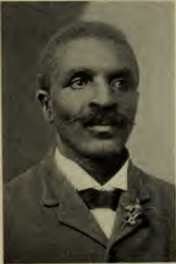
PROFESSOR GEORGE WASHINGTON CARVER

"It has been through contact with men like Major Moton that I have received a kind of education no books could impart"