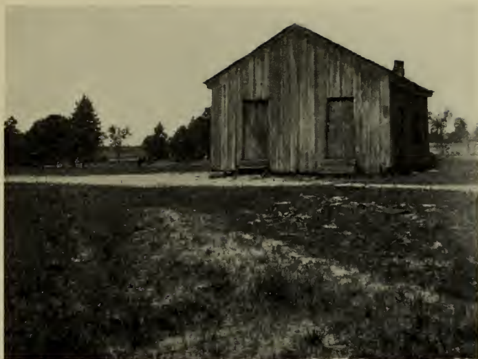
THE "RISING STAR" SCHOOLHOUSE With which the community was once satisfied