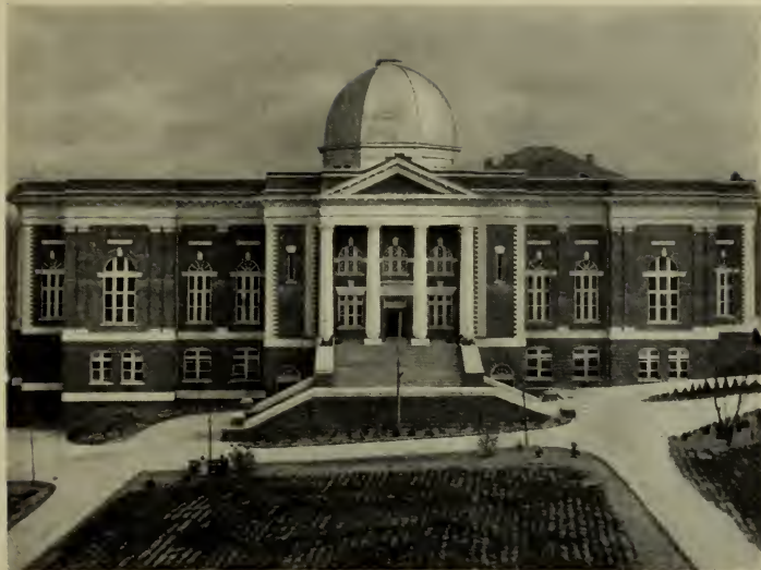
TOMPKINS MEMORIAL HALL, HAMPTON INSTITUTE

In the Tompkins Memorial Hall 1700 students during the school term take their meals three times daily. The building cost approximately $175,000, and is the largest building on the Institute Grounds.