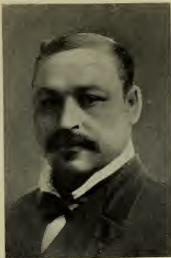
BLANCHE K. BRUCE OF MISSISSIPPI

Lieutenant-Governor 1871 - 72, and afterward Congressman