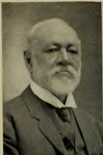
HON. P. B. S. PINCHBACK OF LOUISIANA

Lieutenant-Governor 1871 - 72, and afterward Congressman