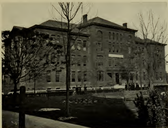
COLLIS P. HUNTINGTON MEMORIAL BUILDING Tuskegee Institute