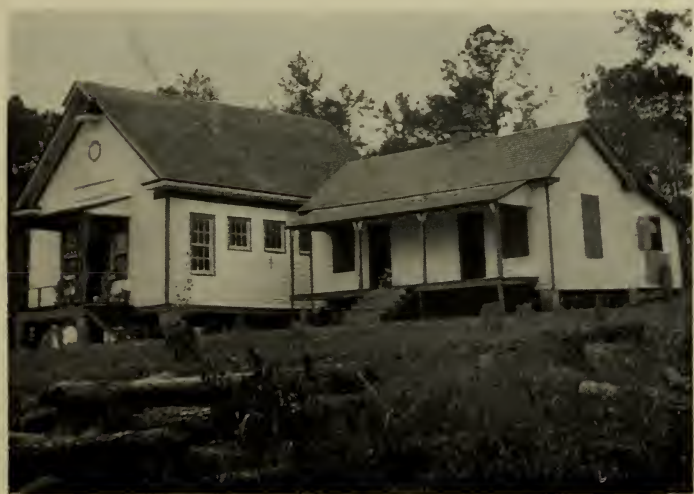
“WASHINGTON MODEL SCHOOL,” ALABAMA With dwelling for its two teachers