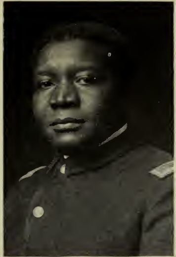
MAJOR ROBERT RUSSA MOTON