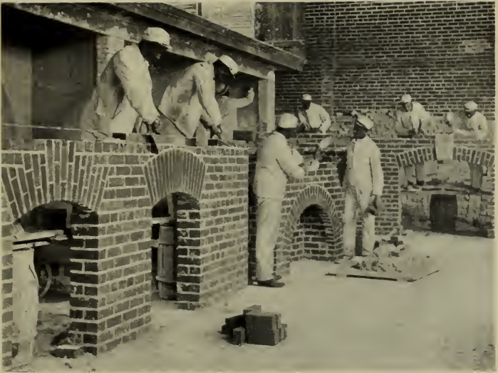
BRICKLAYING AT HAMPTON INSTITUTE