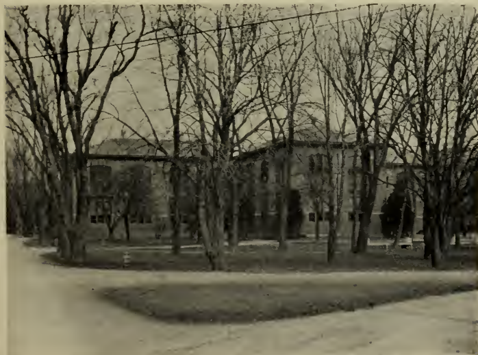
TRADE SCHOOL AT HAMPTON INSTITUTE

In the Tompkins Memorial Hall 1700 students during the school term take their meals three times daily. The building cost approximately $175,000, and is the largest building on the Institute Grounds.