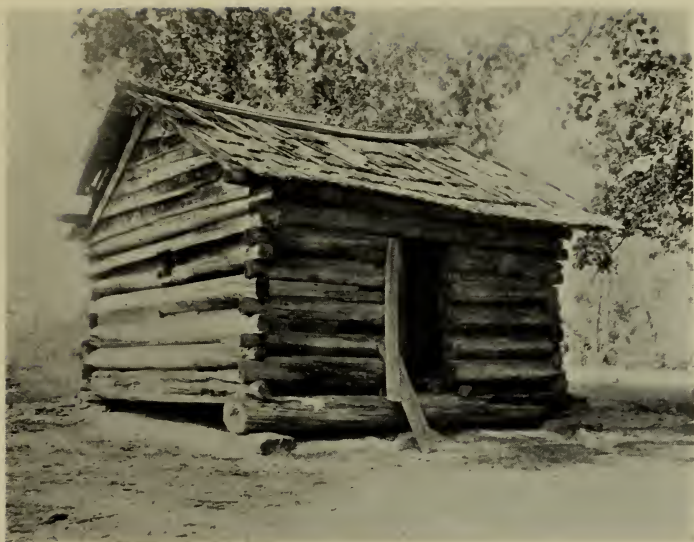
“LITTLE TEXAS” SCHOOLHOUSE, ALABAMA Which has been replaced by a $600 building