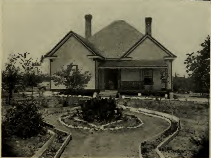
A type of the unpretentious cabin which an Alabama Negro formerly occupied and the modern home in which he now lives