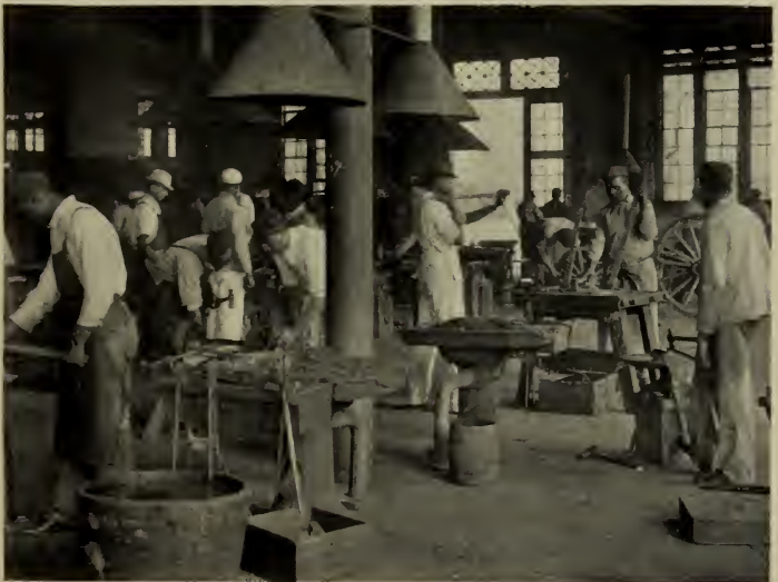
BLACKSMITHING AT HAMPTON INSTITUTE