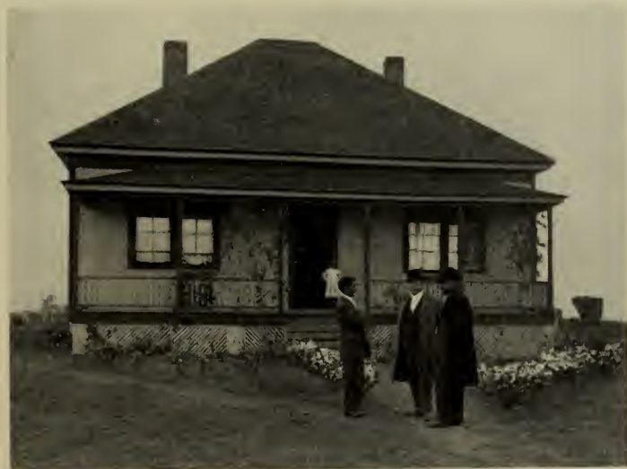
THE "RISING STAR" SCHOOLHOUSE That the changed conditions have produced