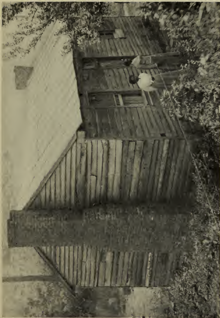
THE HOUSE IN MALDEN, W. VA., IN WHICH MR. WASHINGTON LIVED WHEN HE BEGAN TEACHING