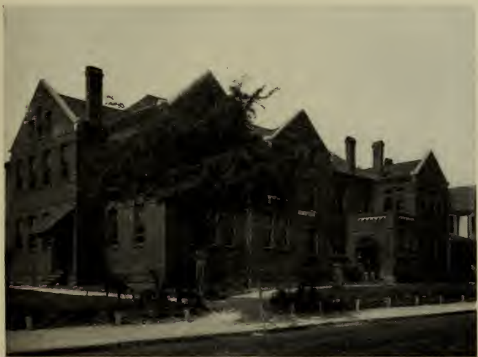
THE OFFICE BUILDING In which are located the administrative offices of the school, the Institute Bank and the Institute Post Office