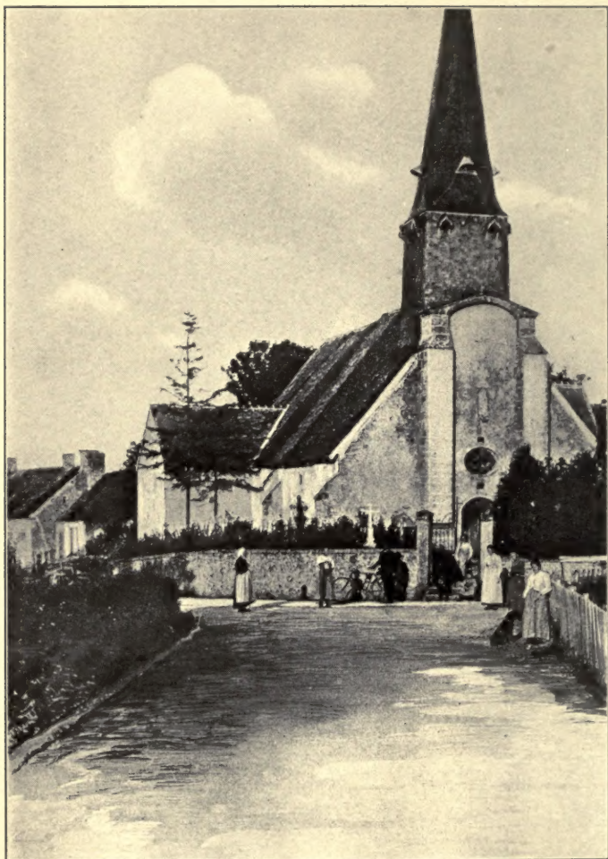
The church and school at Les Aulneaux