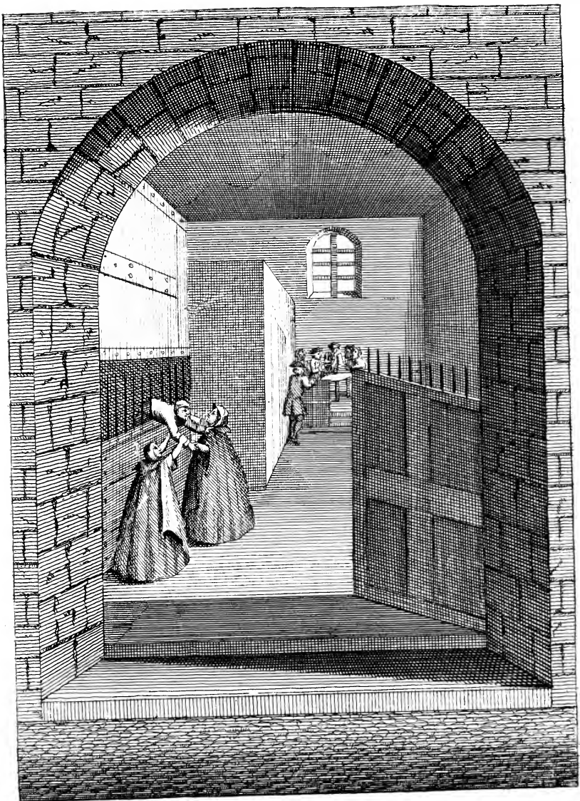
The manner of John Shepherd's Escape out of the Condemn'd Hole in Newgate.