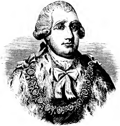
GEORGE THE THIRD.