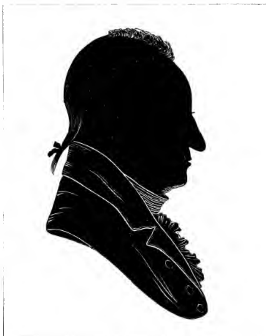
WILLIAM LIVINGSTON, GOVERNOR OF NEW JERSEY.