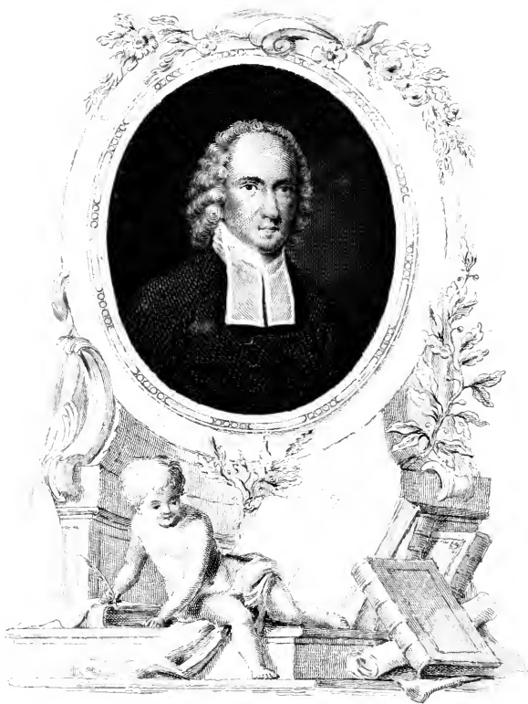
REV. JONATHAN EDWARDS