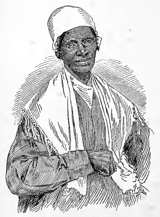
SOFOURNER TRUTH, "THE LIBYAN SIBYL."