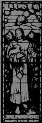
The above is one of a series made for the Congregational Church in East Weymouth, Mass.

Our Studio, which was established in 1941, is today considered one of the outstanding in the United States. We have made windows for practically every denomination, for the Armed Services, for many Missions in foreign lands. Please bear in mind that all windows are made to order. Any detail or thought of your own can be designed into your window. We will be delighted to offer you suggestions or sketches without cost or obligation in any way.