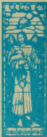
The above is one of a series made for the Congregational Church in East Weymouth, Mass.

This beautiful Della Robbia is one of the many that we import from Italy. The full spectrum of color is used in the border. It is 26½" in diameter by 3-5/8" deep. $400.00.