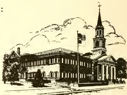
First Congregational Church Wauwatosa, Wisconsin