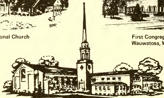
North Shore Congregational Church Fox Point, Wisconsin