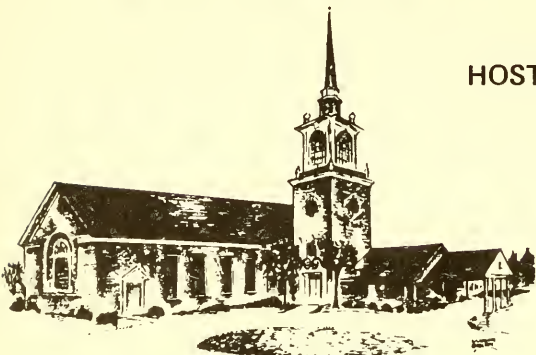
Mayflower Congregational Church River Hills, Wisconsin