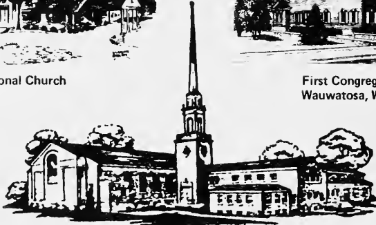
North Shore Congregational Church Fox Point, Wisconsin