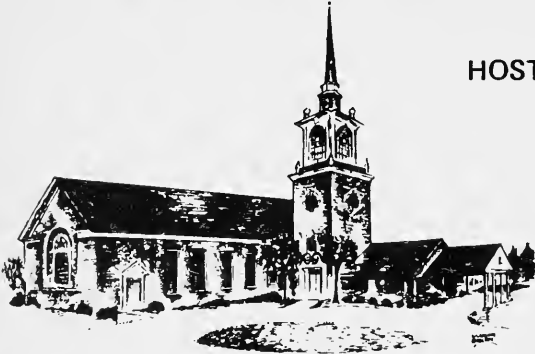
Mayflower Congregational Church River Hills, Wisconsin