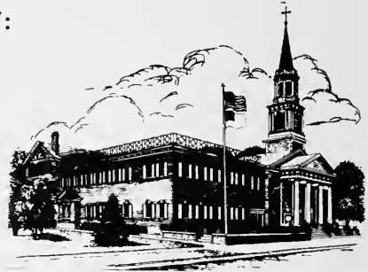
First Congregational Church Wauwatosa, Wisconsin