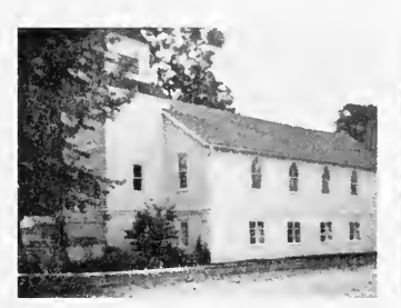
Central Park Congregational Church, Toledo

First Congregational Church, Toledo with Cooperating Hosts